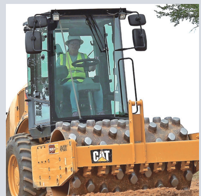
Heavy Equipment Operator Training with a Small Roller