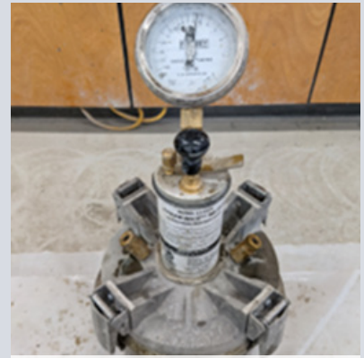
Pressure Meter to Measure Air Content for RFA and GTR Project