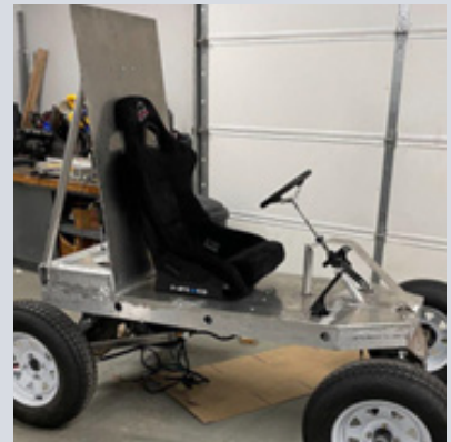
Vehicle Equipped with a Hydrogen Fuel Cell