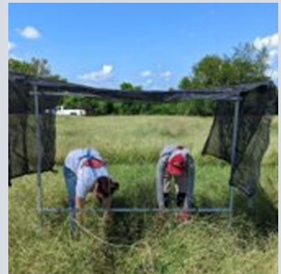
Data Collection on Roadside Vegetation Project