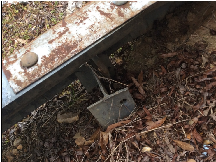
Rail end not attached right side abutment 2

End Post and terminal rail on Rt. side. Have collision damage. 03/01/2016 JPR -- terminal rail is not attached to terminal anchor post.