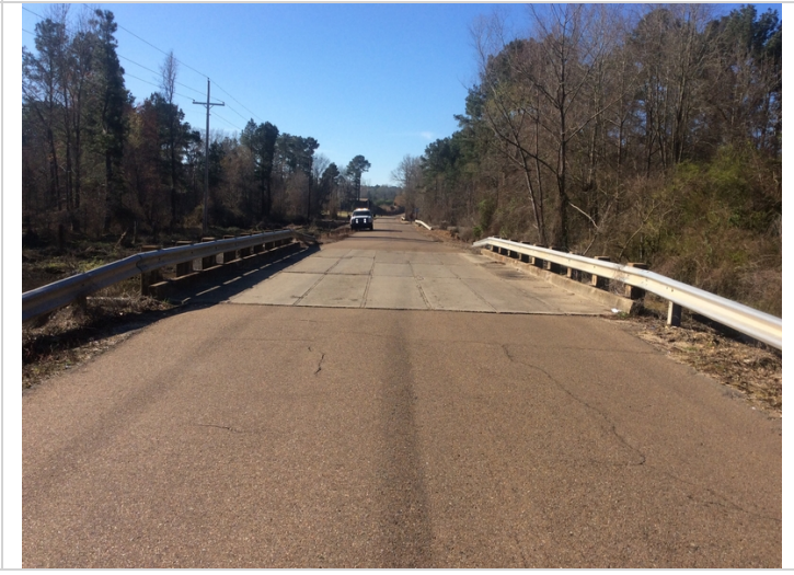
Approach roadway looking south.