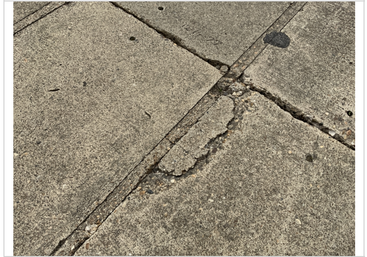
Span 1 unit 5 has spall in deck.