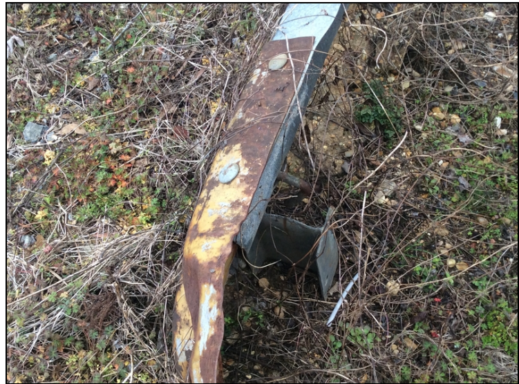
Rail damage right side