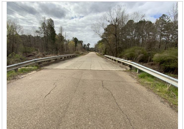
Approach roadway Southbound.