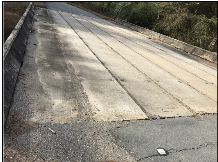
Deck - Spans 1-2 :Typical