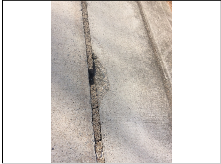
Deck - Span 1 Unit 7: Spall