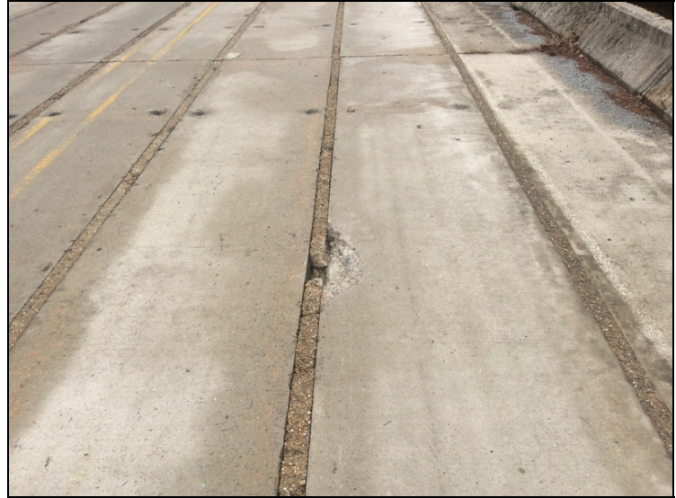
Span 1 unit 7 spall