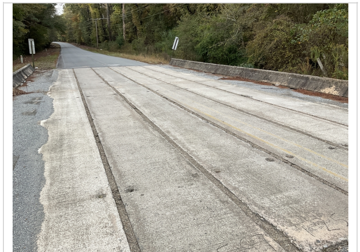
Deck over view.