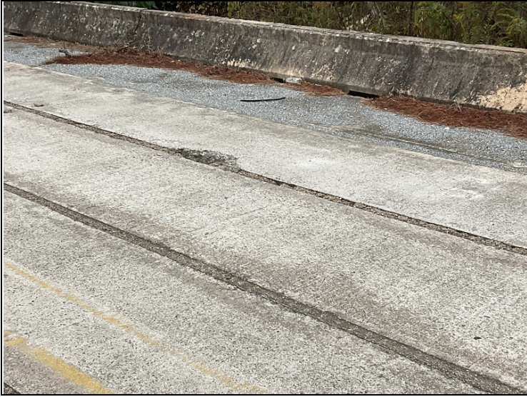
Span 1 girder 7 has spall at keyways.