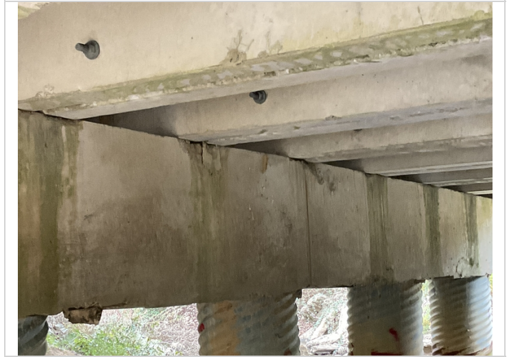
Bent 2 cap under girder 3 has delam and spall.