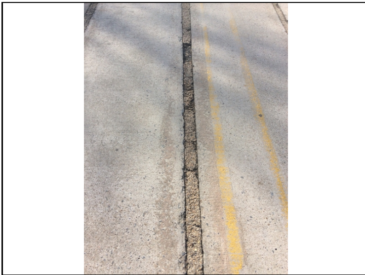
Deck - Span 1 Units 3 & 4: Grout deteriorating

Deck - Spans 1-2: Grout between the units is beginning to deteriorate and break up.