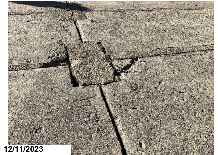
Bent 3 unit 6 end spall