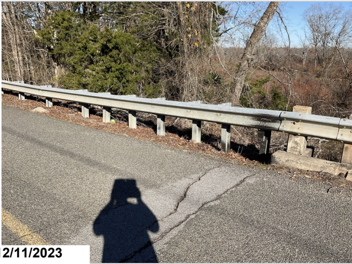
Transition railing end of bridge