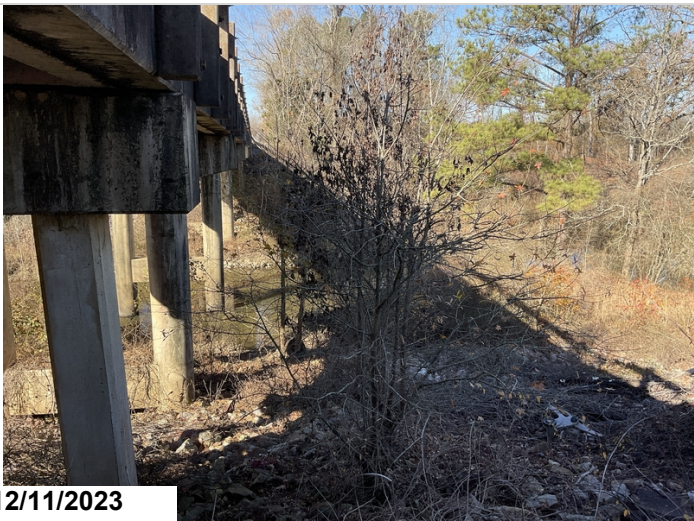
Trees growing on RT side of bridge