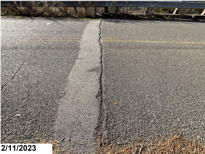
Joint at beginning of bridge covered with asphalt