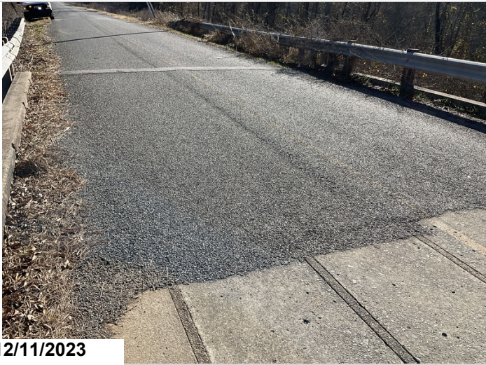
Asphalt covers ring beginning and end bents