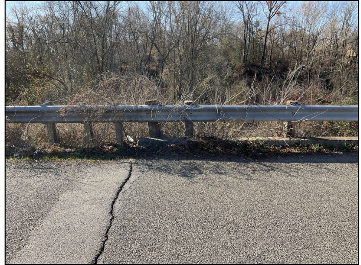
Vegetation LT side