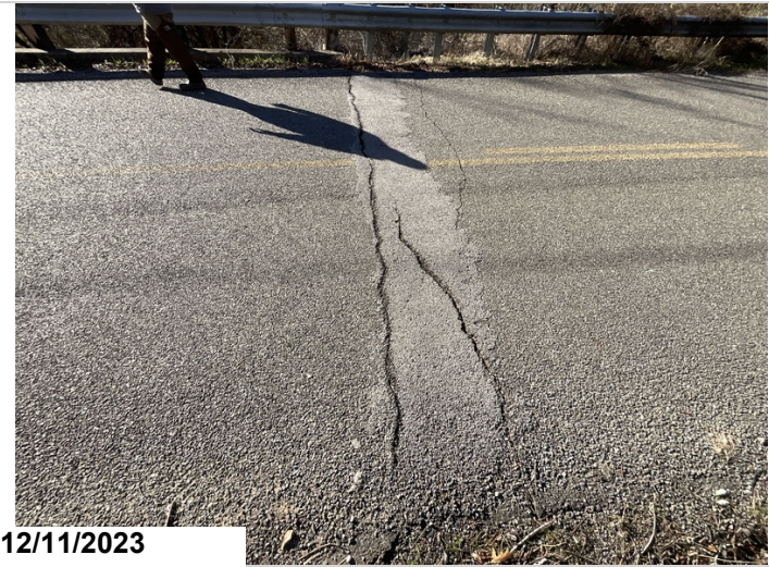
End of bridge joint covered with asphalt