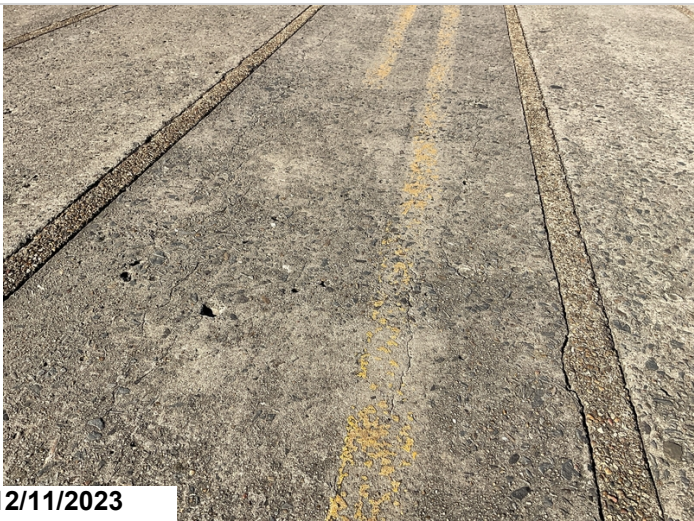
Sealable deck cracks in various locations of top flange