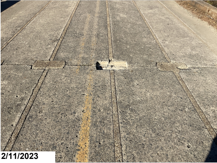
Bent 2 joint spall on centerline