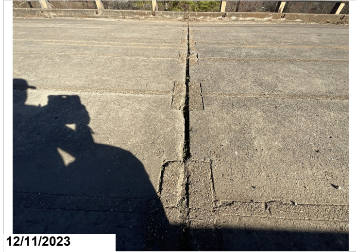
Bent 4 joint