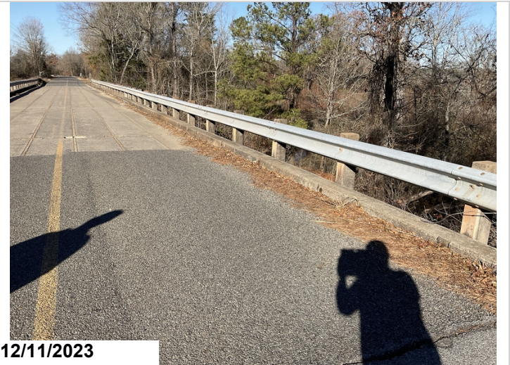
Bridge railing RT side