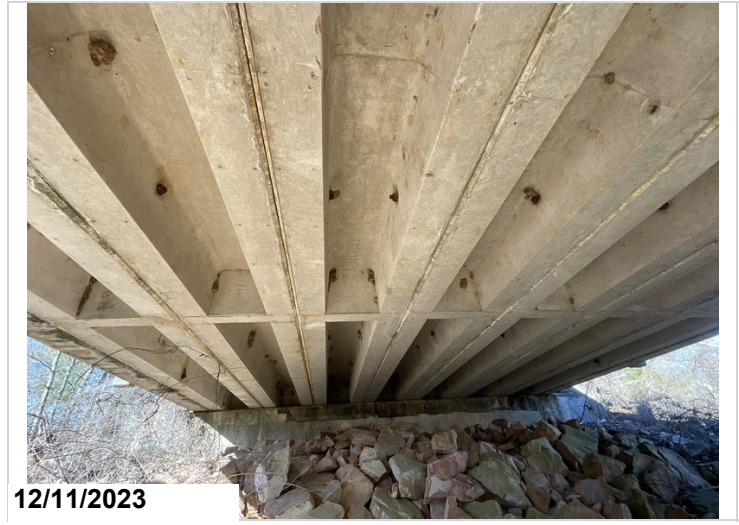
Underside of deck typical