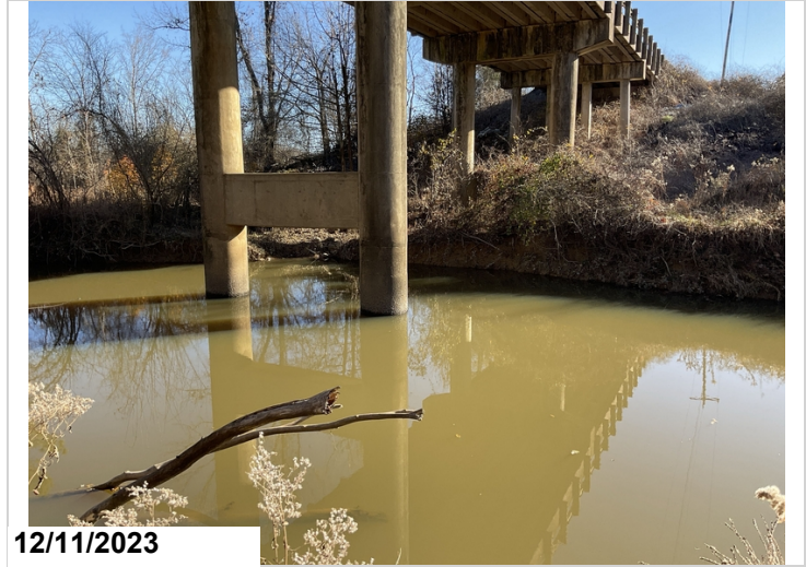
Some scour around bents 4 and 5