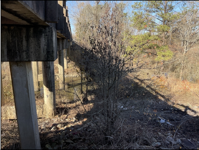
Trees growing on RT side of bridge

Trees and vegetation growing on both sides of bridge.