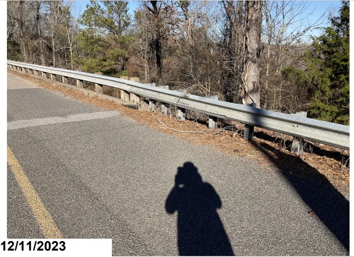
Transition railing at beginning of bridge