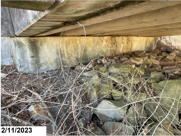
Bent 1 abutment