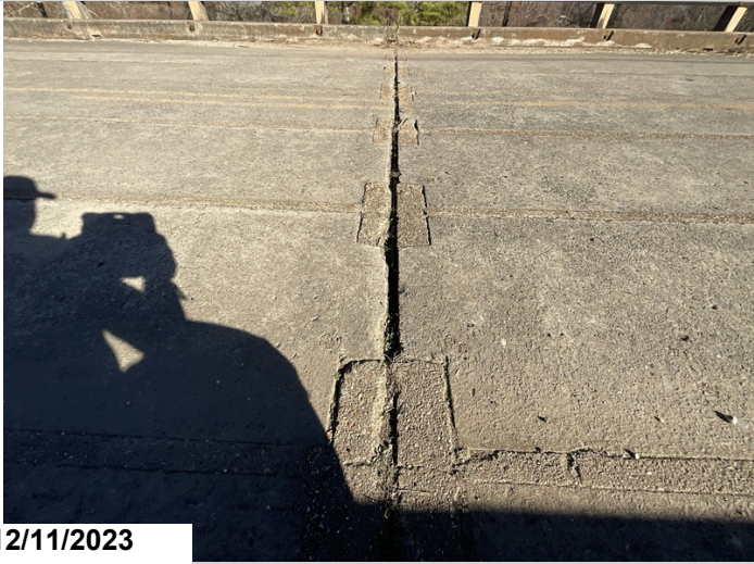
Bent 4 joint