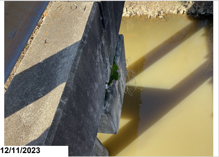
Bent 4 RT side spall on corner of unit above cap