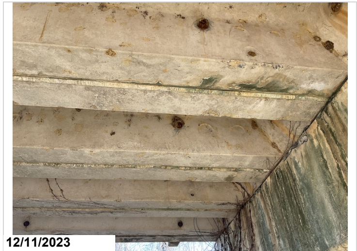
All precast units are bolted together, bolts have corrosion