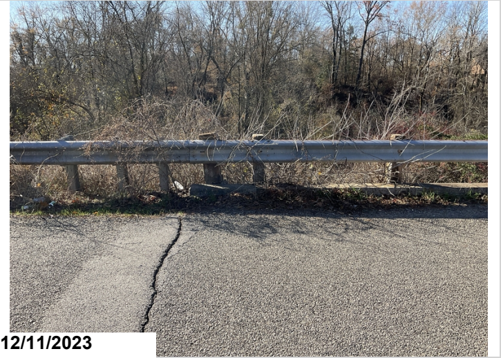
Vegetation LT side