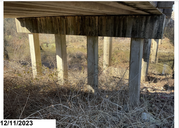
Bent 2 abutment