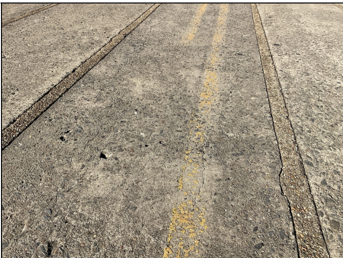
Sealable deck cracks in various locations of top flange

Sealable deck cracks in various locations of top flange.