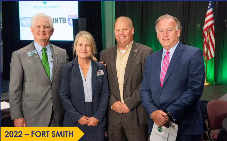
2022 – FORT SMITH