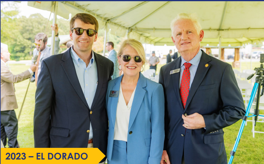
2023 – EL DORADO