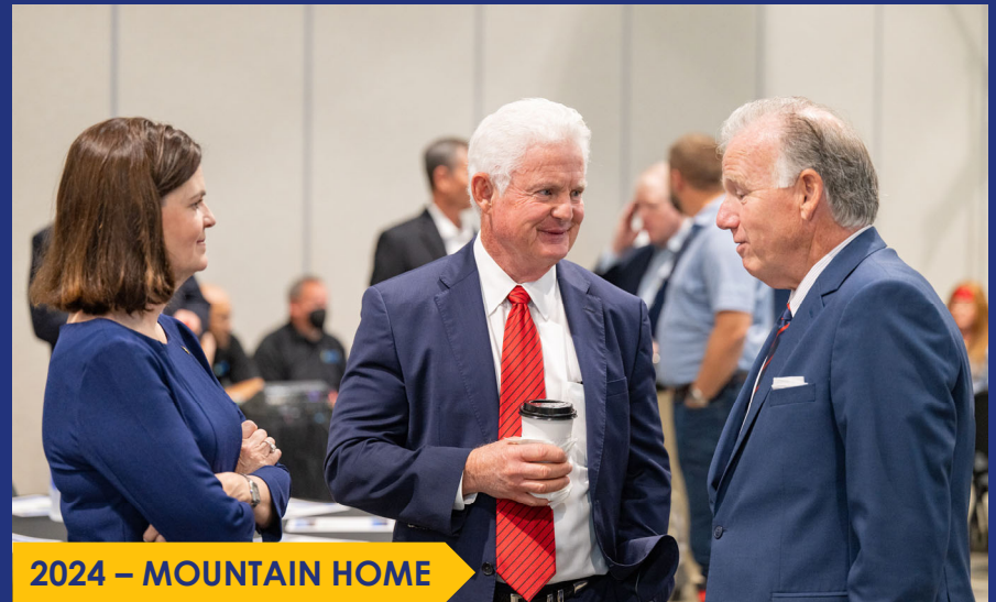
2024 – MOUNTAIN HOME