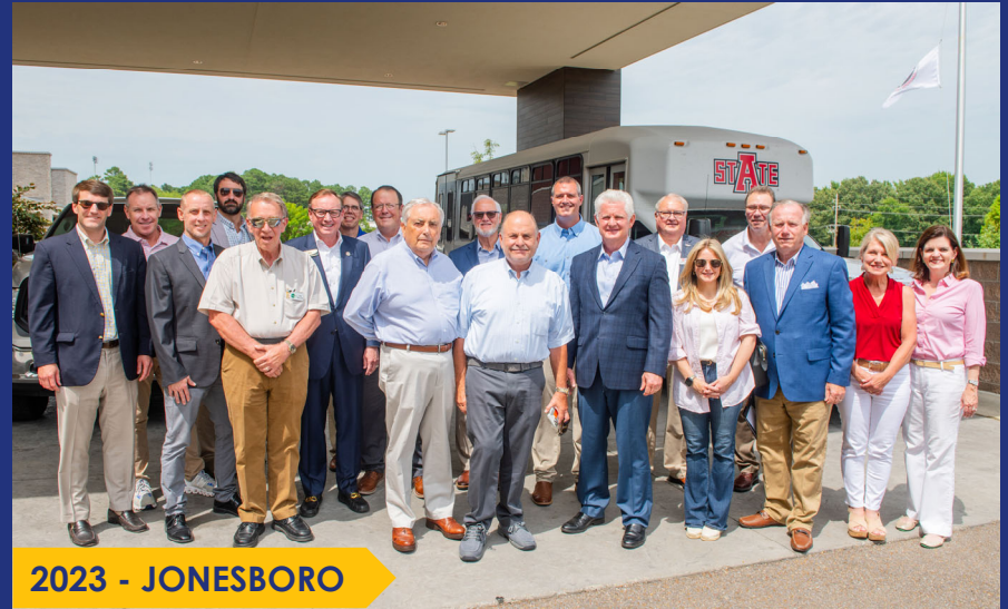
2023 - JONESBORO