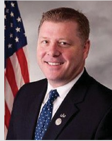
Representative Rick Crawford (R, 1st District)