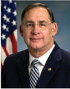
Senator John Boozman (R)

555 Dirksen Senate Office Building Washington, DC 20510 Phone: (202) 224-4843 www.boozman.senate.gov Began: 2011 Re-election: November 2022