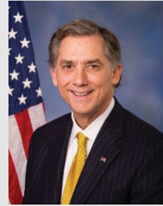
Representative French Hill (R, 2nd District)