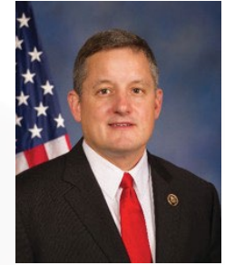
Representative Bruce Westerman (R, 4th District)