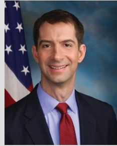
Senator Tom Cotton (R)