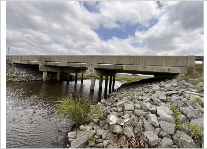
Right side view