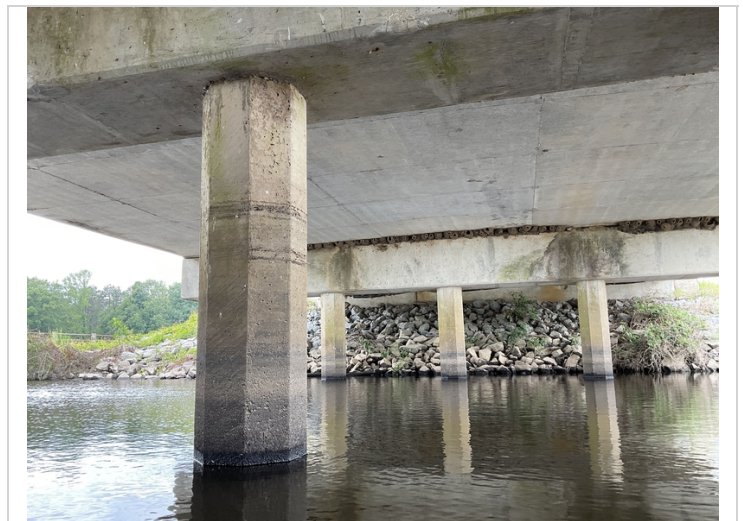
Soffit - Span 2: Typical