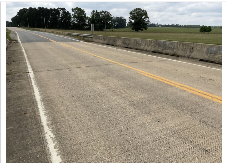
Deck - Spans 1-3: Typical