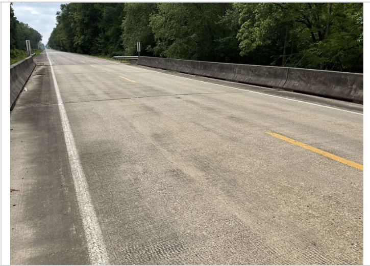
Deck - Spans 1-3: Typical