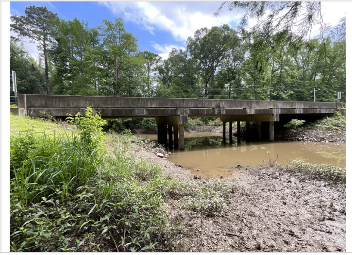
Right side view