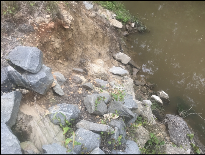
Northwest end of bridge has some local scour to embankment at end slope.

End-slope/channel - Bent 1 left (northwest corner): Some scour/erosion of slope.