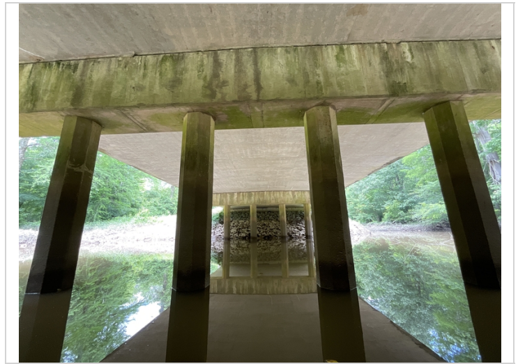
Soffit - Span 2: Typical