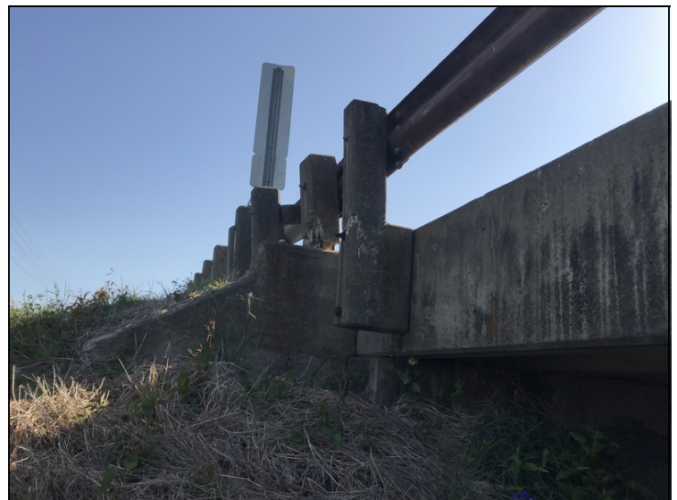
1st and 2nd rail posts on right side broken at bottom.