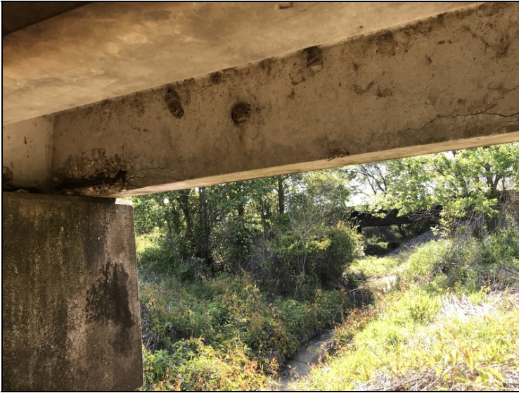
Span #2 unit #1 left leg at bent #2.