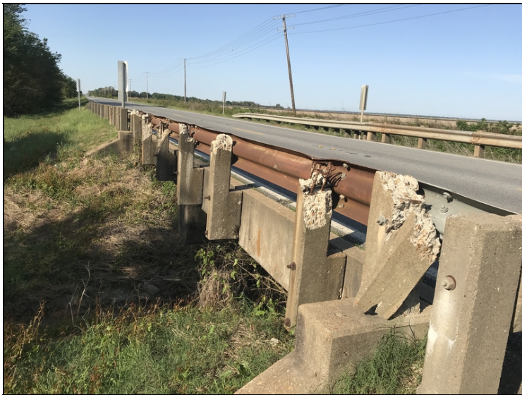
All left side rail posts are spalled with exposed rebar with no section loss.