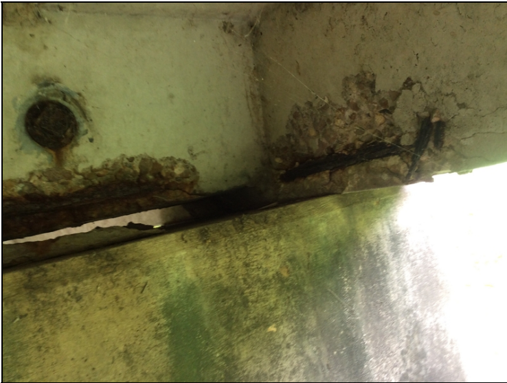
Span #2 unit #1 at bent #2