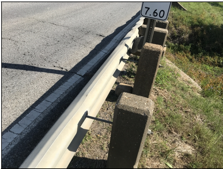
Left approach rail at abutment #2 has 2 missing and 1 broken spacers.