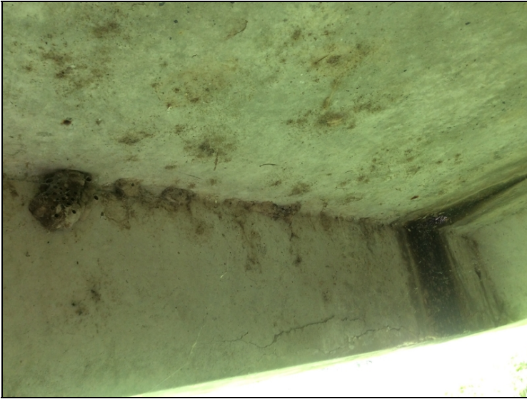
Span #2 unit #1 left leg 3' delamination