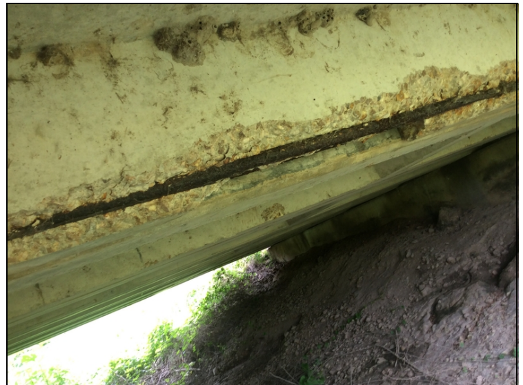
Span #2 unit #7 left leg.