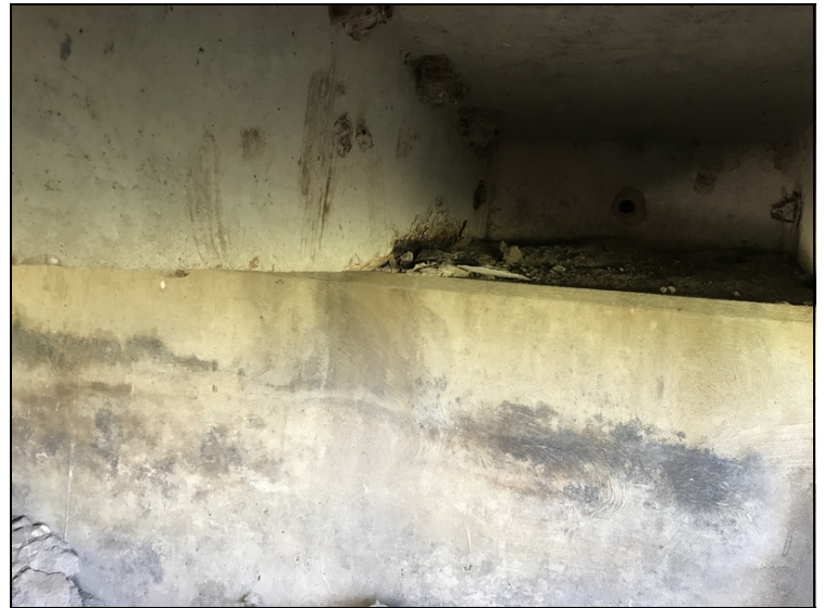
Span #2 unit #6 left leg at abutment #2.