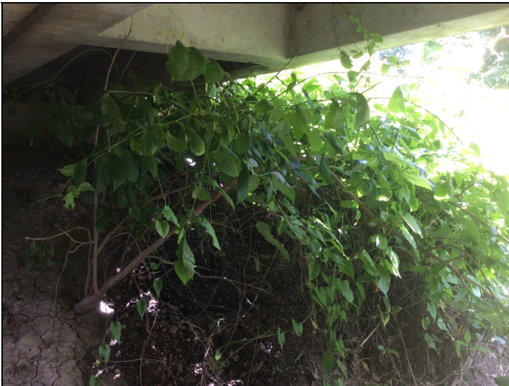
Small trees and vegetation are growing under and beside bridge.