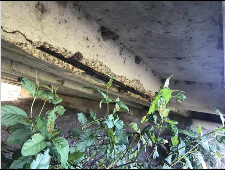
Span #2 girder #7 cracked and spalled full length with 6' of exposed rebar with 10% section loss.