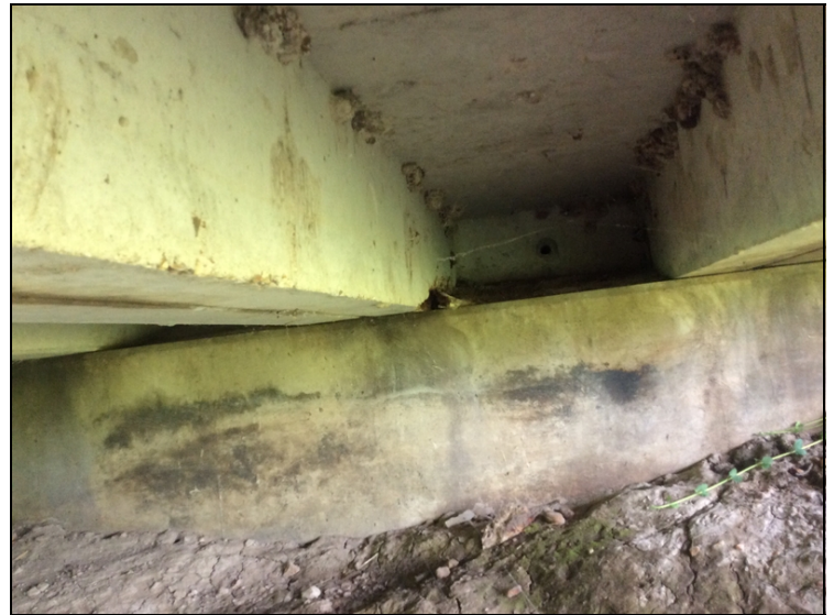
Span #2 unit #6