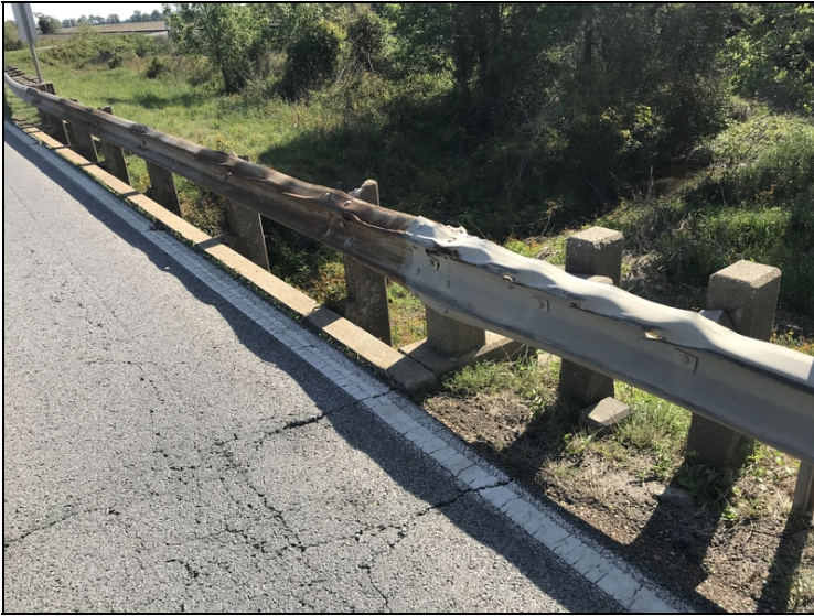
Left rail damage at abutment #2