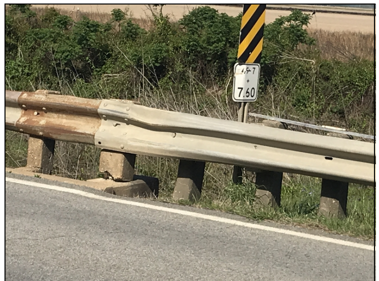
Abutment #1, right side, approach rail damage.