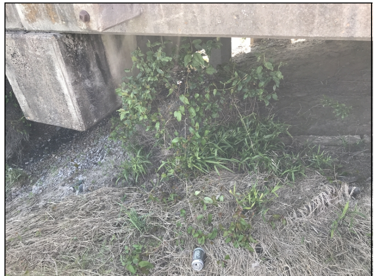
Small trees and vegetation growing beside and under bridge.