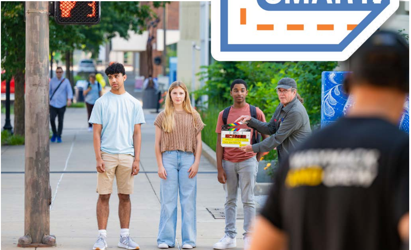
Arkansas teens film Street Smart videos in downtown Little Rock.