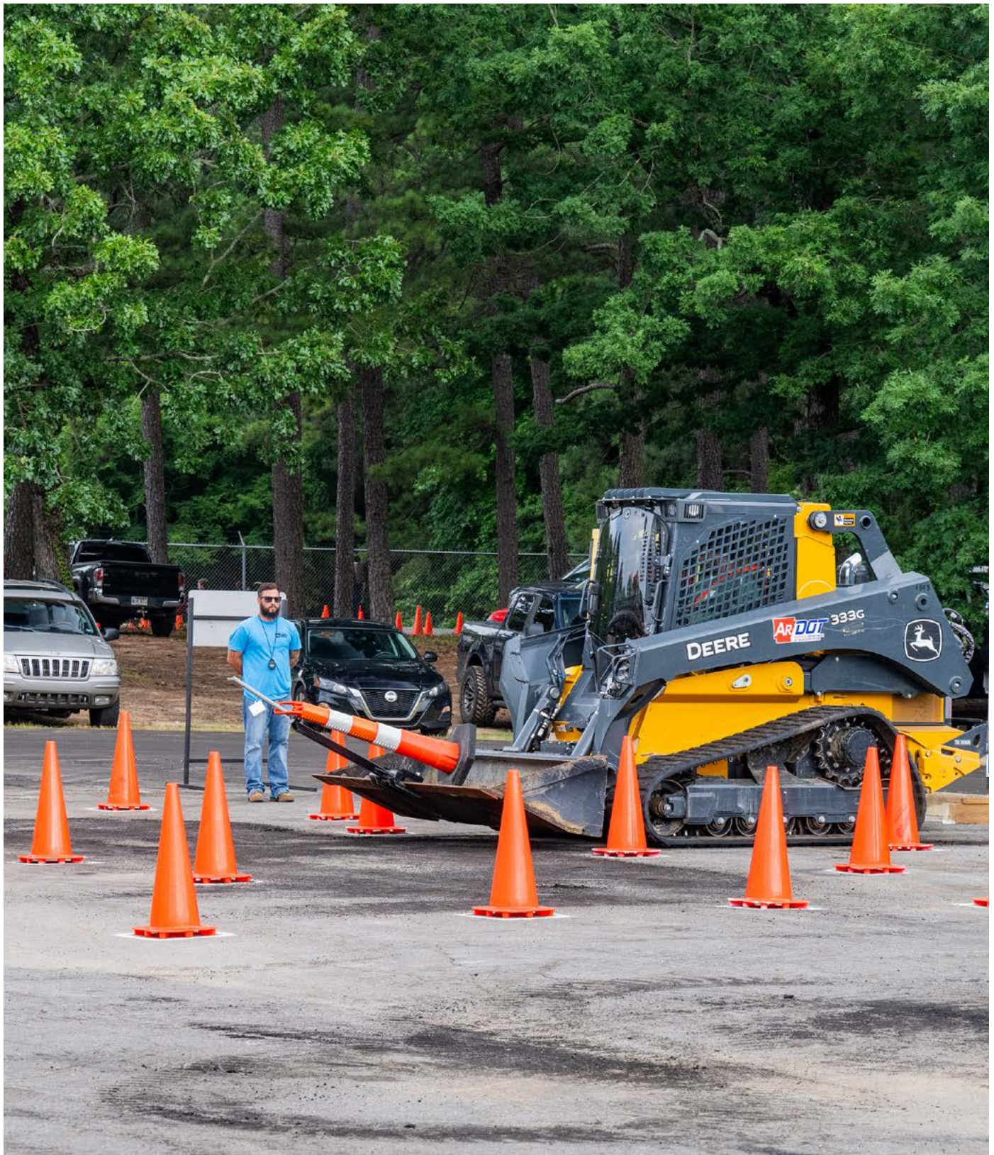
ARKANSAS DEPARTMENT OF TRANSPORTATION | AUGUST 2025