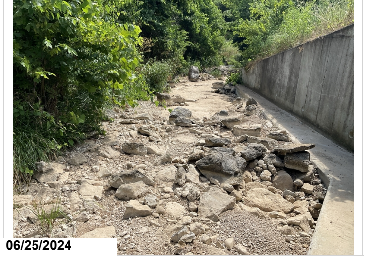
Upstream channel view.