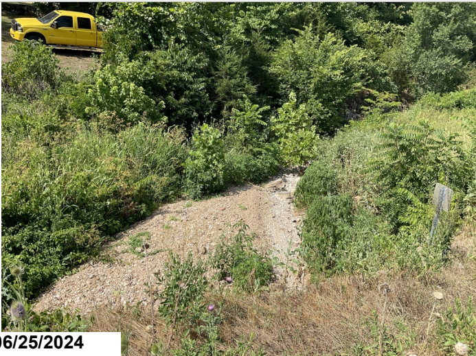
Downstream channel view.