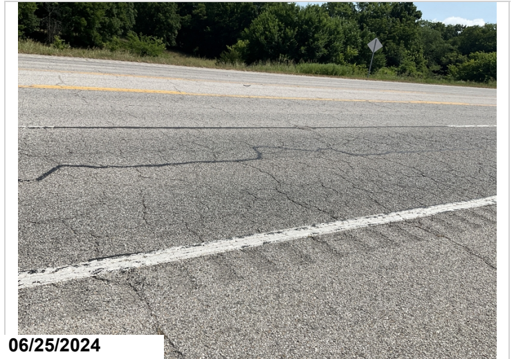
Driving surface view.