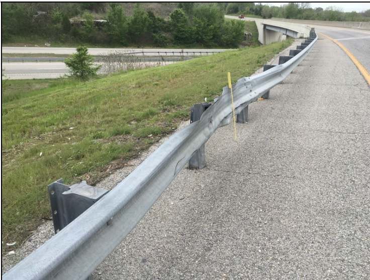
Approach guard rail damage at the right ending of the structure.