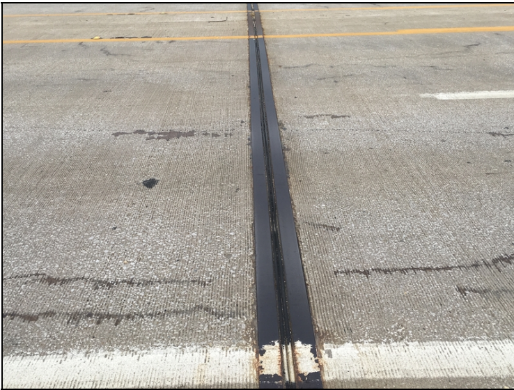
Typical condition of compression joint seal.