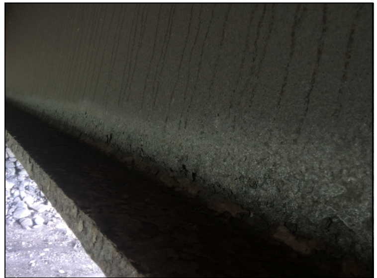
15' of Cs3 corrosion on beam #5 at the end of span #1.