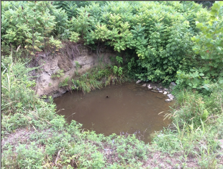
NW of Bridge - Scour in ditch line.