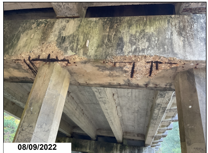
Bt. 4, back side of cap, @ pile 4 & 5, spall with exposed rebar.