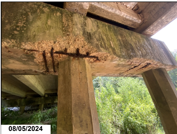
Bent 4 cap bottom exposed rebar