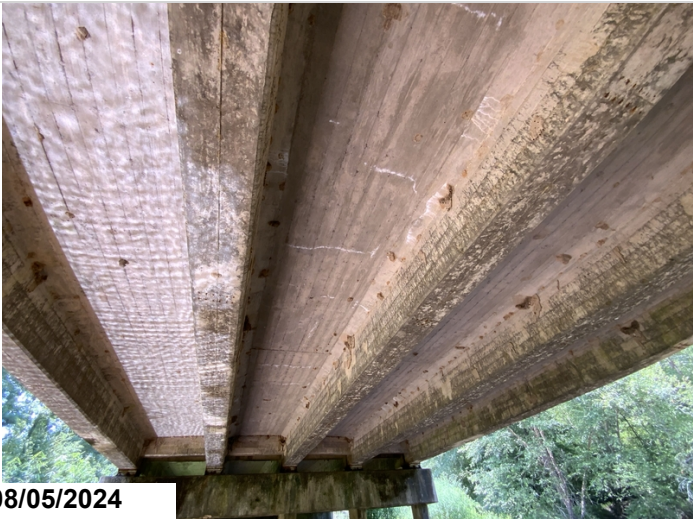
Span 3 looking back bottom surface overview