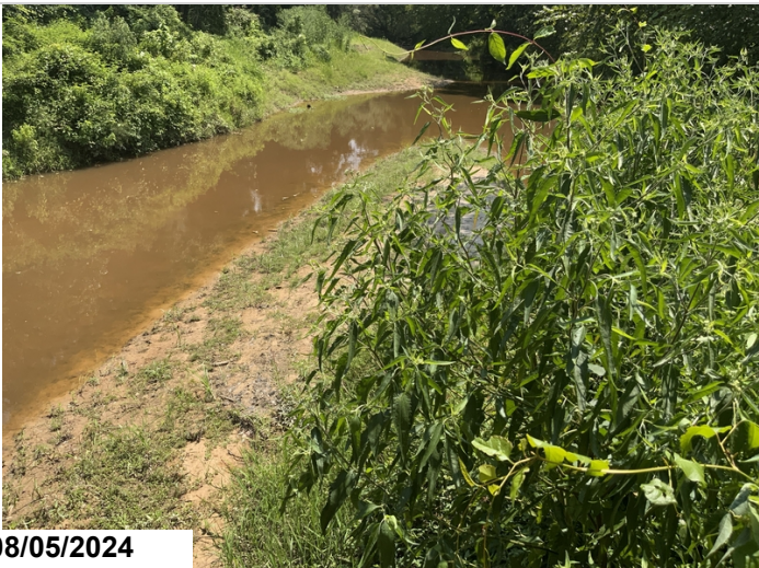
Channel downstream overview left side.