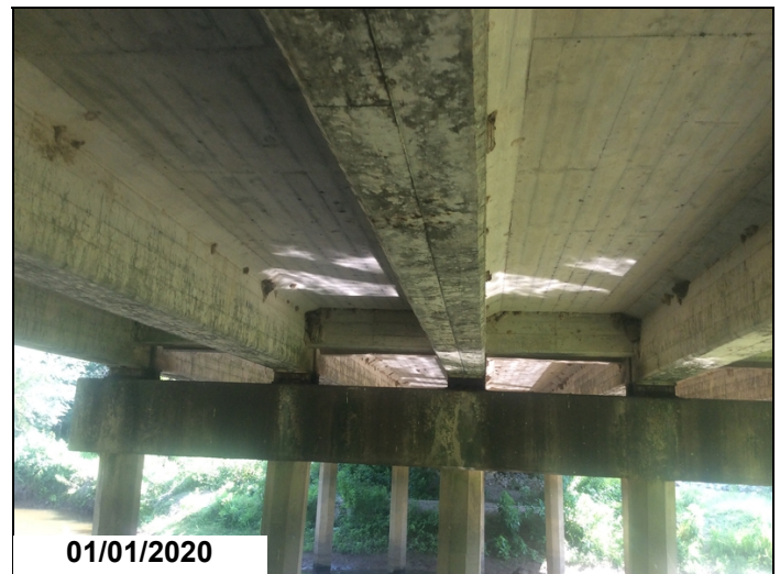
Bt. 3, looking ahead at bearings.