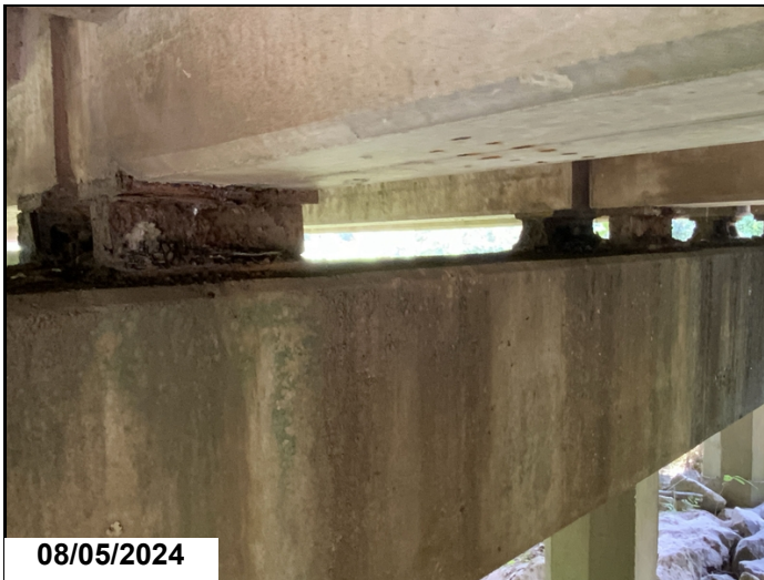
Bearings and plates all bents active corrosion