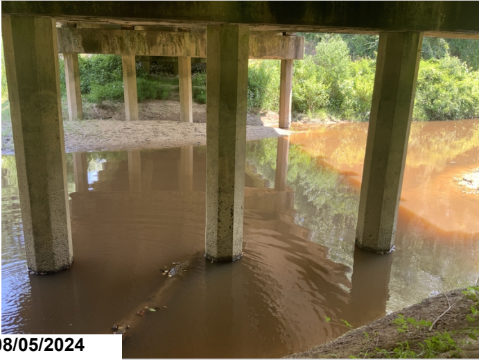
Bents 3&4 pile have abrasion.