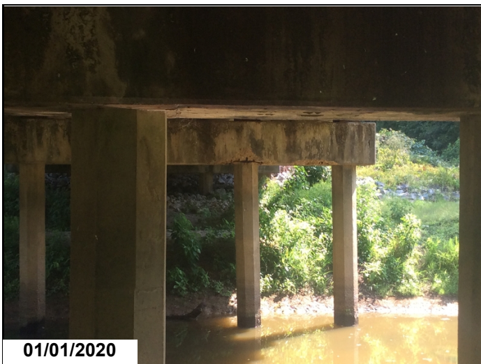
Bent 4 cap spalled