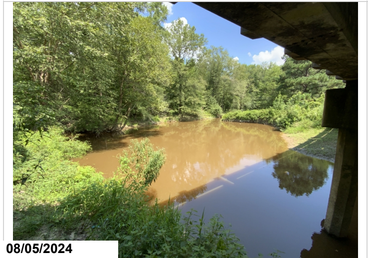
Channel upstream overview right side