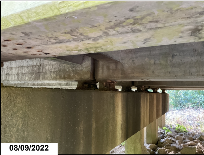
Bt. 2, masonry plates have layering rust, all bearings have corrosion.