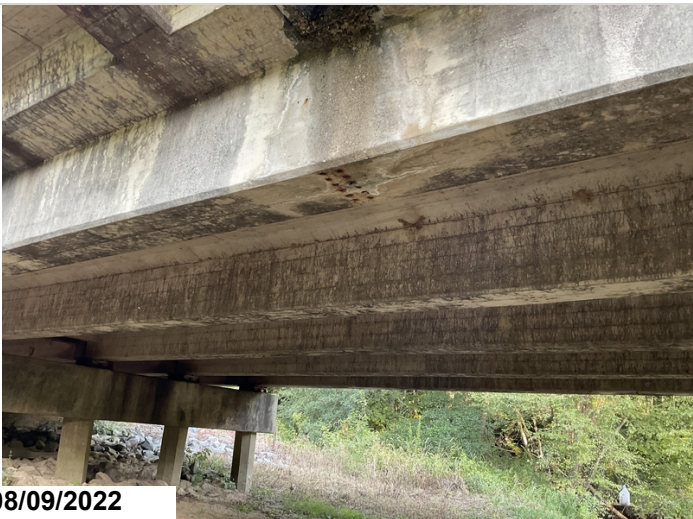
Typical view of the girders