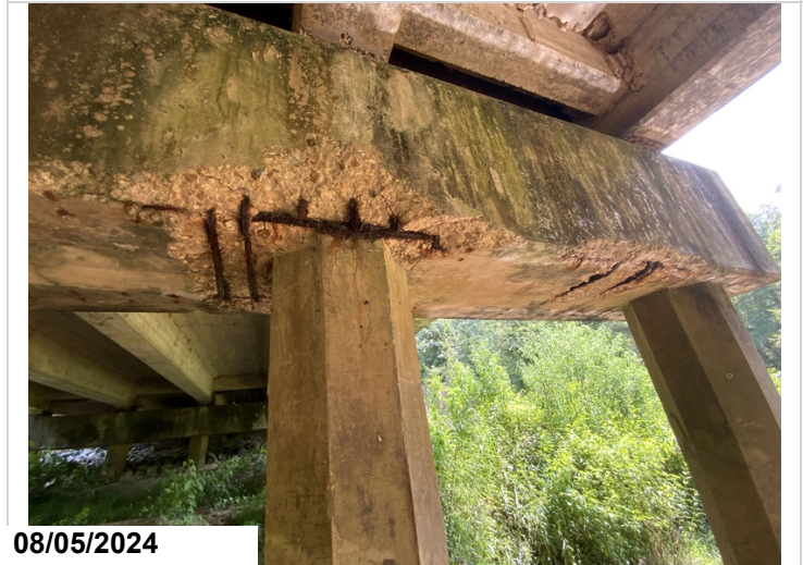
Bent 4 cap bottom exposed rebar