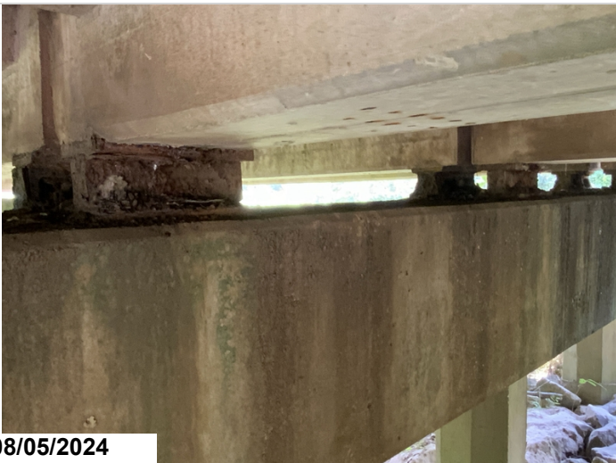
Bearings and plates all bents active corrosion