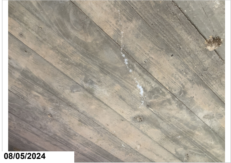
Span 1 bay 4 bottom surface has efflorescence. Common all spans.