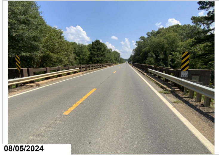
Approach roadway Northbound