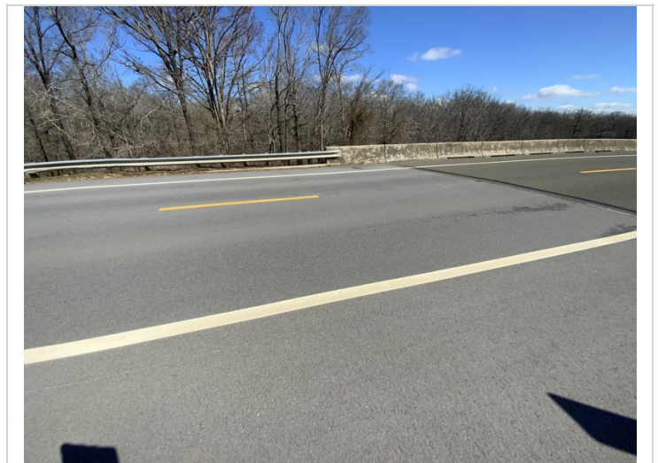
West end approach slab has been overlayed common East end.