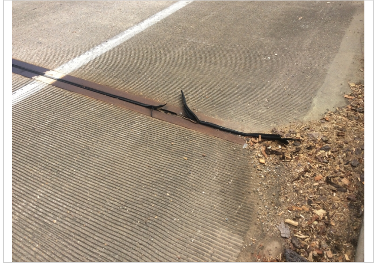
Bent 2 joint, torn.