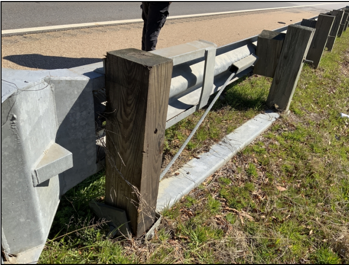
Abutment 1 end, Rt side Terminal Anchor post missing bolt.