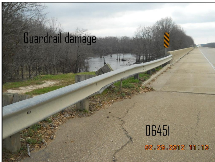
Abutment 1 Lt. Guardrail has old collision damage to the rail and post.

Abutment 1 end, Rt side Terminal Anchor post. Broke.