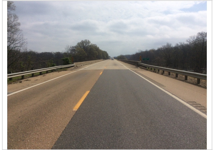
Approach roadway looking east.