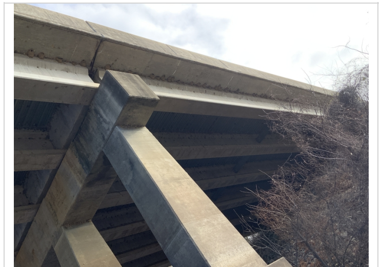
Span 5 right side soffit overhang has cracks with efflorescence.