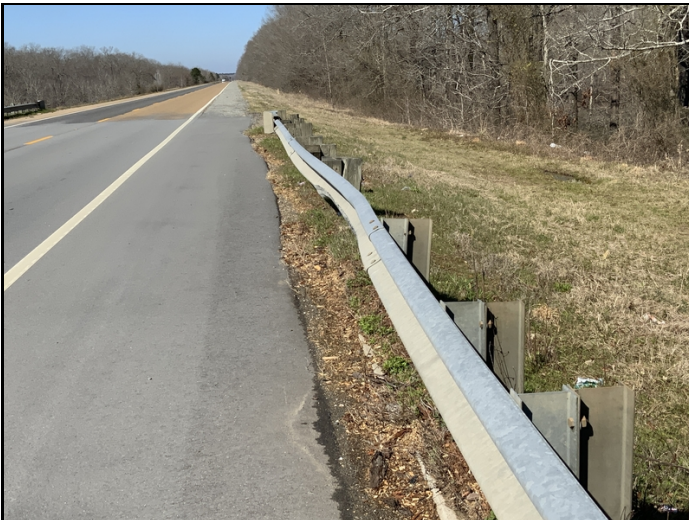
Abutment 1 end, Lt side Approach guardrail has Collision damage.

Abutment 1 end, Lt side Approach guardrail. Collision damage.