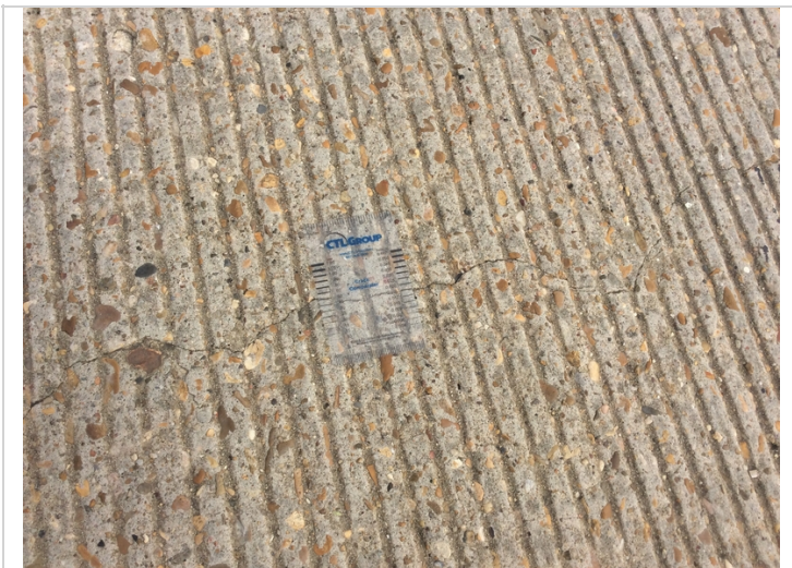
Span 2 small cracks.