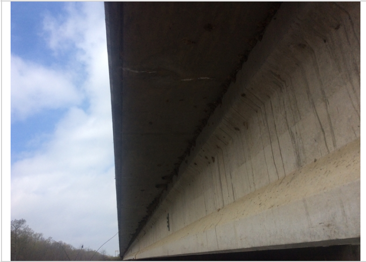
Cracks with light efflorescences in deck overhang.