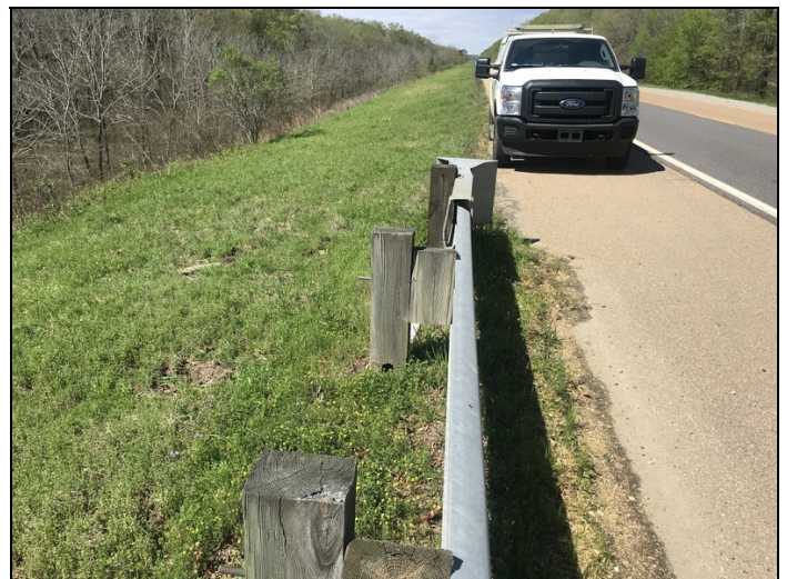
Repair right side rail