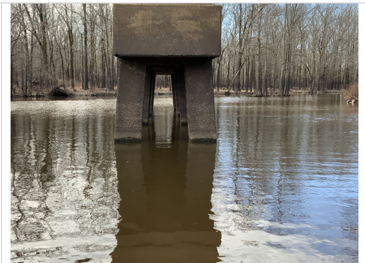
Bent 3 piles have abrasion, common bents 4&5.