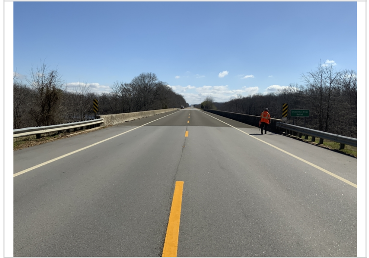
Approach roadway Eastbound.