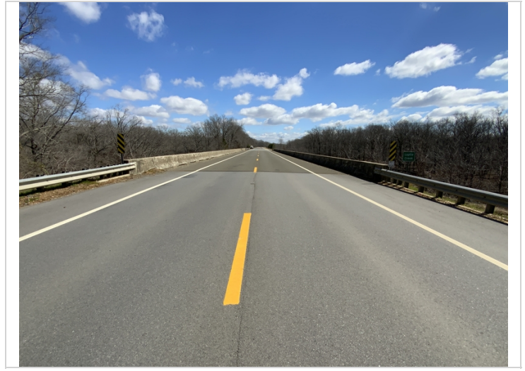
Approach roadway Eastbound.