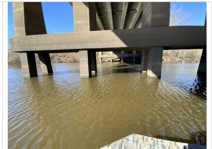
Bent 3 pile have abrasion, common bents 2&4.