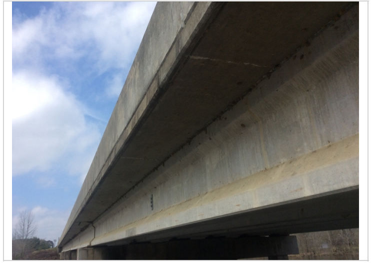
Cracks with efflorescences, on overhangs.