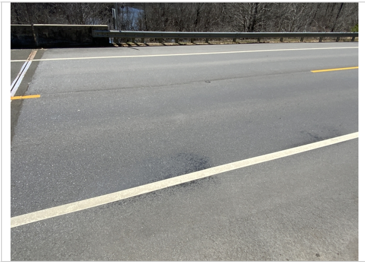
West end approach slab has been overlayed, common East end.