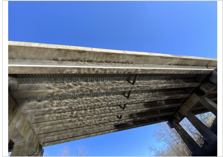
Span 3 right side soffit overhang has cracks with efflorescence, common all spans both sides.