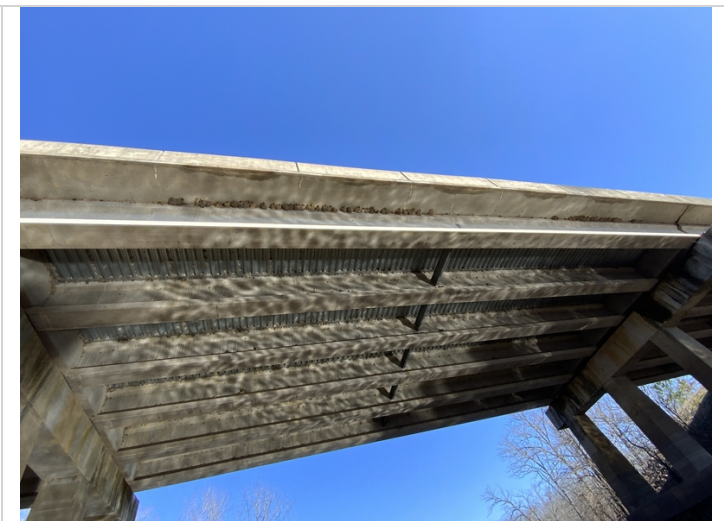
Span 3 right side soffit overhang has cracks with efflorescence, common all spans both sides.