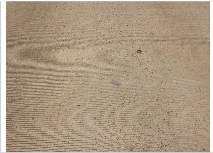
Span 2 cracks in deck.