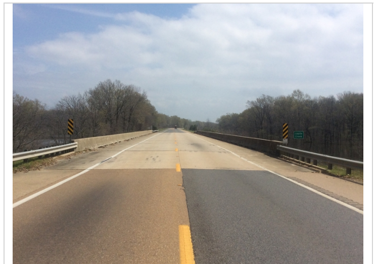
Approach roadway looking east.