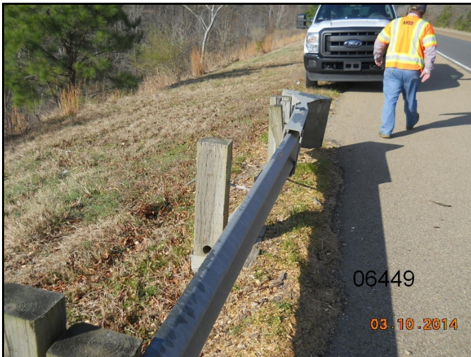
Abutment 1 Rt. side terminal end post and spacer block broke.