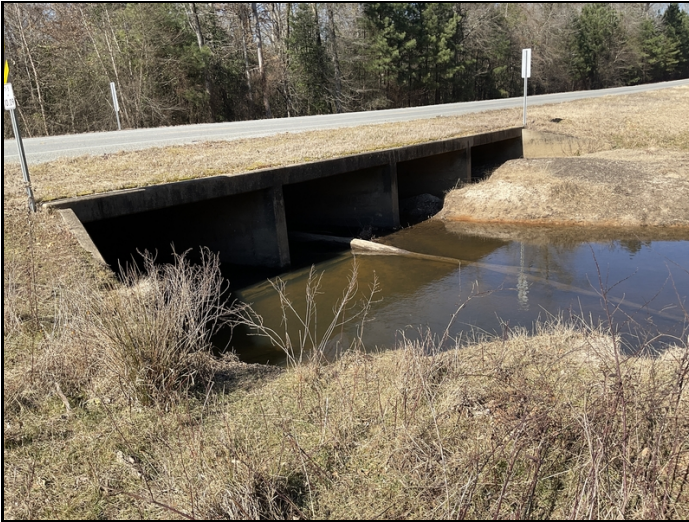
Drift barrel 2