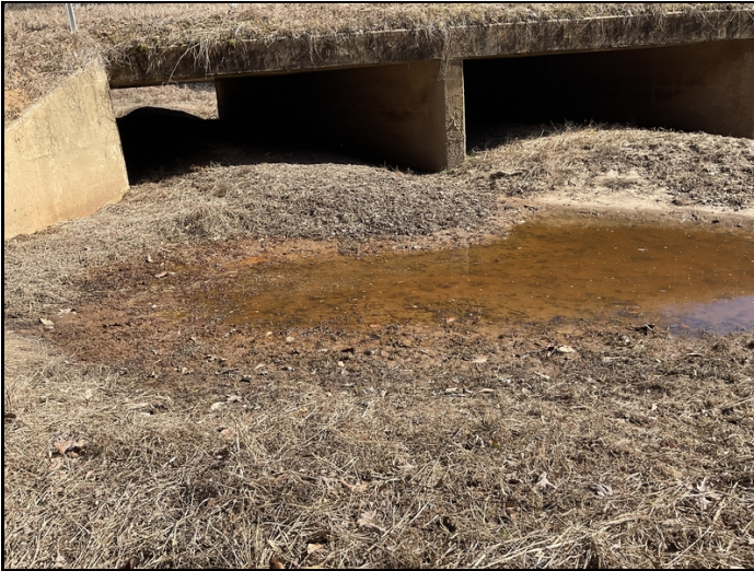
Silt barrels 3 and 4 outlet end.

Barrels 3 and 4 silted in up to 3/4 entire length of barrels.