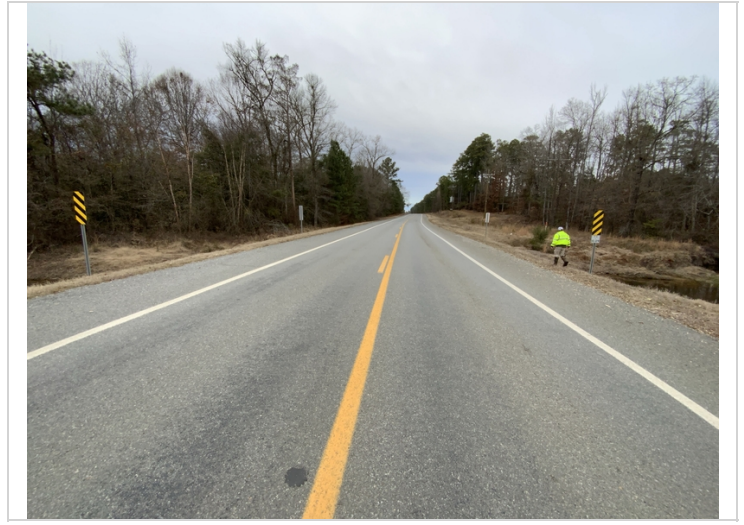
Approach roadway Northbound