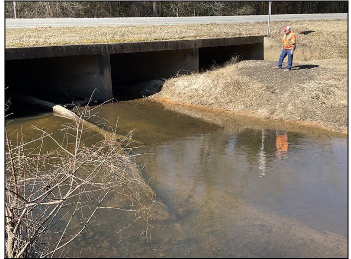
Barrels 3 and 4 silted in on inlet end.