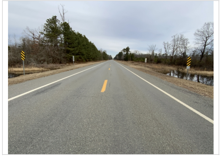
Approach roadway Northbound