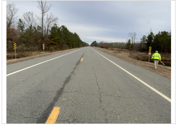
Approach roadway Northbound