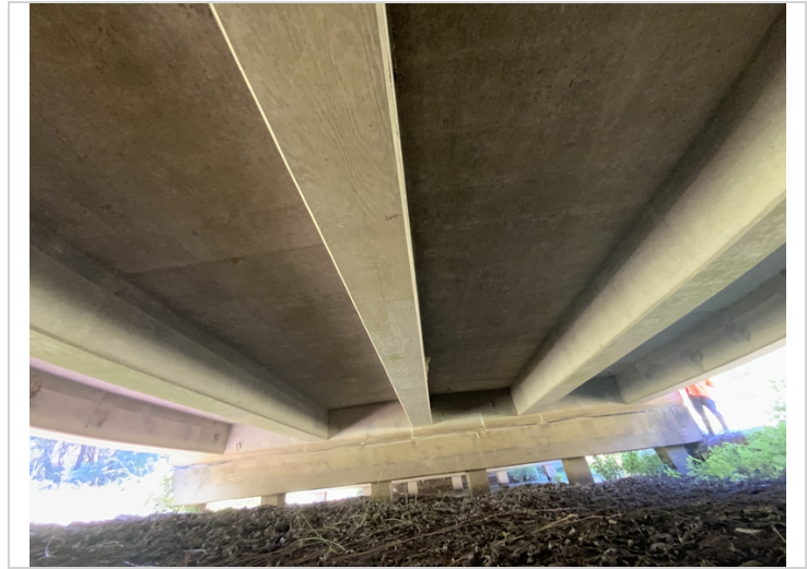
Span 2 soffit overview.