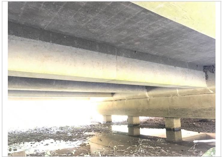
Span 1 deck soffit.