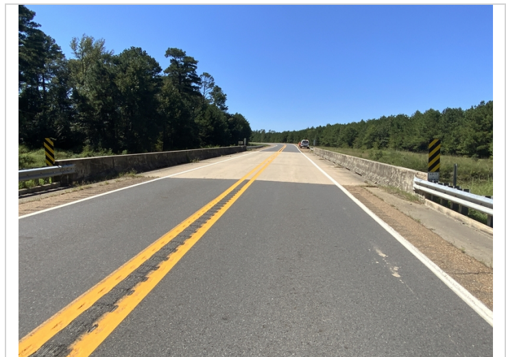
Approach roadway Westbound.