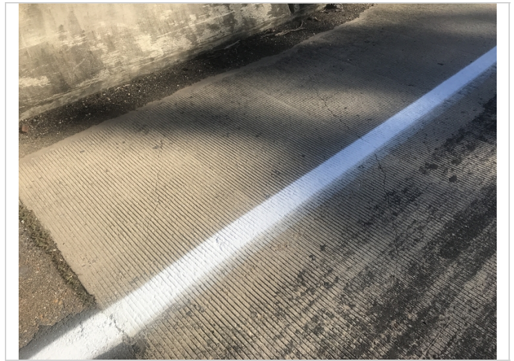
Span 4, diagonal cracks.