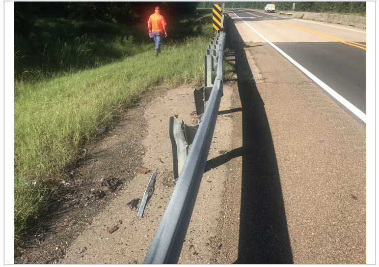
Left side approach, rail and post bent.