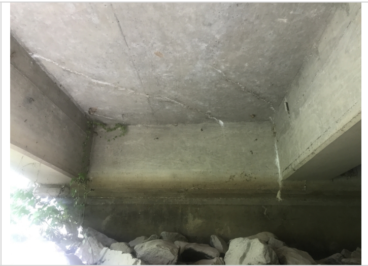
Span 4, cracks with efflorescence.