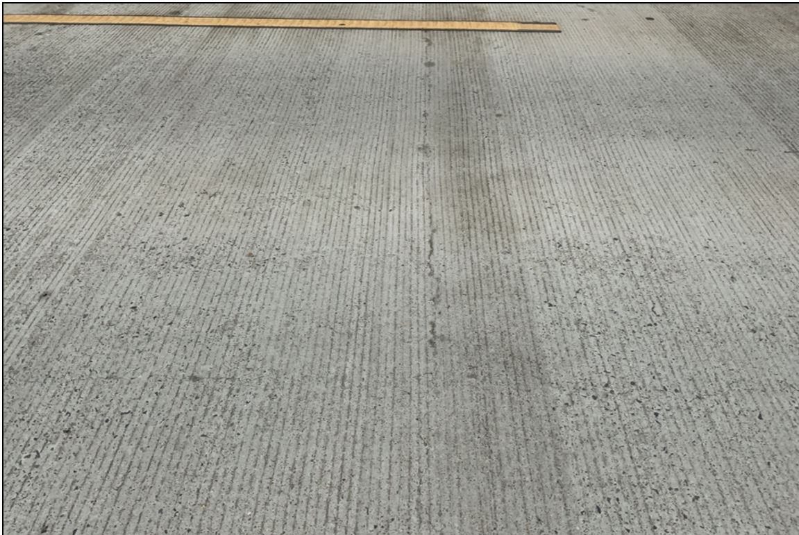
Small transverse cracks