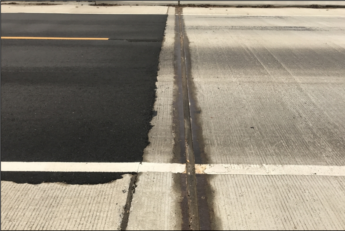
Joint material at abutment 1