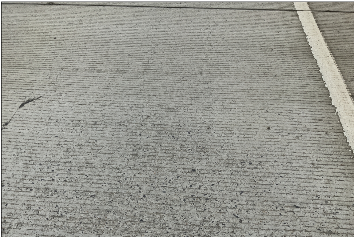
Small longitudinal cracks 0.020