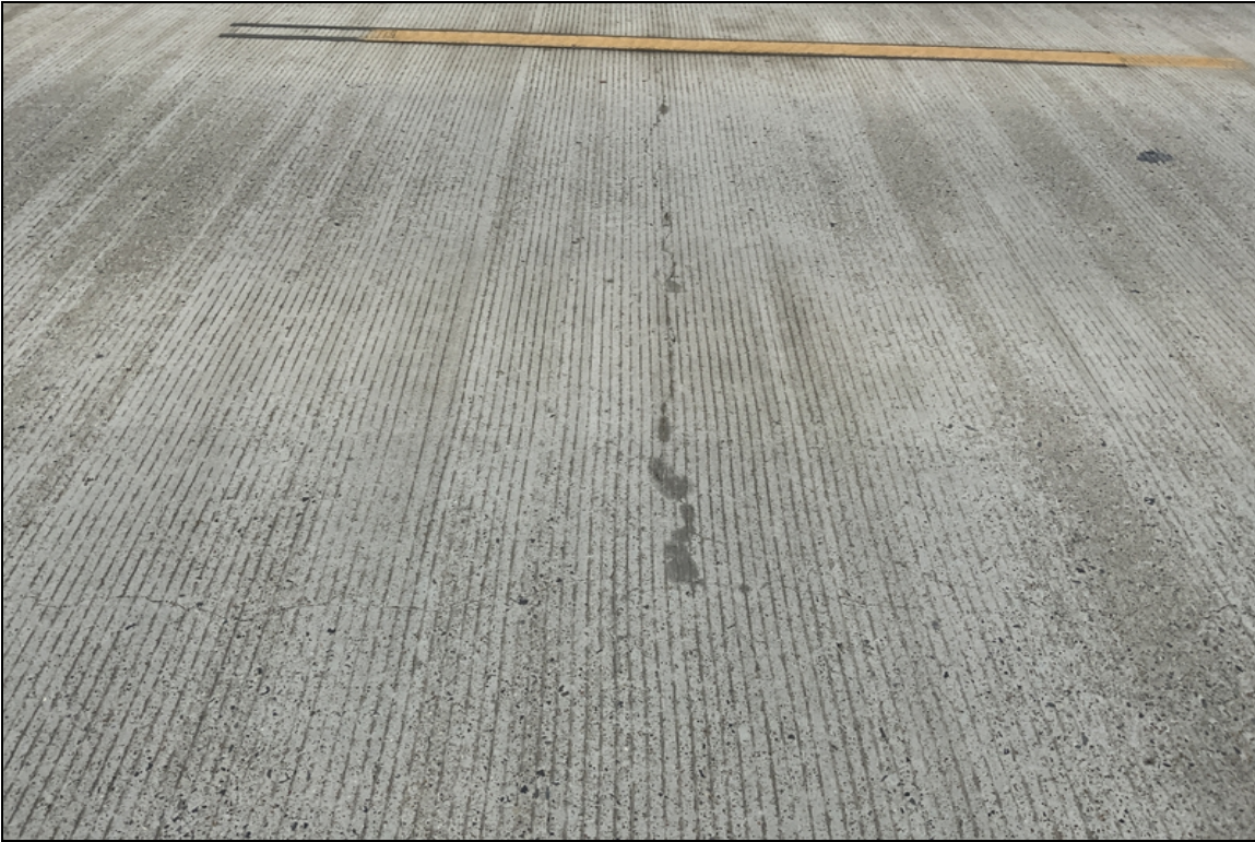
Transverse deck cracks 0.040