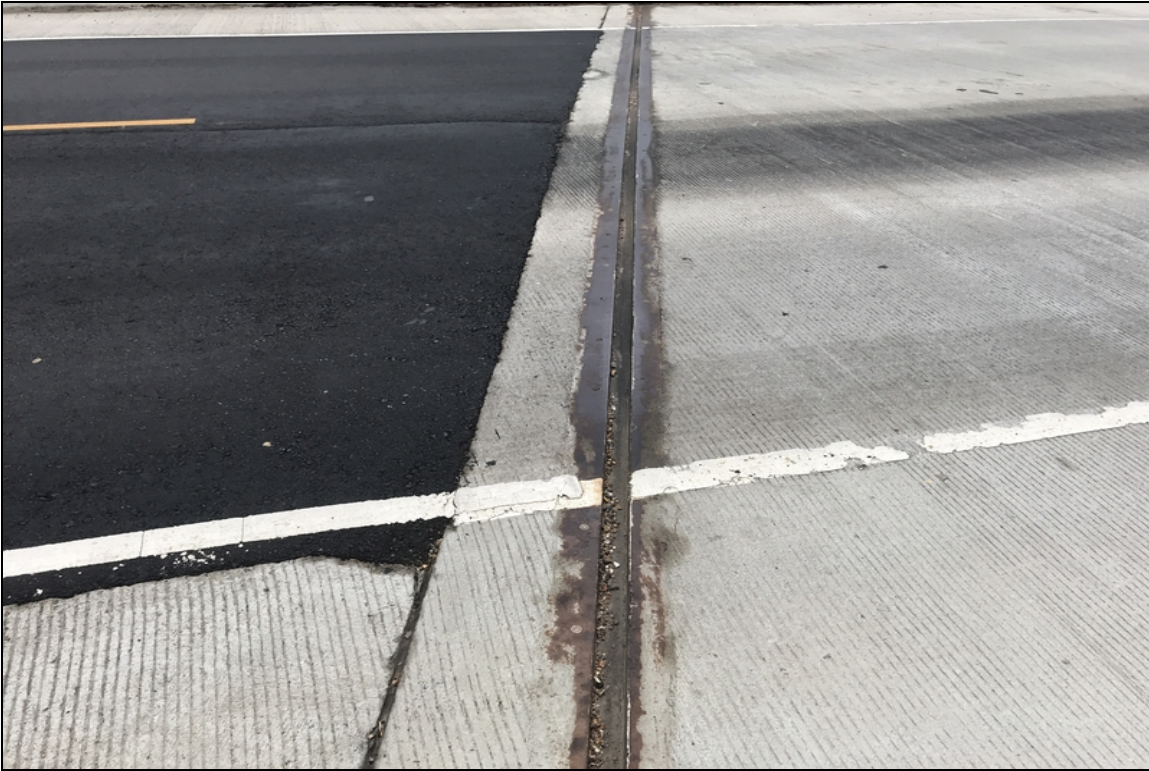
Joint material at abutment 1