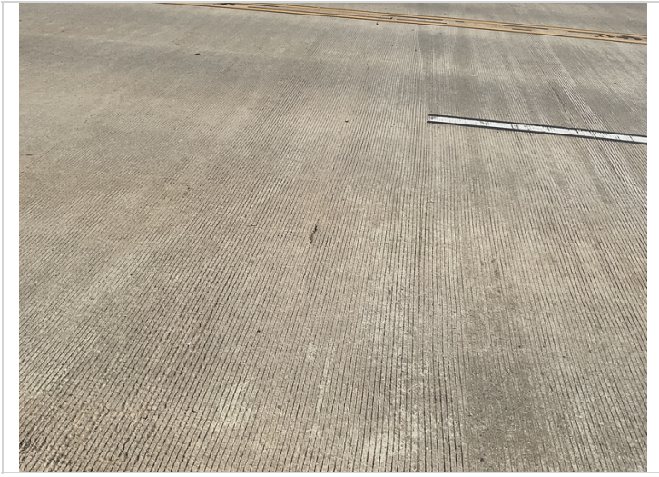
Transverse cracks in deck