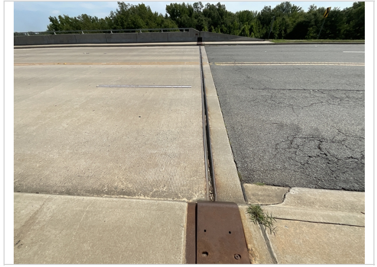
Joint at bent 4 typical for all joints