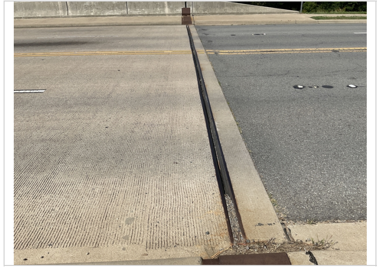
Joint at bent 1 has debris impaction