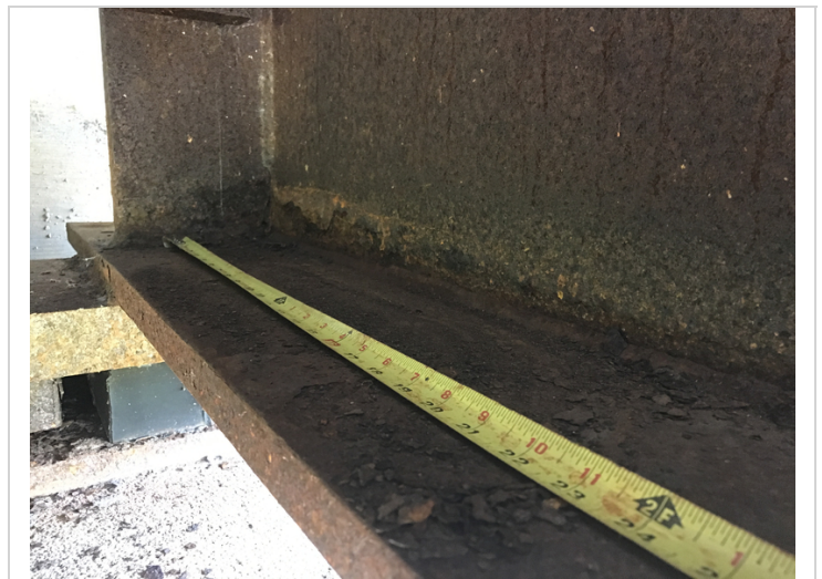
Bent 4 beam 8 laminating rust on inside of beam end