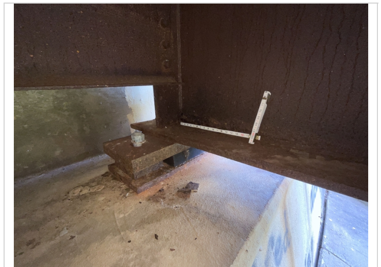
Corrosion/laminated rust at bent 4 beam 8