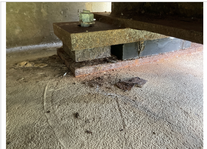
Masonry plate at bent 4 beam 8