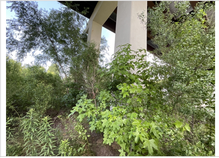
Trees and vines growing at bent 2 and 3