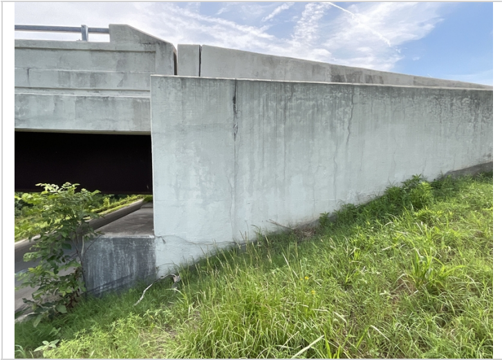
Cracking at bent 4 abutment