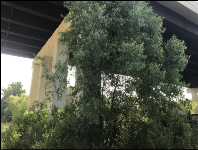
Trees and vines growing against columns at Bent 2

Trees growing against columns at bents 2&3.