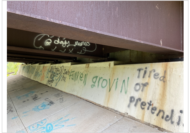
Bent 4 typical condition