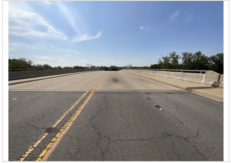
Approach looking east