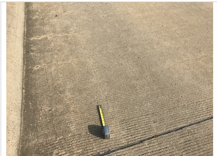
Span 3 longitudinal crack up to 0.015"