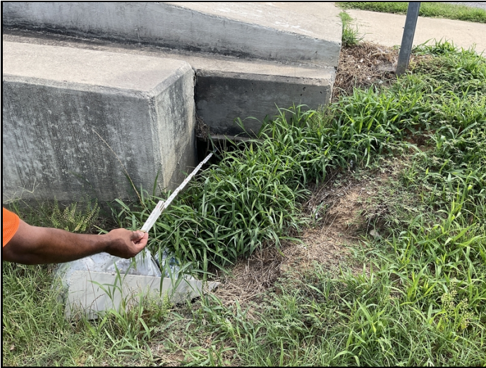
Erosion at bent 4 ride side

Erosion at bent 4 sidewalk on southeast end