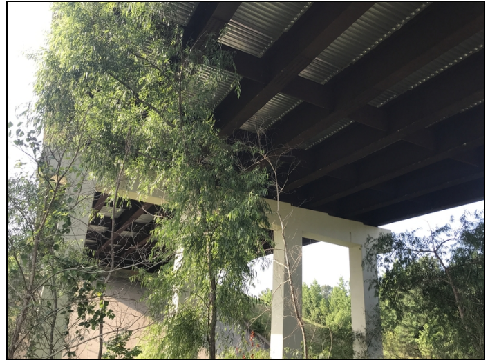
Bent 3 trees growing under bridge