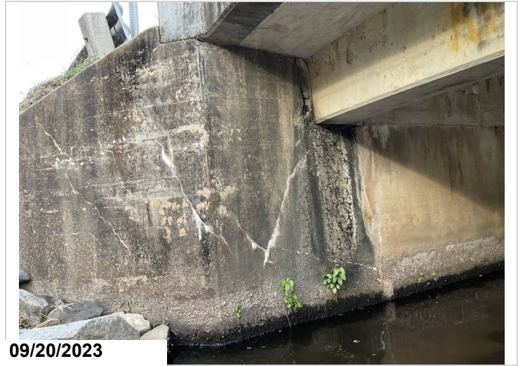
Bent 1: diagonal cracking with efflorescence staining to the wing wall and abutment.