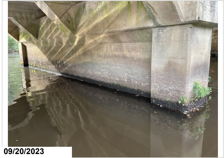
Span 2: right side of girder 2 small spalls with exposed rebar. Similar condition at girder 4.