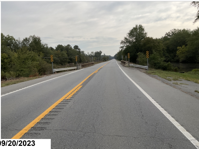
Inventory looking north.