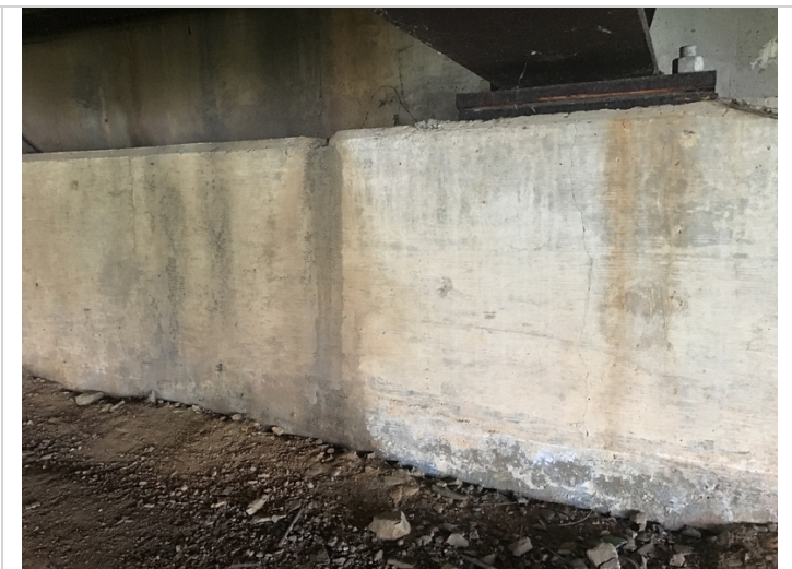
Bent 1 abutment has small scattered vertical cracks.