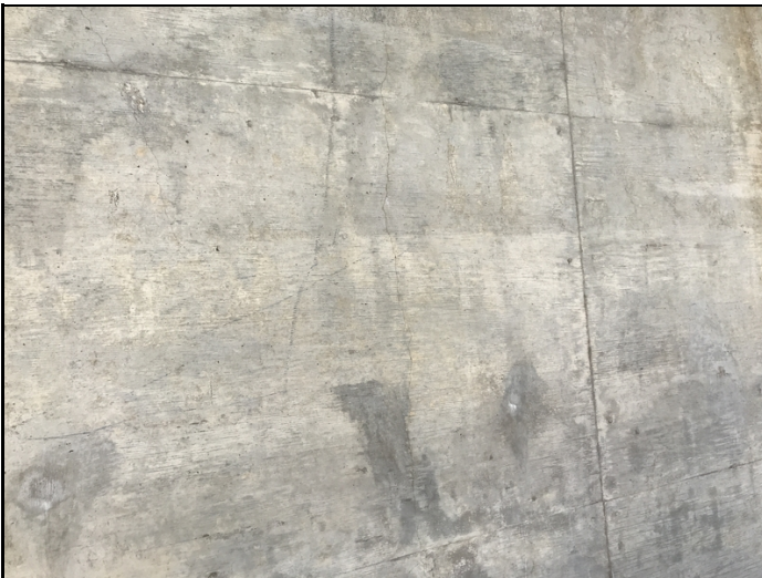
Cracks in cap at bent 7

Pier 6, Ahead: Minor spall on the left end of the cap.