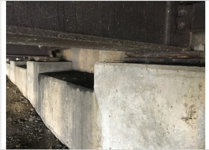
Bearings at abutment 2 have corrosion with laminating rust, common abutment 1.