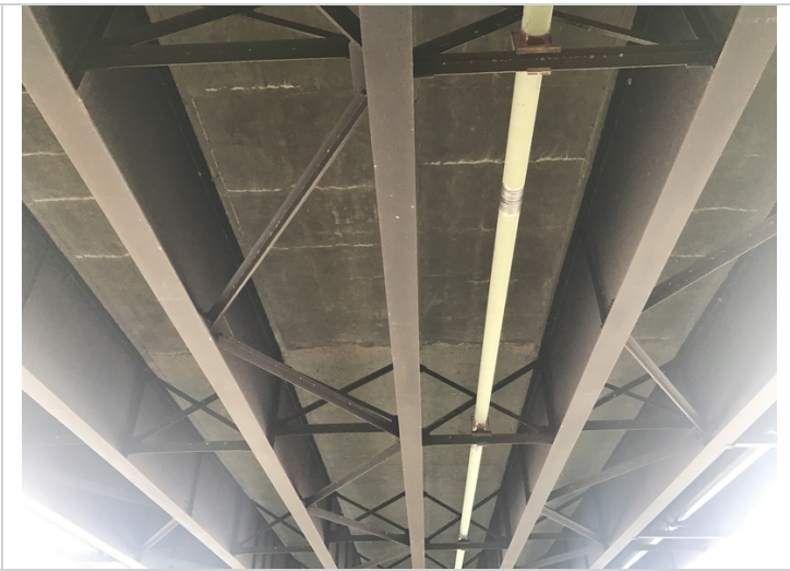
Span 2 soffit overview.