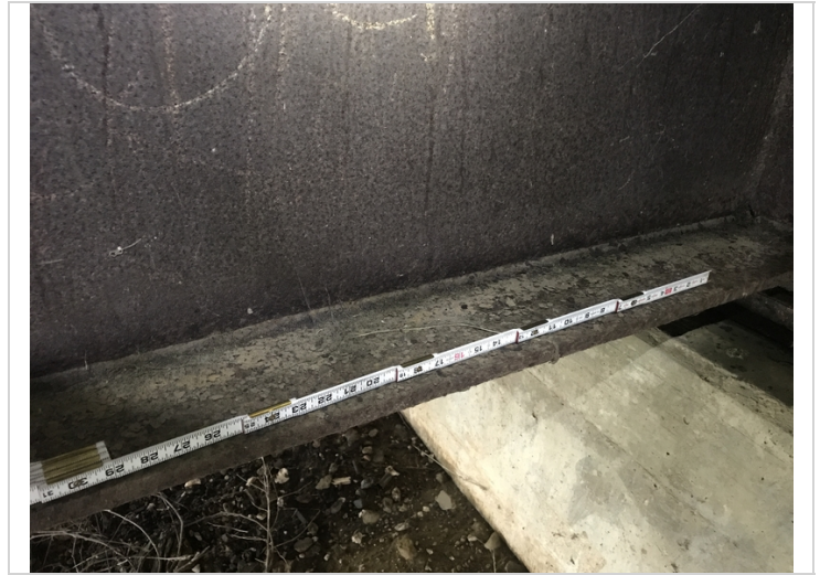
Span 9 beam 2 at bent 10 bottom flange and lower web have 3/8" diameter flakes, common girders 1,3,&4.