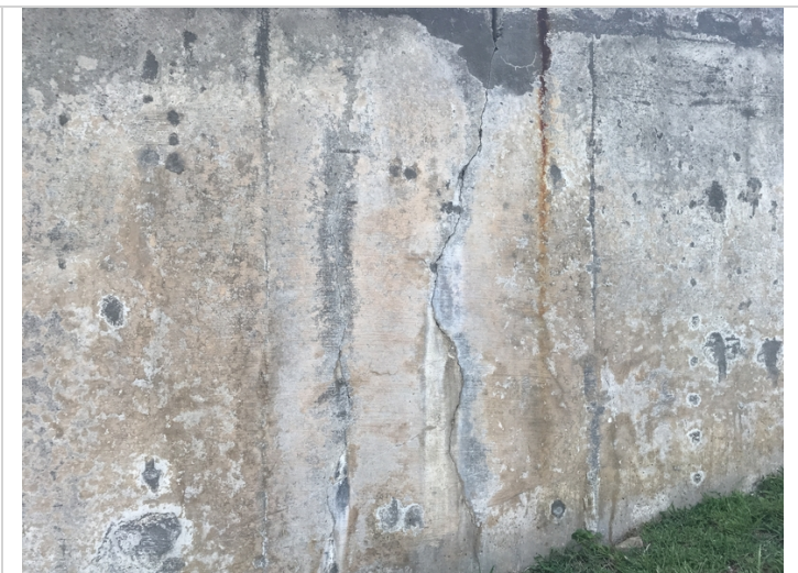
Vertical open cracks with efflorescence right wing wall at abutment 2.