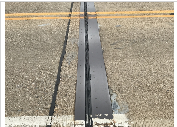
Joint seal at bent 10 are torn and split.