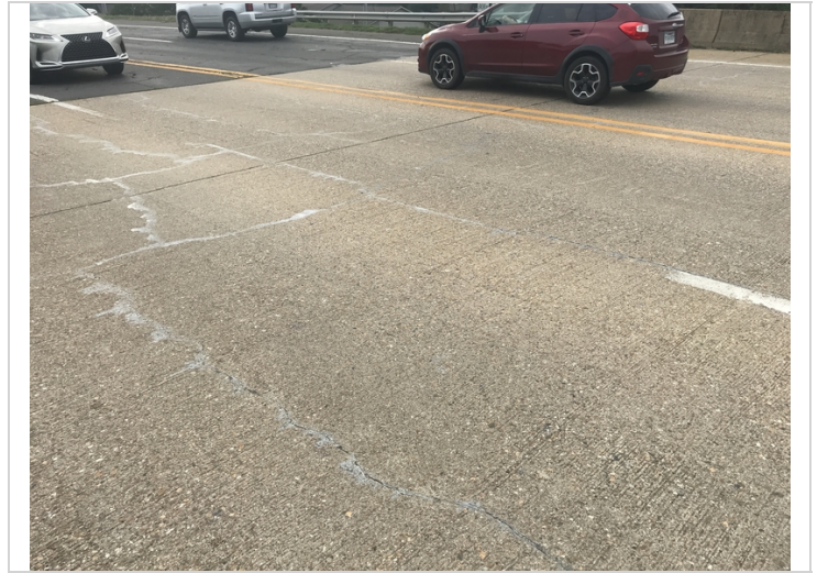
East approach slab sealed cracks.