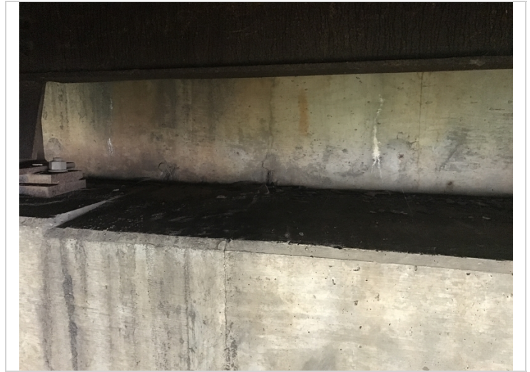
Bent 1 has scattered cracks with efflorescence in back wall.