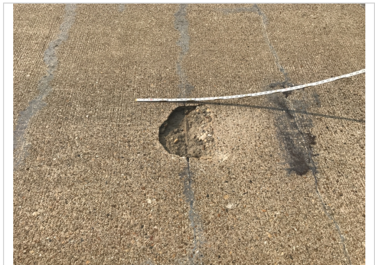
Deck span 5 spall with exposed rebar.