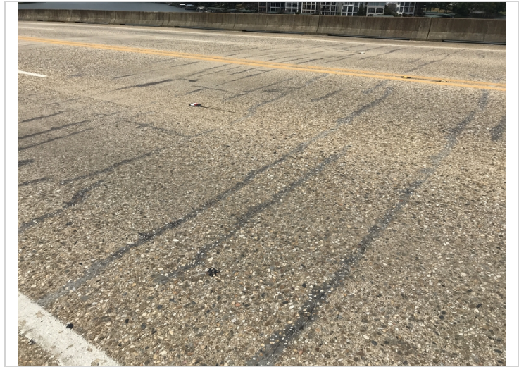
Deck has been diamond ground for smoothness