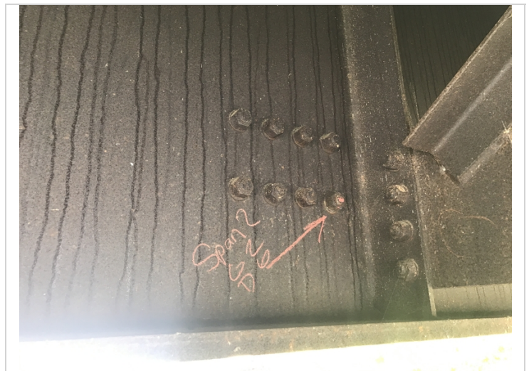
Span 2 girder 2 diaphragm 6 loose bolt.