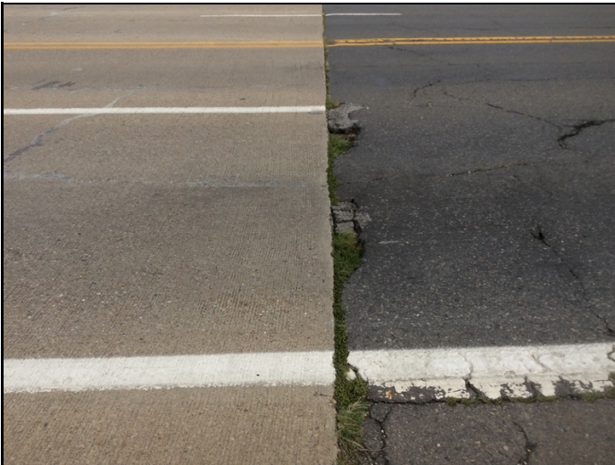
Potholes in asphalt at ends of approach slabs.

Approach slabs at both ends of the bridge have potholes in the asphalt at the beginning of the approach slabs.