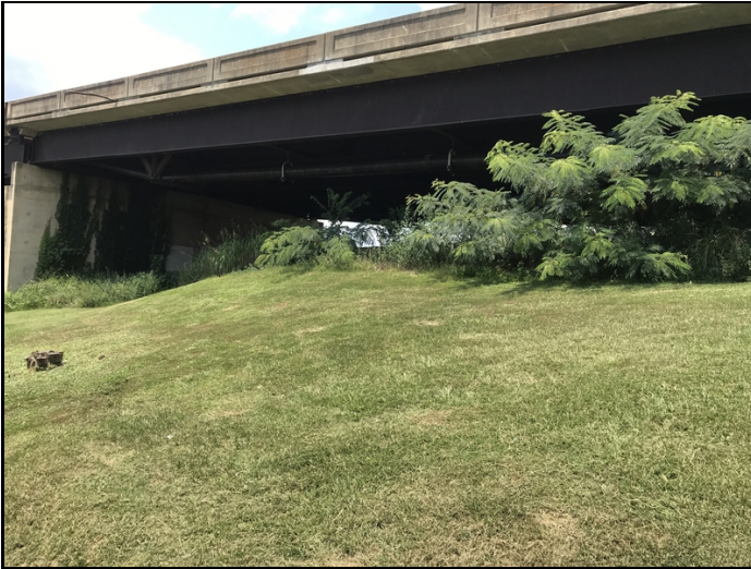
vines and trees growing at both abutments