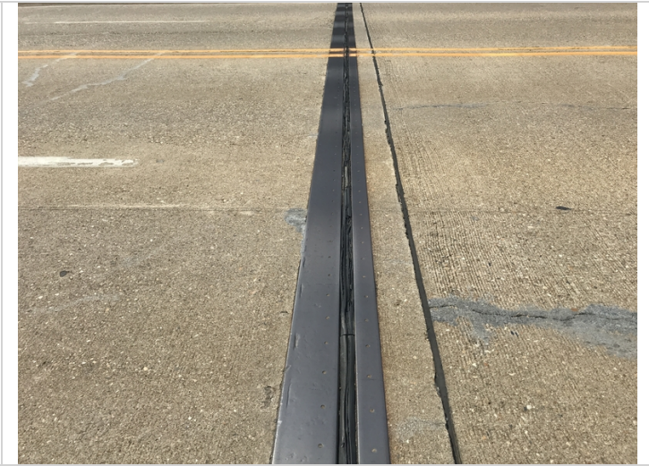
Joint seal at bent 1 are torn and split.