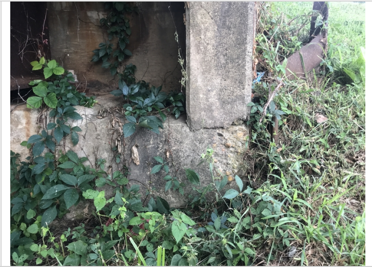
Left side bent 1 abutment has spall.