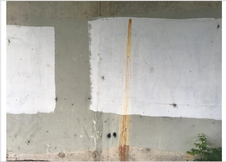
Bent 9 pier wall ahead has cracks with efflorescence and rust staining.