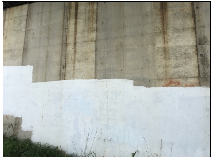
Large vertical cracks in pier walls