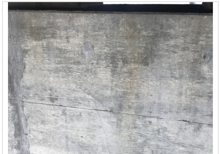
Bent 8 cap ahead vertical crack.