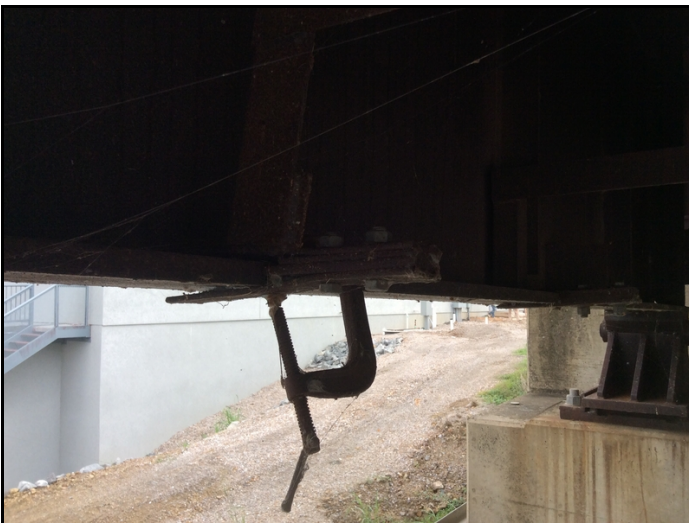
Utility company has installed c-clamps on waterline bracket.