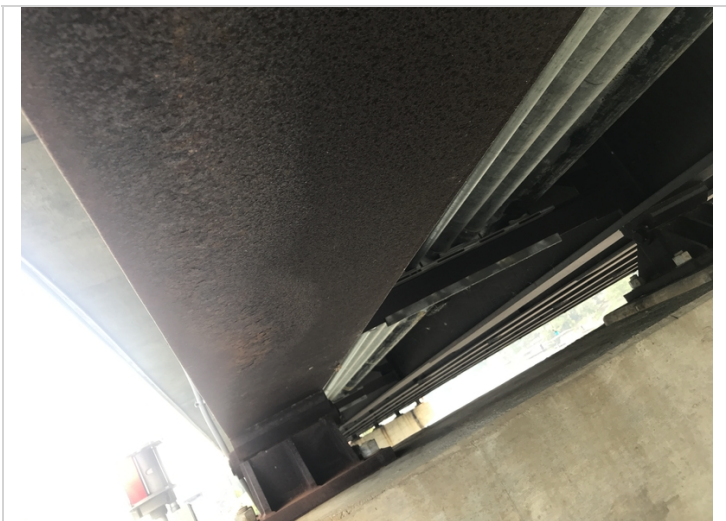
Span 5 girder 1 back of bent 6 bottom flange small flaking rust.