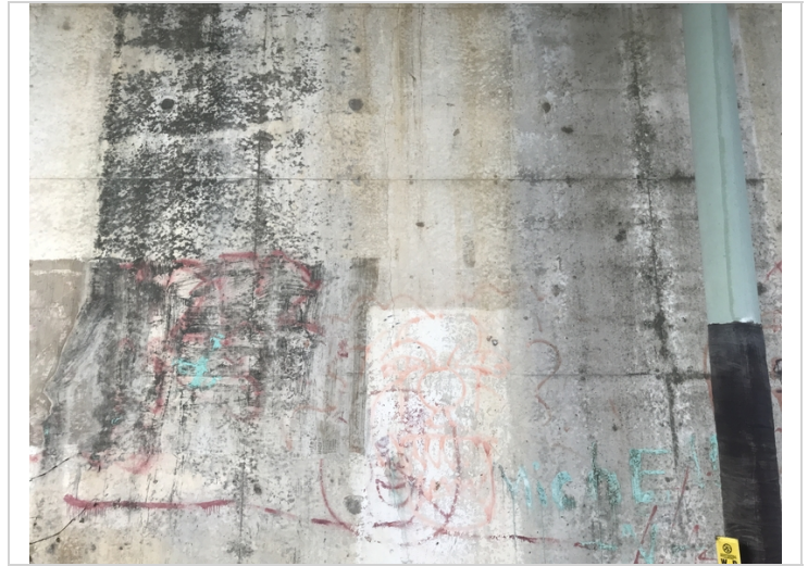
Bent 2 pier wall ahead has vertical cracks.