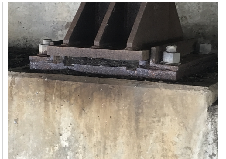
Bent 2 span 2 bearing 4 has pack rust forming between the bolted connections. Common bearing 2,3,5,6 & 7.