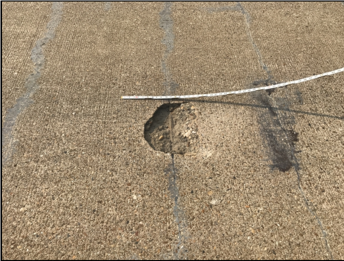
Deck span 5 spall with exposed rebar.

Spans 4 & 5 have spalls with exposed rebar.