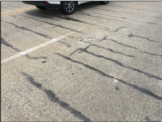
Spall in right lane and 1 in left lane mid span

Large pothole at the east end of the bridge at the approach slab. Two potholes in east and westbound lanes in span 4