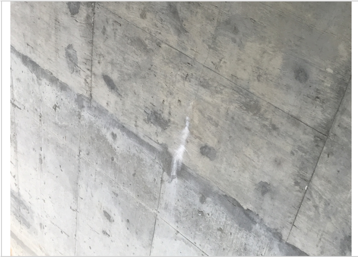
Bent 7 ahead pier cap has vertical crack with efflorescence.