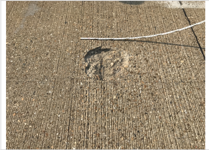
Deck spall with exposed rebar span 4.