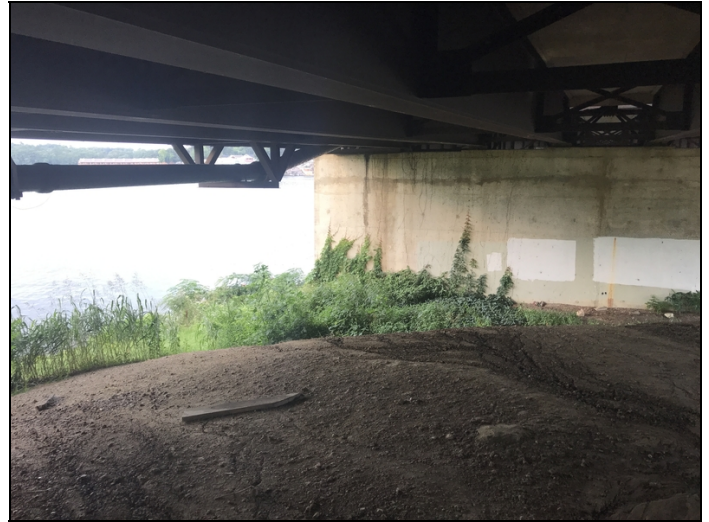
Bent 9 pier wall has vines growing on pier wall.