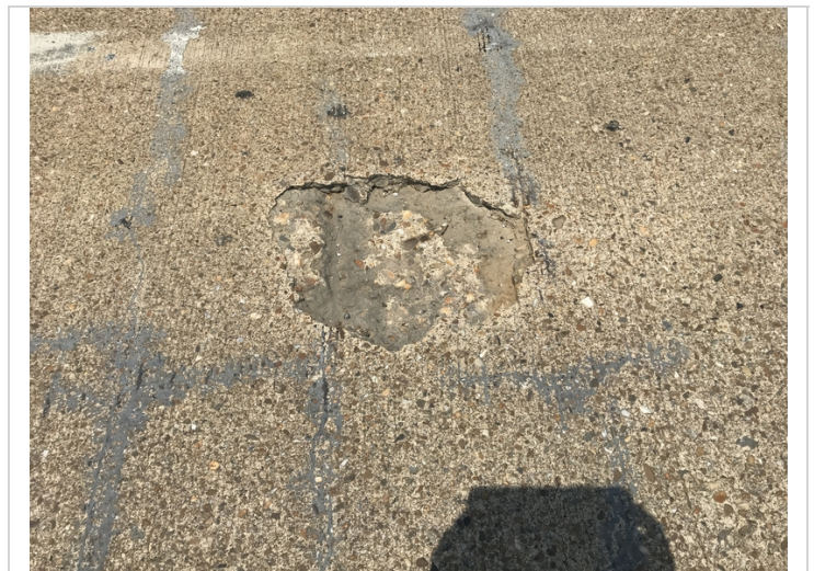
Span 5 spall with exposed rebar.