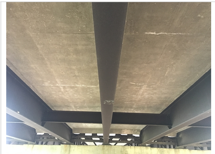
Span 1 soffit has cracks with efflorescence, common all spans.