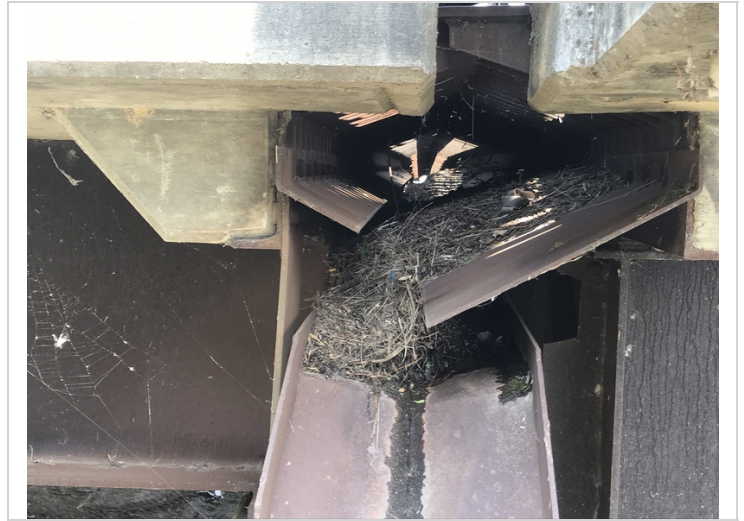
Bent 2 finger joint has debris impaction.