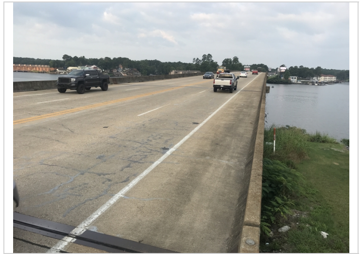
Deck overview West end of bridge.