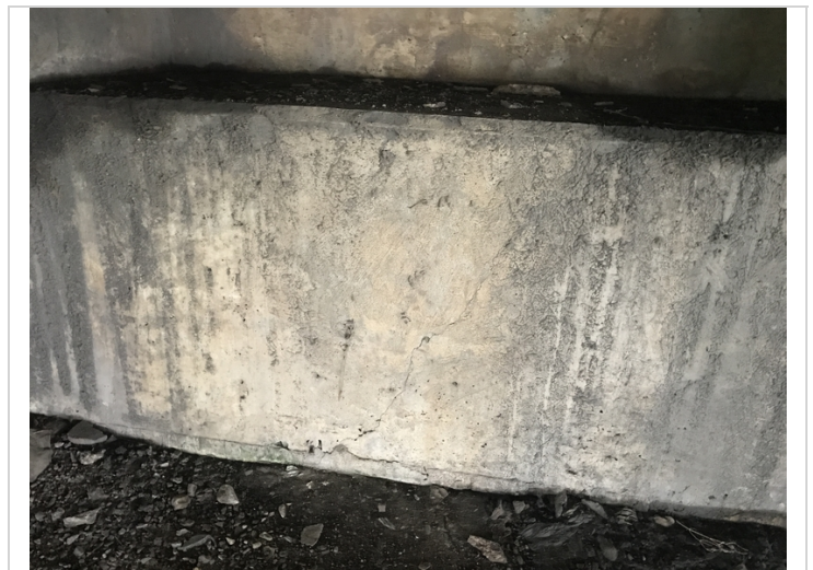
Vertical cracks in beam seat at abutment 2.