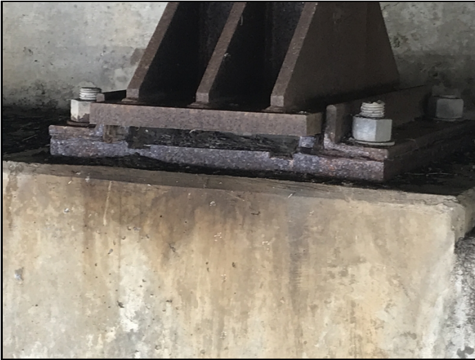
Bent 2 span 2 bearing 4 has pack rust forming between the bolted connections. Common bearing 2,3,5,6 & 7.