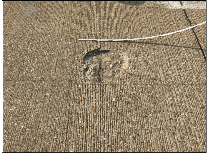
Deck spall with exposed rebar. Liver bent 4.