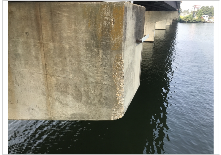
Bent 7 ahead left side pier cap has spall.