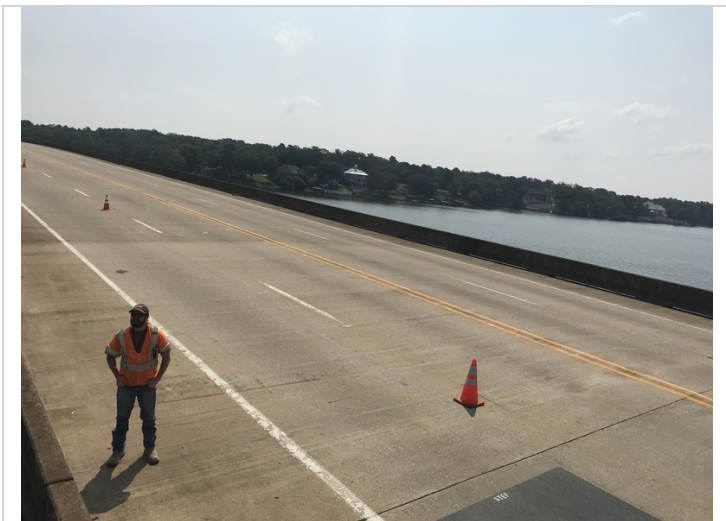
Deck overview west end of bridge.