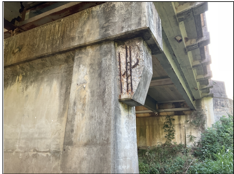
Bent 3: pier has spall with exposed rebar.