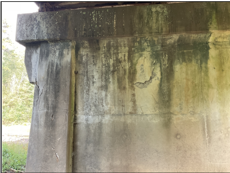
Ahead side of bent 3: area of delam in the pier wall

Bents 2&3 have spalls with exposed rebar on pier walls.