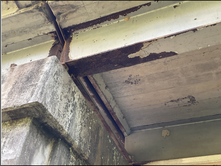
Span 3, girder 4: laminating rust and pitting to both upper and lower flange and web at the beam end.