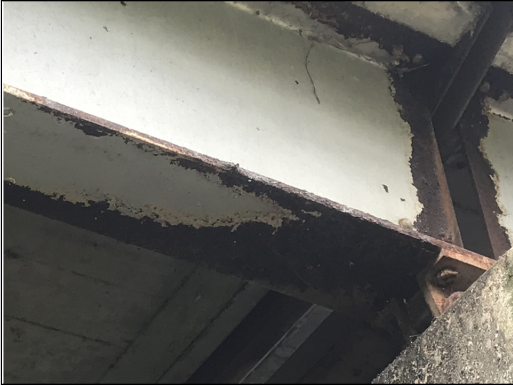
Span 3 beam 1 bent 3 active rust with moderate pitting to beam end.