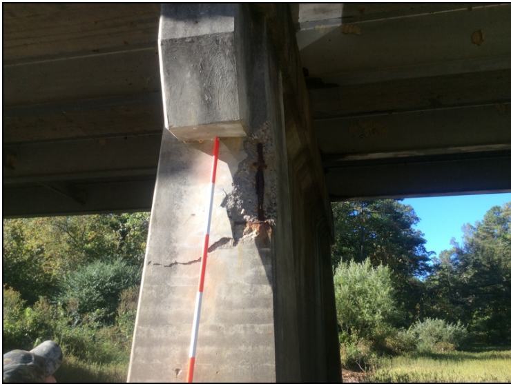
Left side of bent 2 large spall with exposed rebar. Common right side.