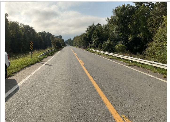
Inventory looking east