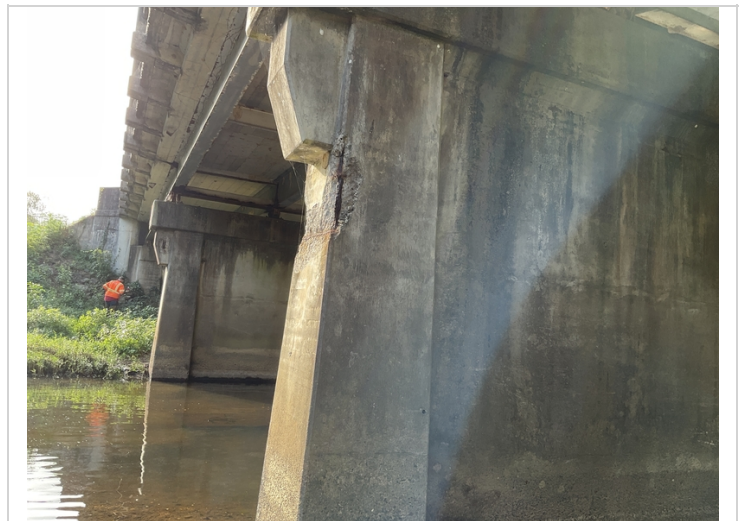
Bent 2, column 1