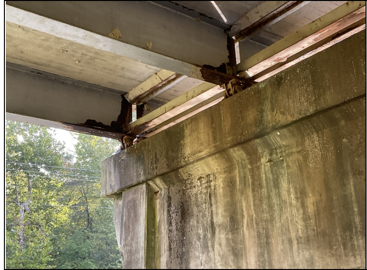
Span 1 at bent 2, girders 1&2: laminating rust and pitting to both upper and lower flange and web at the beam end.