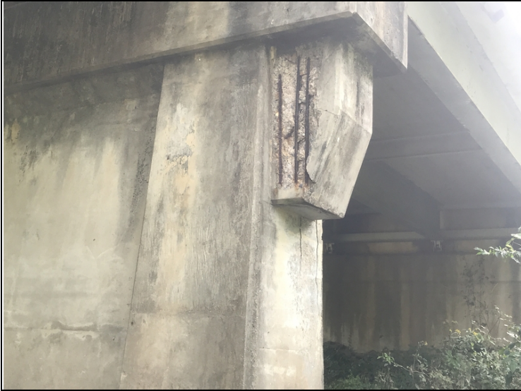
Bent 3 pier wall right side has spall with exposed rebar.