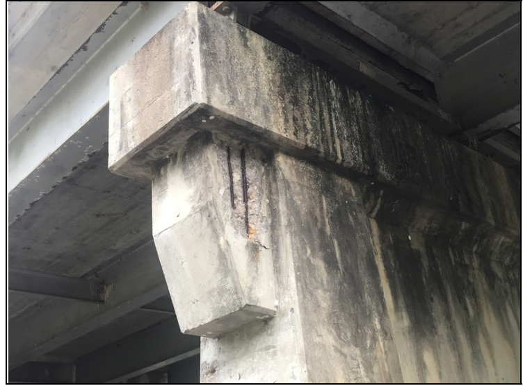
Bent 2 pier wall has spall with exposed rebar right side.