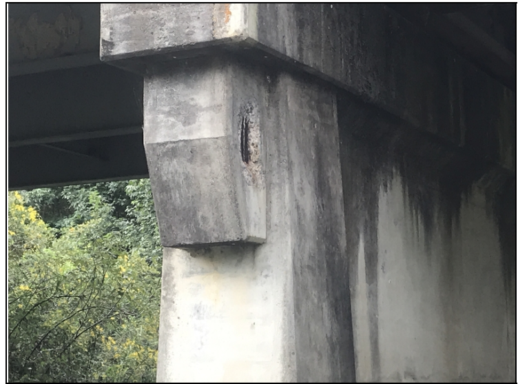
Bent 3 pier wall left end has spall with exposed rebar.