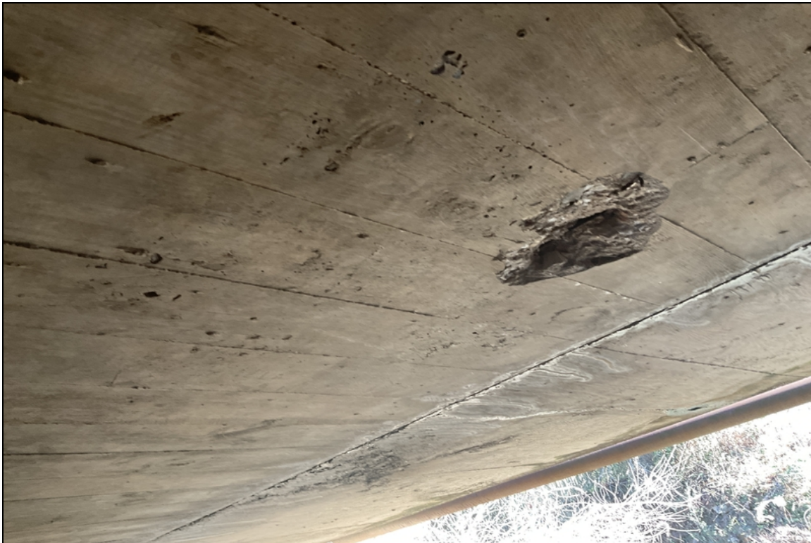
Spall with exposed rebar in soffit