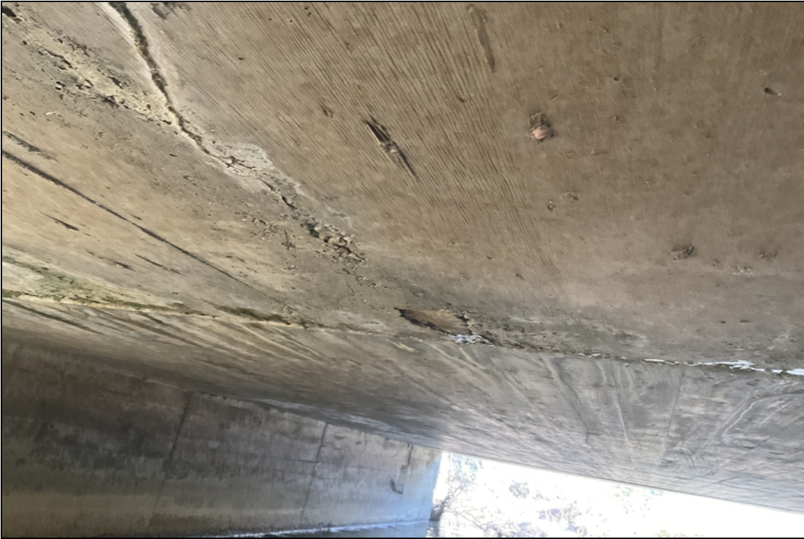
Deck under view