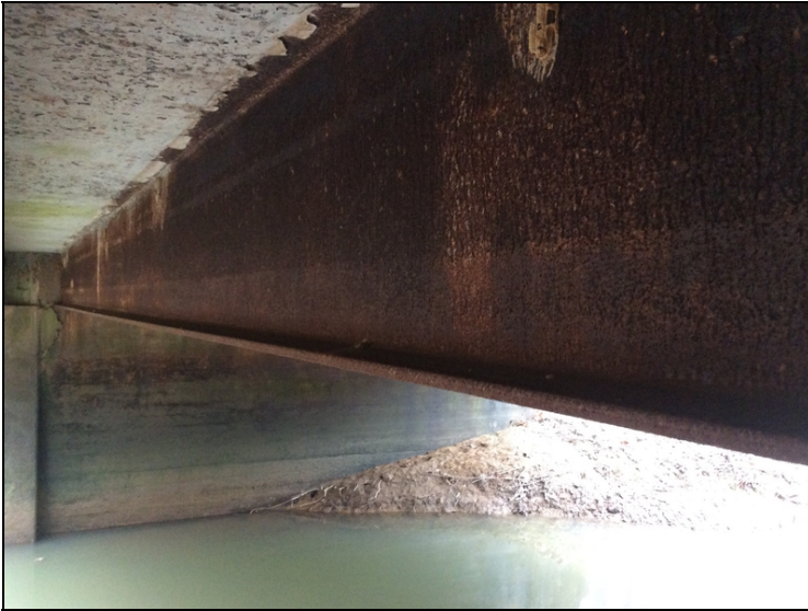
Beam 3 the paint system has failed. The beam has surface rust. Common all beams 2 thru 8.