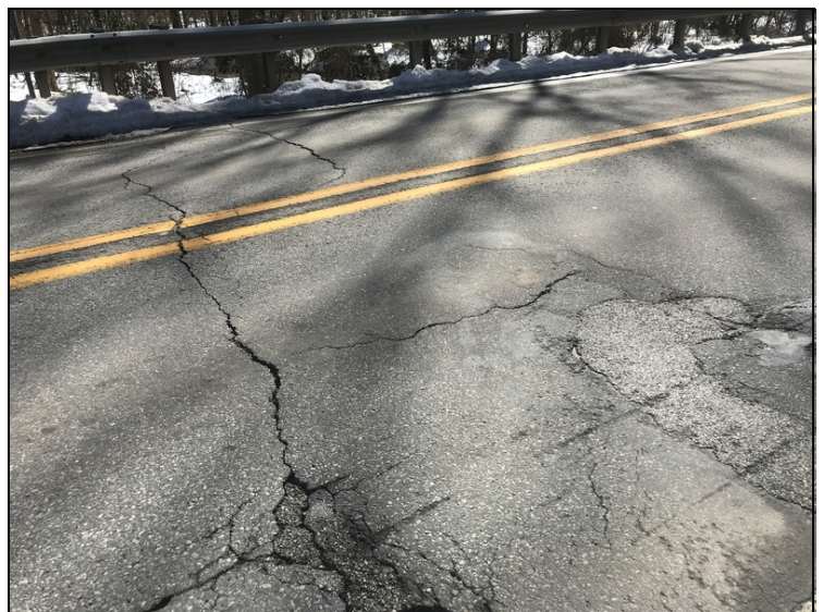
Approach roadway North end of bridge has settled. 2021