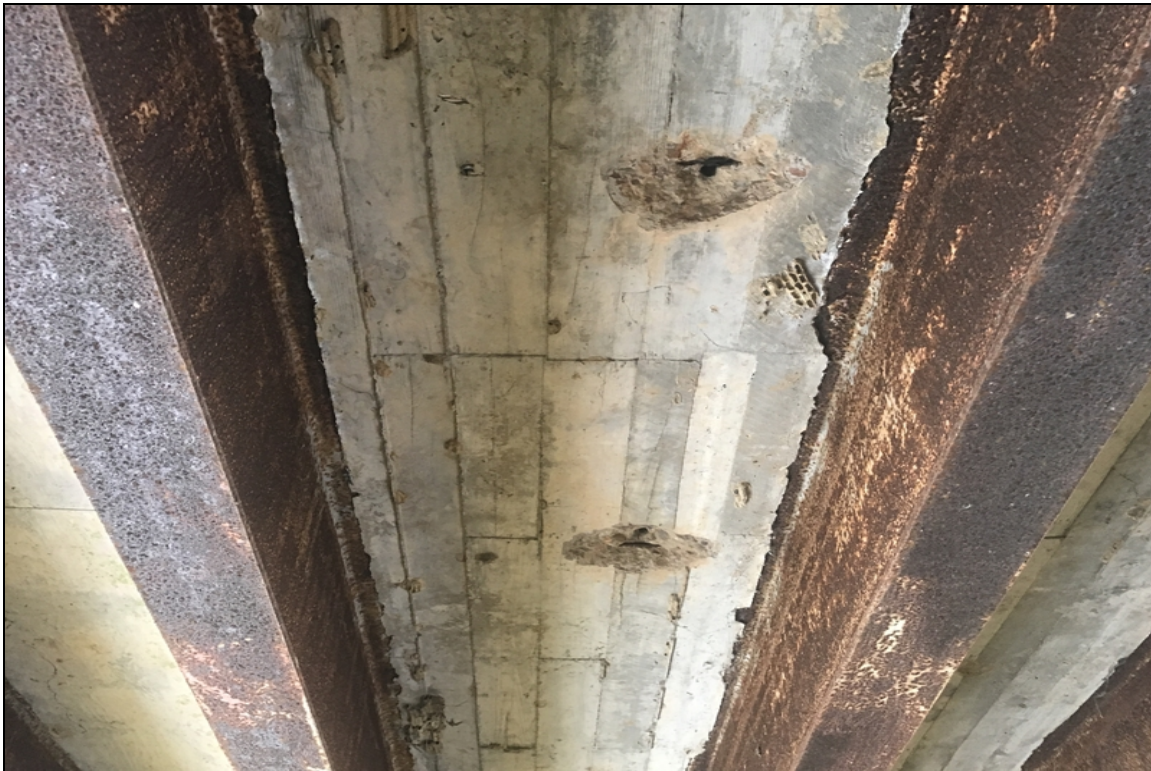
Soffit between beams 4 and 5 have spalls with exposed rebar.