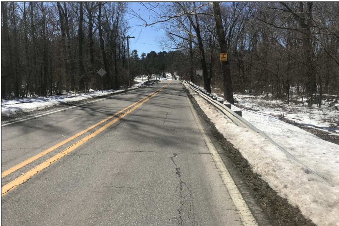
Approach looking south