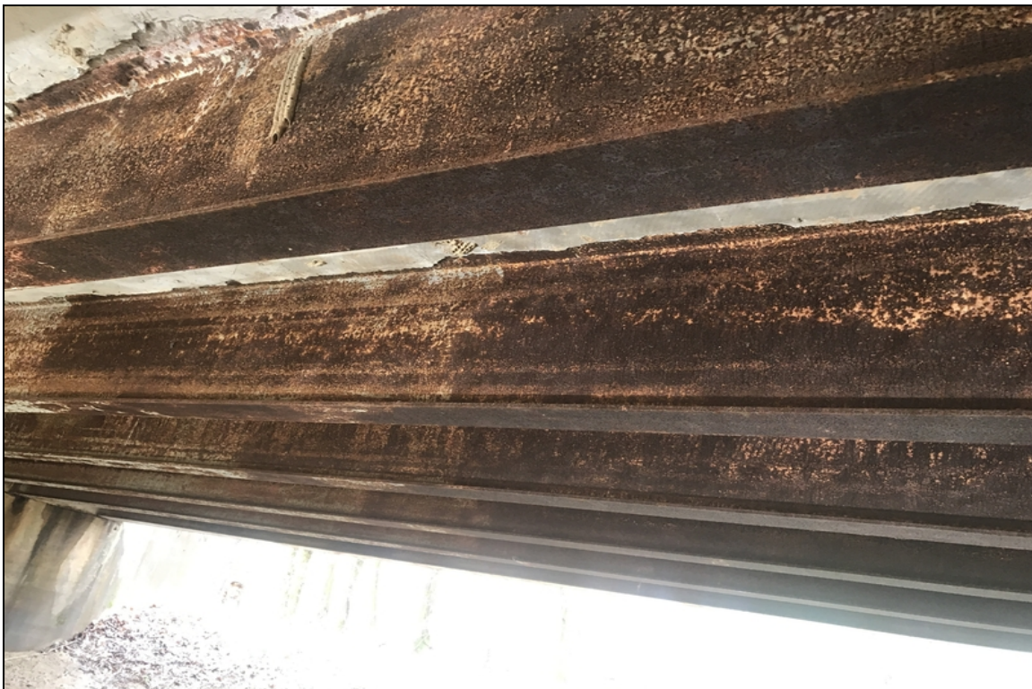
All beams have surface rust and light pitting.