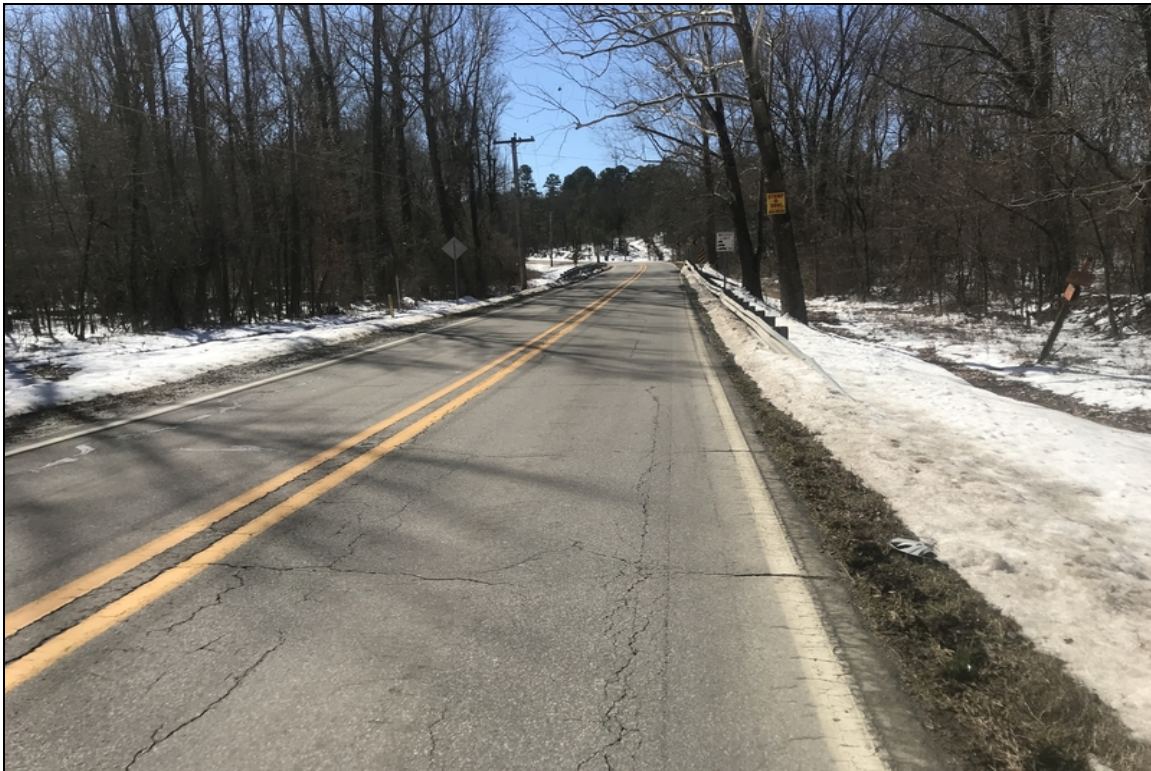
Approach looking south