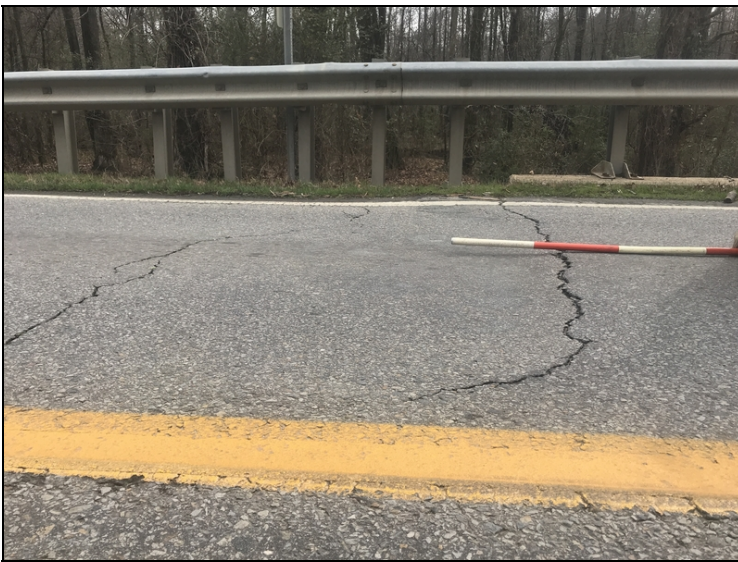
Approach roadway North end of bridge has settled, common south end.