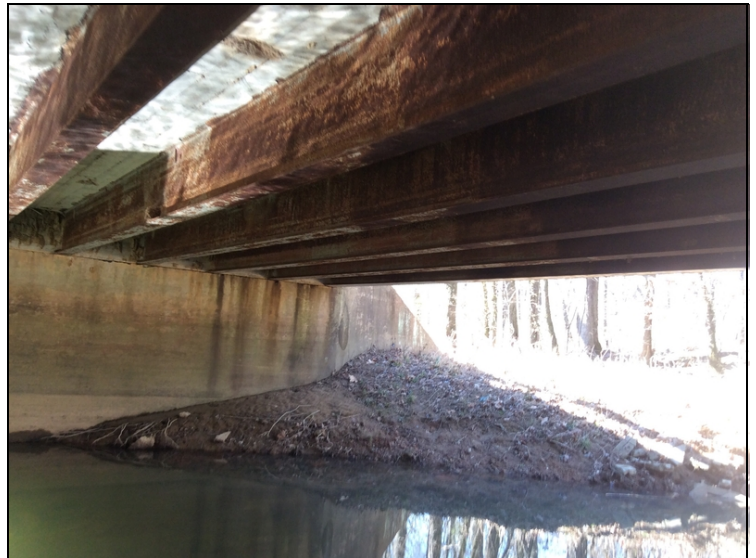
Surface rust on all beams.