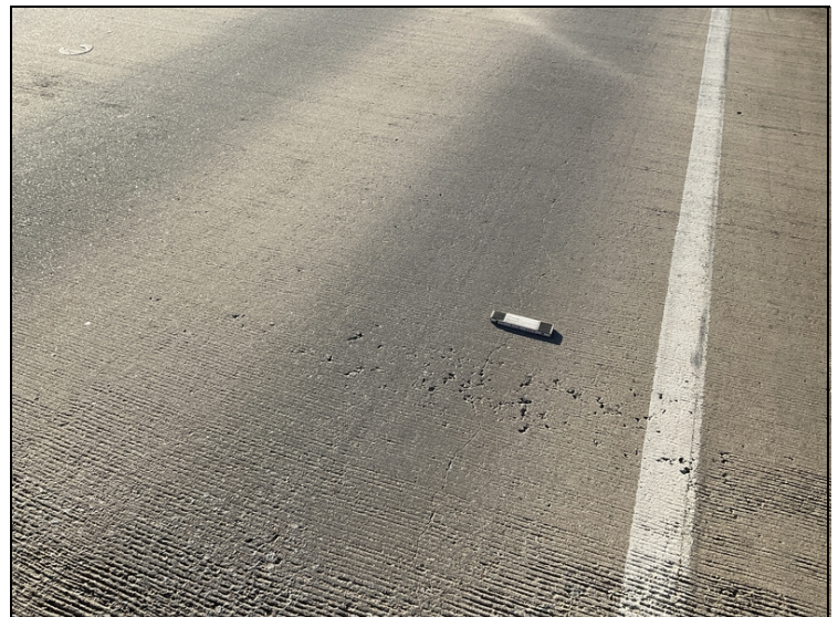
Span 3: Unsealed deck cracks up to 0.030 inch. Common to all spans