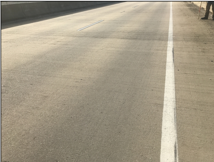
Span 3: Unsealed deck cracks up to 0.030 inch. Common to all spans