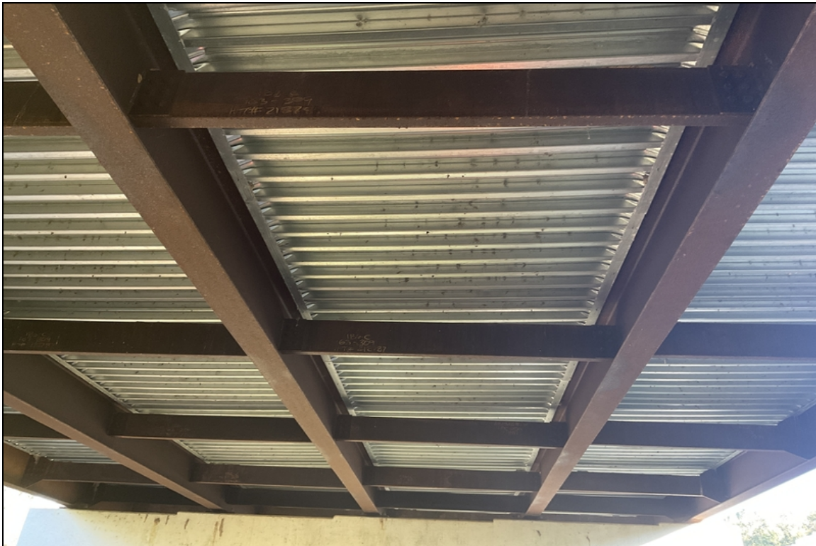
Span 2 under view