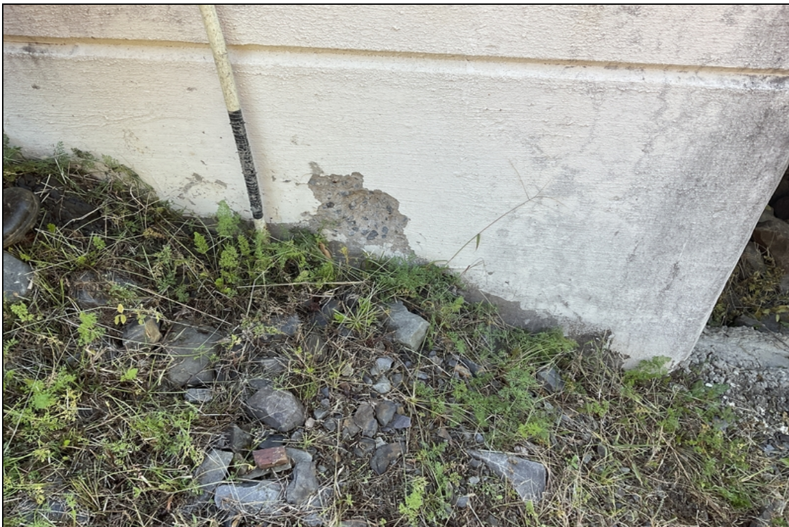
Bent 4 spall on left side