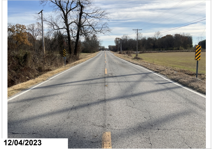
Roadway with log mile looking south.