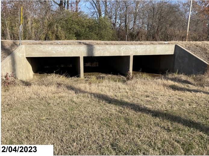
Elevation with log mile going right.