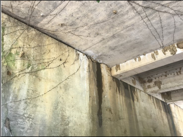
Bent # 1 Right - shallow spalling adjacent to Girder # 3.