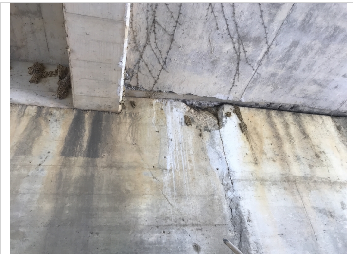
Bent # 2 Rt spalling adjacent to Girder # 3.