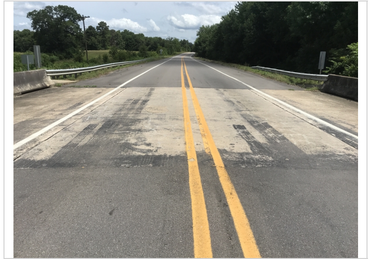
Typical driving surface of the deck.