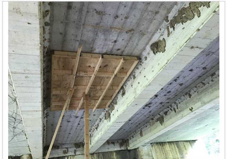
Deck soffit. Typical.