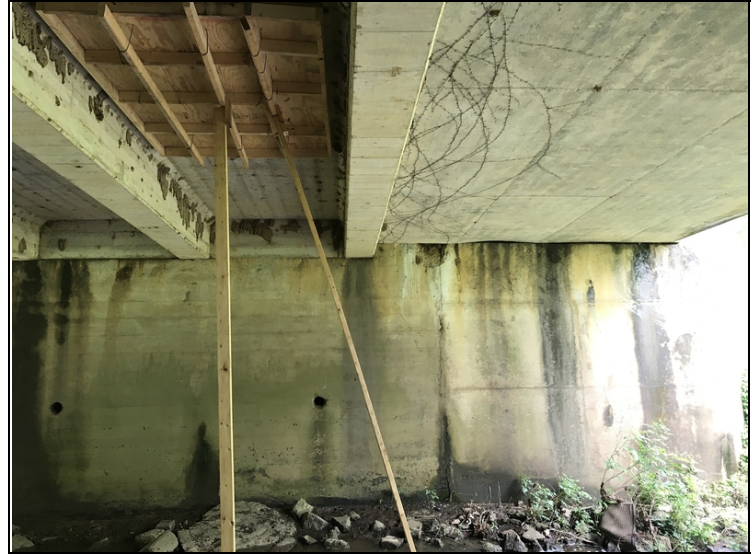
Spalling in the Right side of Bent # 2.