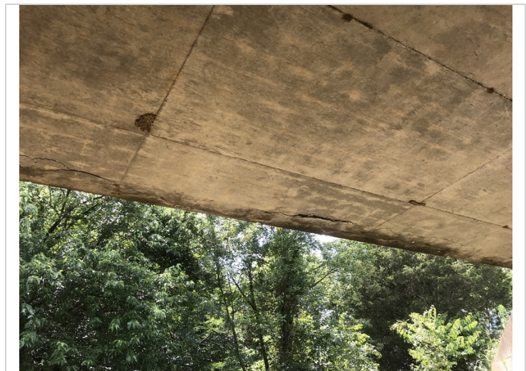
Delaminated concrete on the Lt edge of the slabs undersurface.