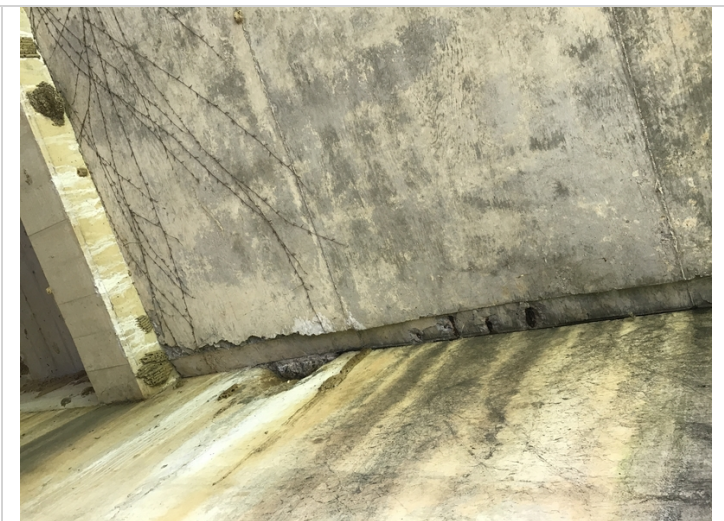
Exposed reinforcing steel in the Right side of the slab span adjacent to Bent # 2.