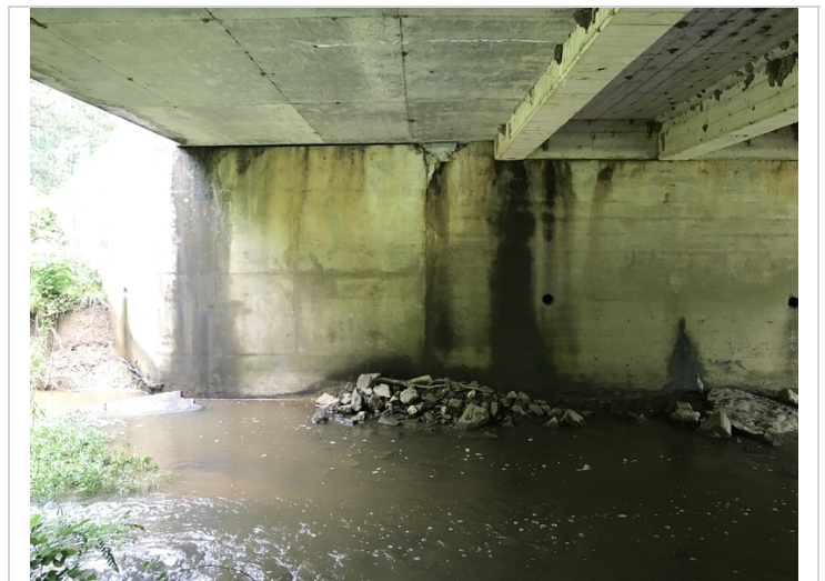
Left side of Bent # 2. Typical.