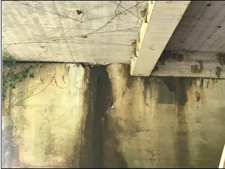
Spalling in the Right side of Bent # 1.