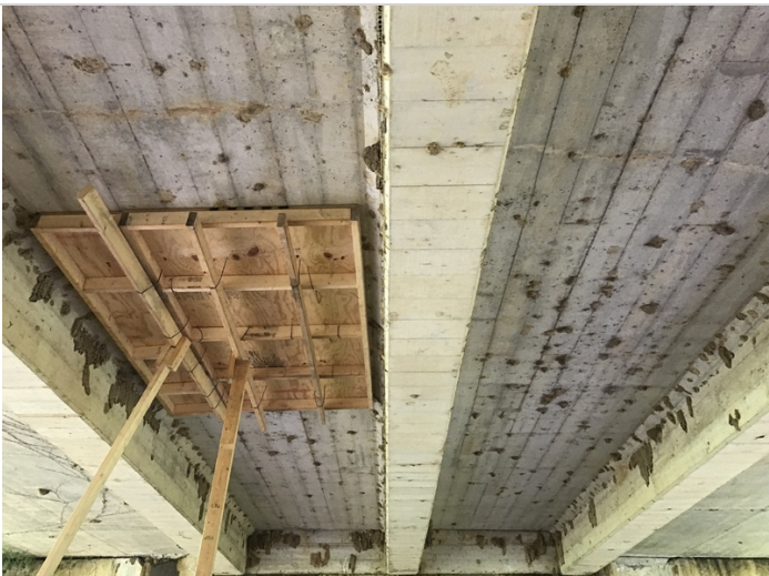
Deck soffit. Typical. Timber form work left in place.