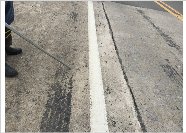
Hairline map cracking with light abrasion along the longitudinal construction joints.