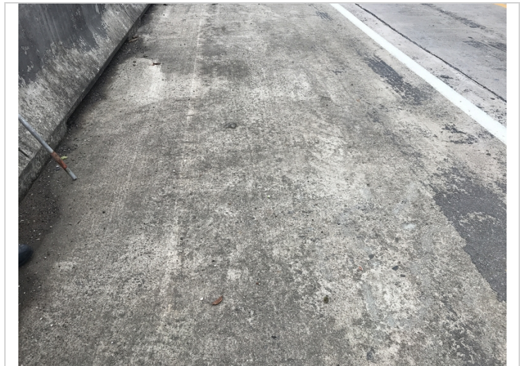
Driving surface of the slab span portion of the deck. Typical.