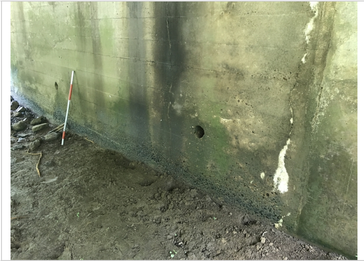
Bent # 1. Light abrasion with vertical cracks that have efflorescence.