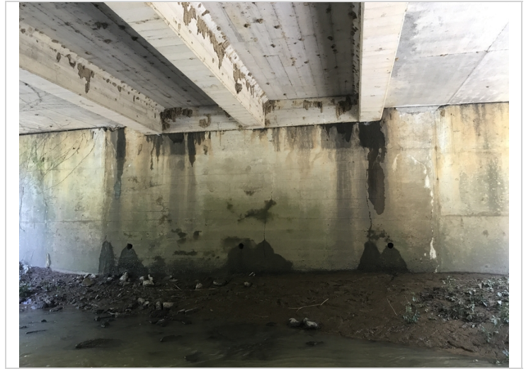
Bent # 1 vertical cracking in the abutment stem.