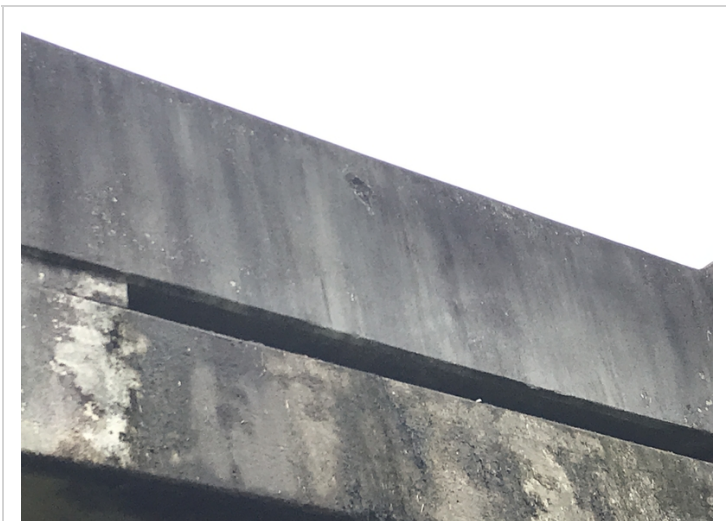
Minor 4" spall with no exposed reinforcing steel in the outside face of the Right parapet located approximately 6' from the North abutment.