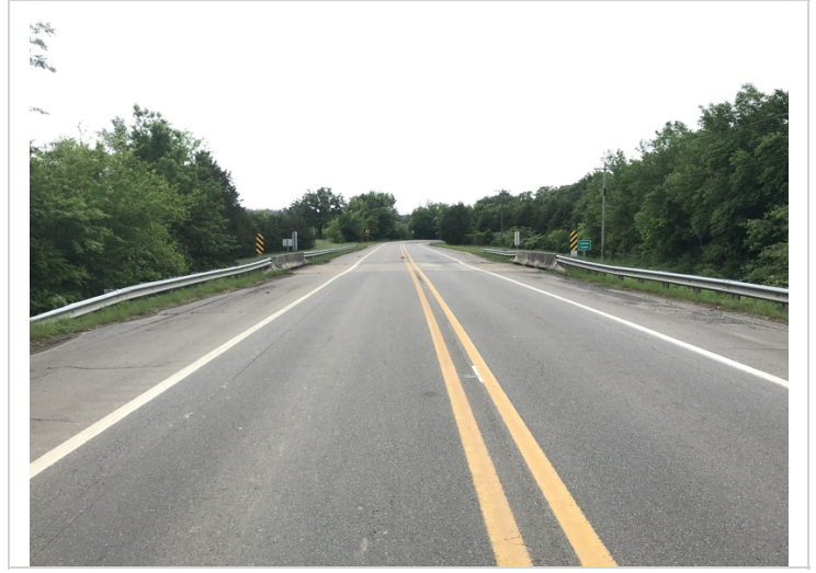
Approach roadway facing North.