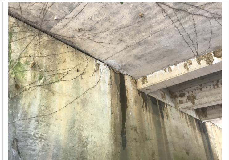
Bent # 1 Rt shallow spalling in the bearing area adjacent to Girder # 3.