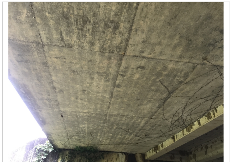
Right slab soffit. Typical.