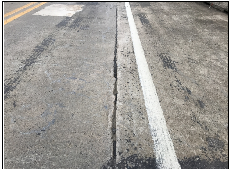
Deteriorated and Missing longitudinal construction joint sealant.