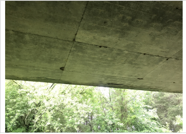
Left edge of slab soffit. Delaminated areas.