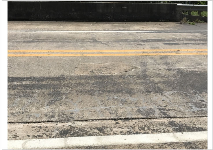
Northbound lane flex patch still solid.