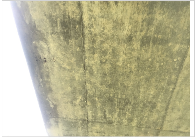
Delaminated area in the Right slab soffit.