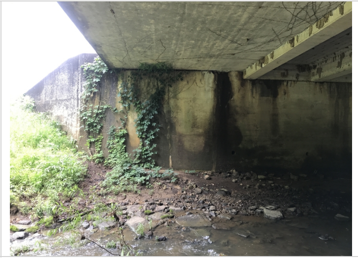
Right side of Bent # 1. Typical.