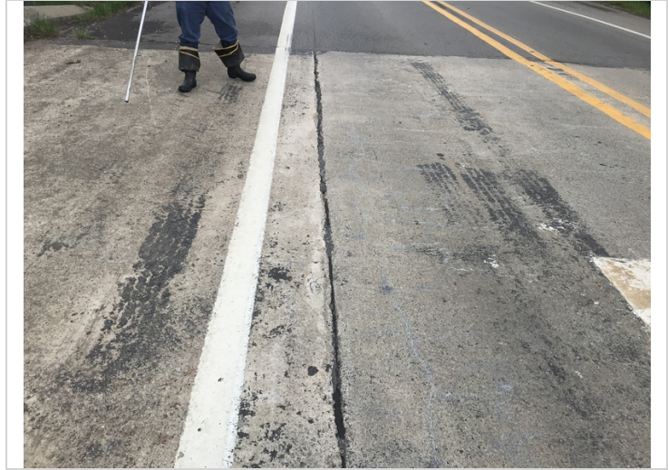
Deteriorated and missing sealant in the longitudinal construction joint.