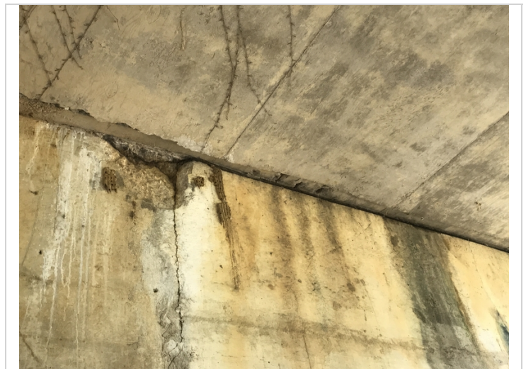
Spalling with exposed reinforcing steel adjacent to Bent # 2 approximately 5' Rt of Girder # 3.