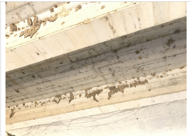
Bay # 2 cracking with efflorescence buildup.