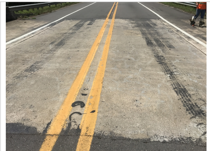
Typical driving surface of the deck.