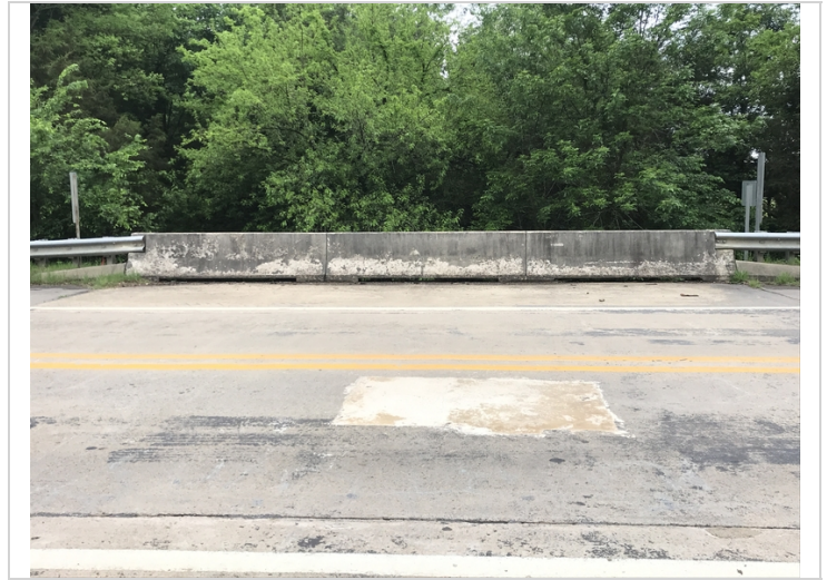
Left parapet wall. Typical.