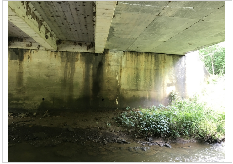
Left side of Bent # 1. Typical.