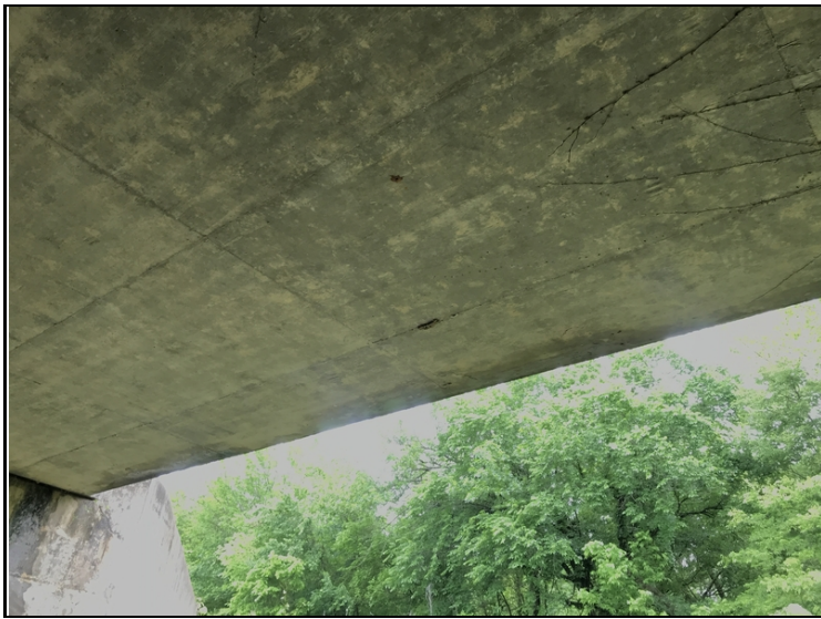
Right slab soffit. Delaminated areas.

The exterior edges of the slab soffit has longitudinal delaminated areas.