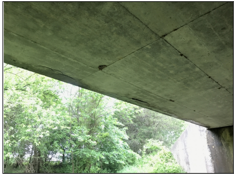
Left slab soffit. Delaminated areas.