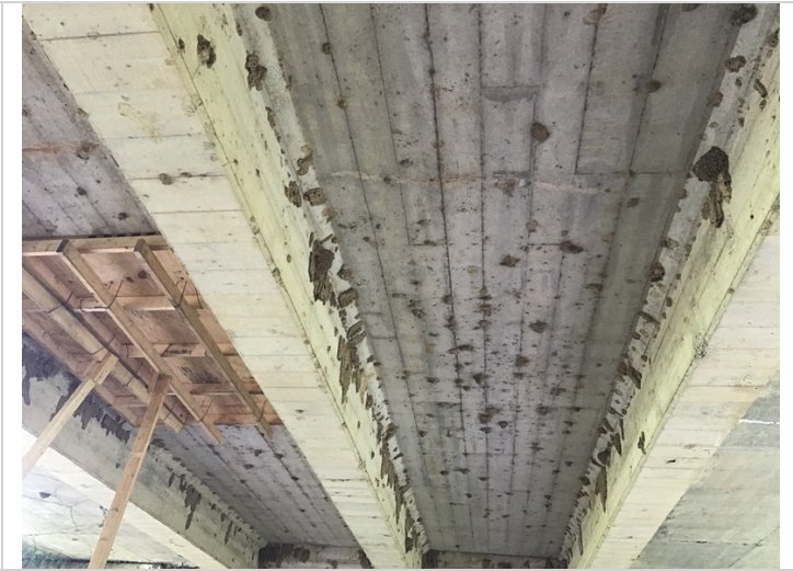
Deck soffit. Typical.