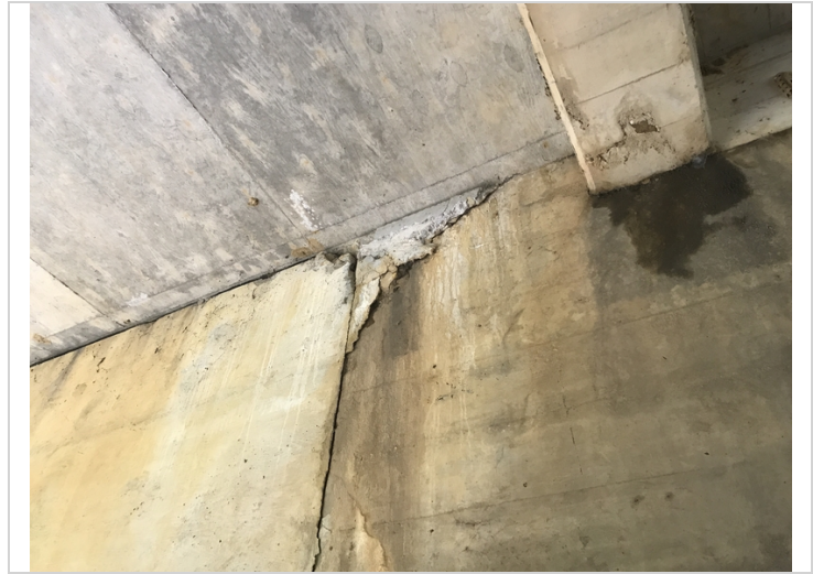
Bent # 2 large concrete delamination adjacent to Girder # 1.