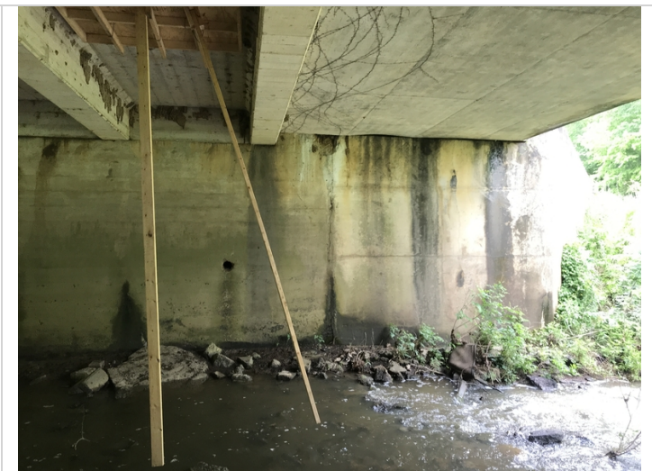
Right side of Bent # 2. Typical.