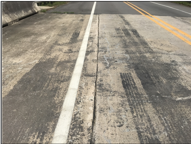
Failing joint sealant between the slab and wearing surface.

The sealant in the longitudinal construction joints is deteriorated and missing in locations.