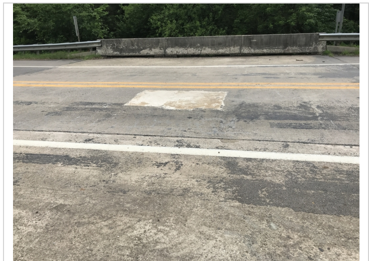
There is a 3' X 5' patched area at mid-span of Northbound lane appears to be holding during this inspection.