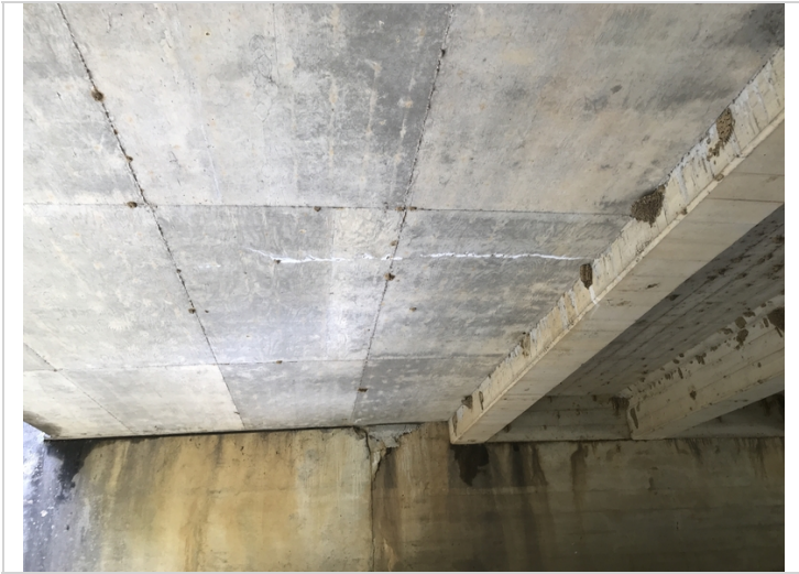
Lt slab crack with efflorescence.