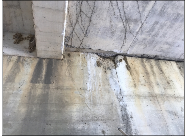
Bent # 2 Right - spalling adjacent to Girder # 3.