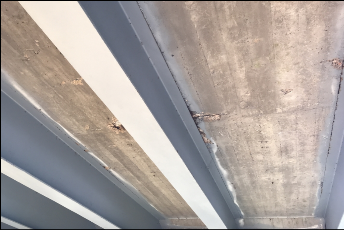
Underside of deck typical all spans