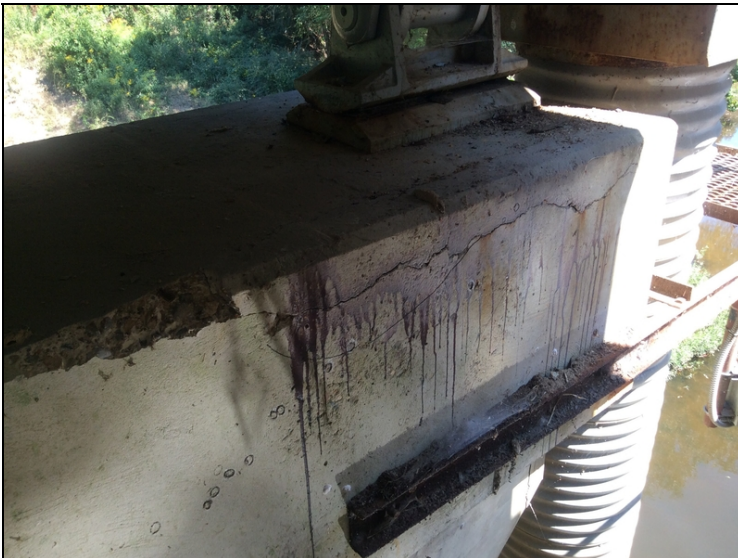
Bent 3 rt side south face span 2 side

CONCRETE CAPS AT BENTS #3 AND #4 HORIZONTAL CRACK NEAR THE TOP OF THE CAP. NOTE: WAS SEALED YEARS AGO BUT NEED SEALED AGAIN.