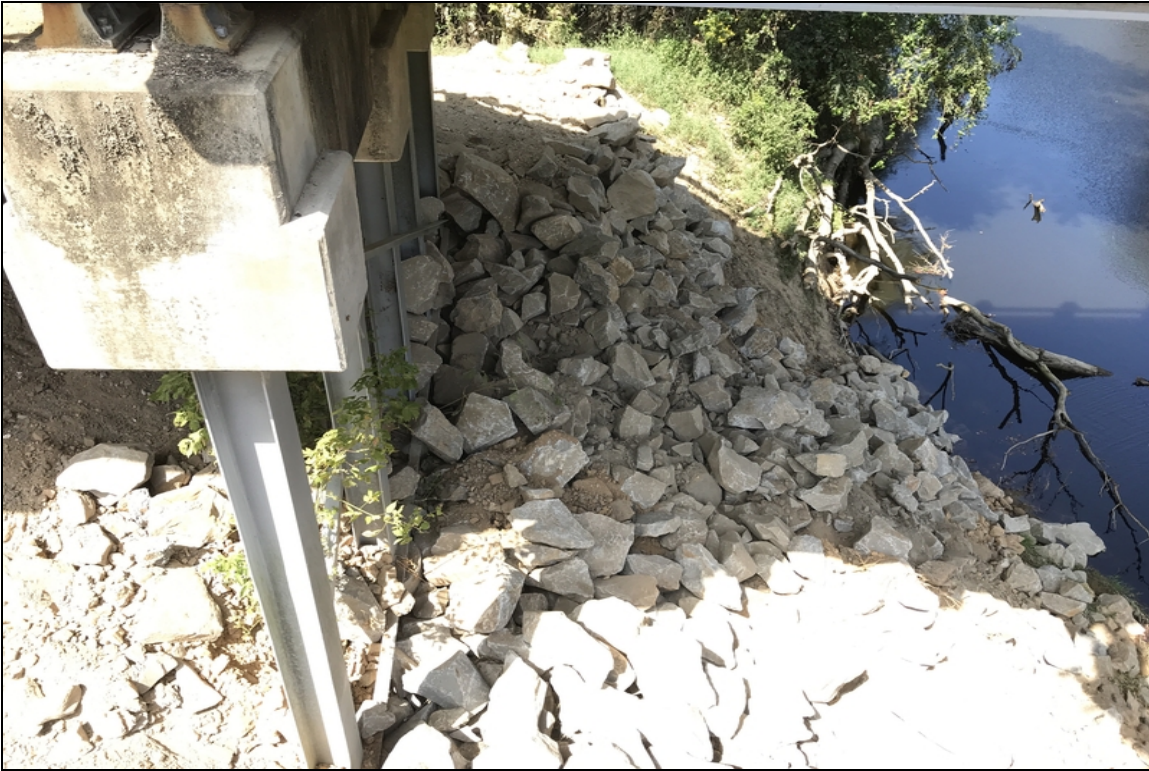
Bent 2 repair