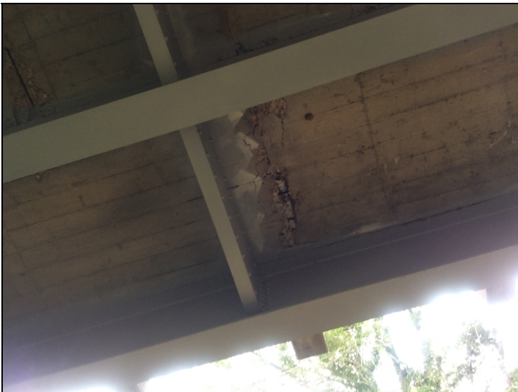
Spall span 4

BOTTOM OF DECK IN SPAN #4 36"X18"X 1-1/2" SPALL WITH REBAR EXPOSED. SPALLS WITH REBAR EXPOSED IN ALL SPANS. Span 4 bay 1 and 2 and 3 ,4 spalls with rebar exposed 2021 Span 1 bay 2,3, large spall with rebar exposed bottom side of deck 2021