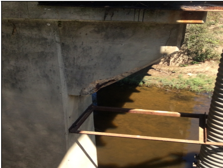
Bent 3 cap haunch rt side