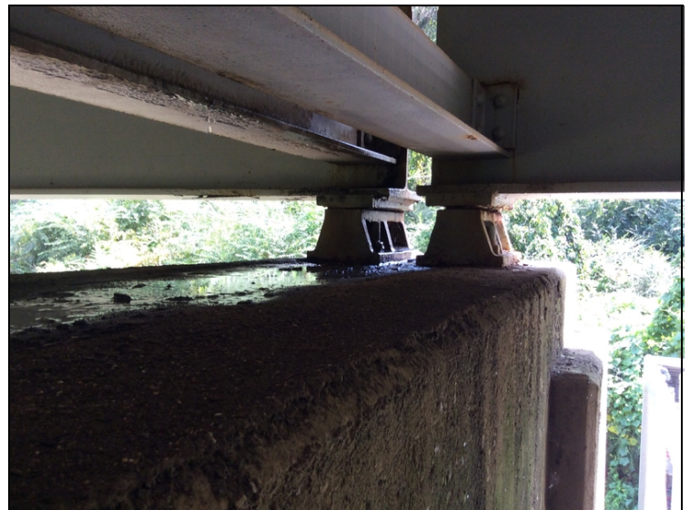
WATER LEAKING CAUSING PACK RUST