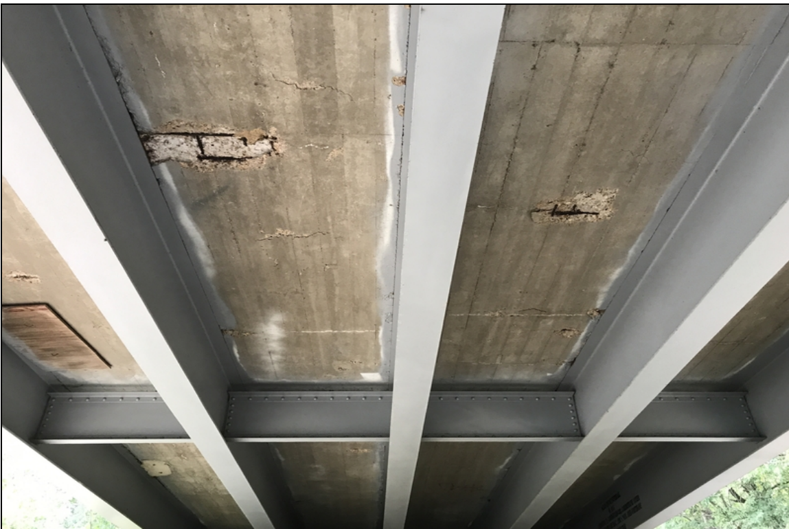
Underside of deck typical all spans