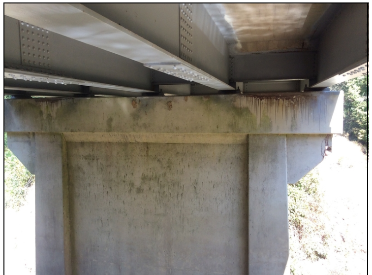
Cracks in cap BT 4