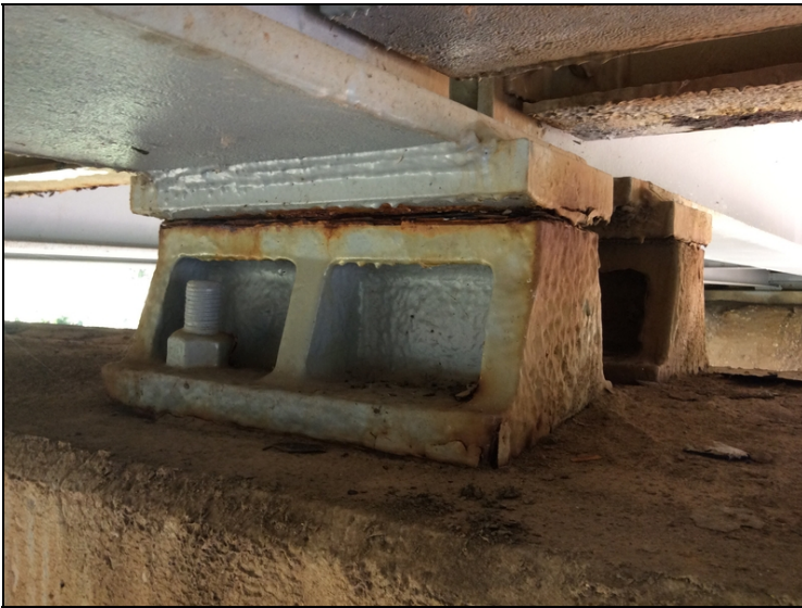
PACK RUST AND SECTION LOSS TYPICAL ALL BEARINGS

PACK RUST AND SECTION RUST TYPICALLY ALL BEARINGS