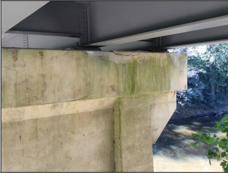
Bent 4 cap on north side above col.1