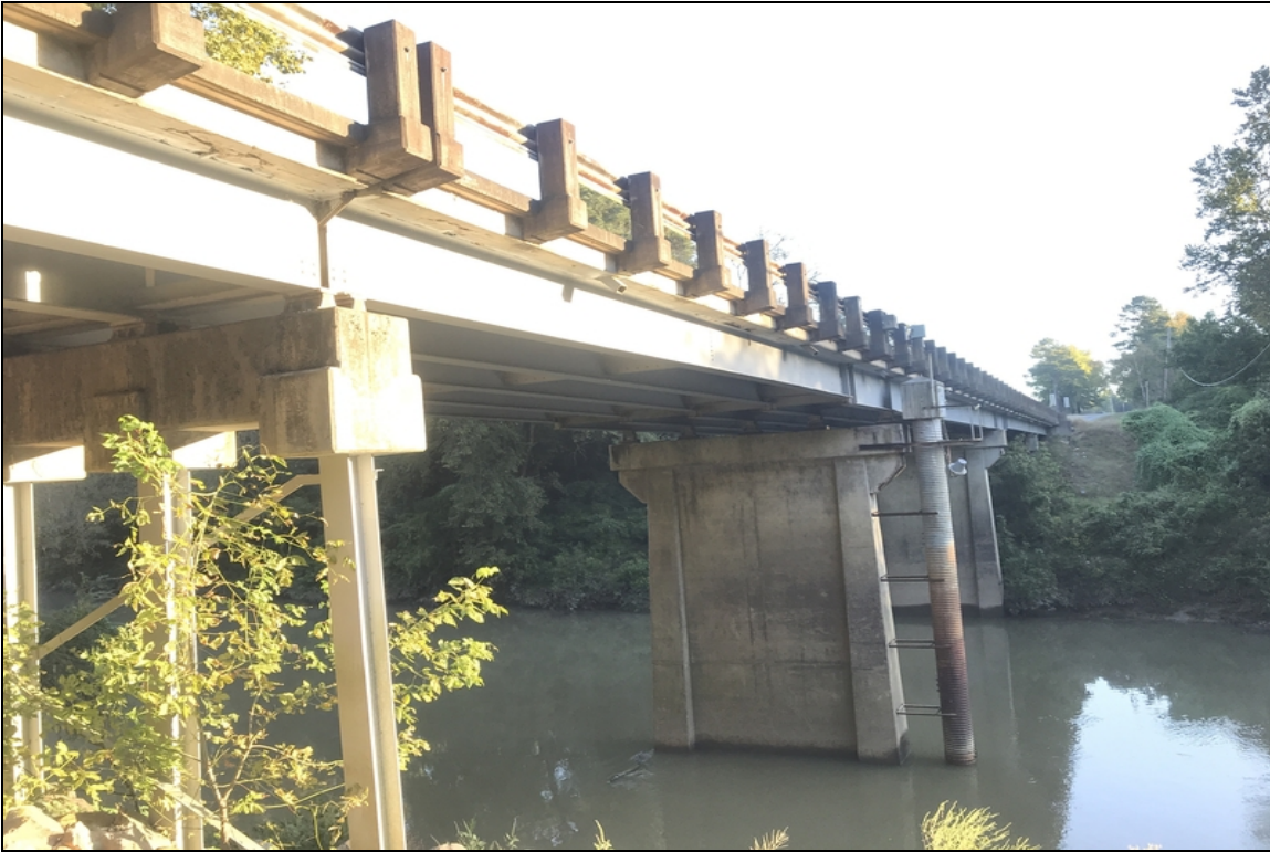
Superstructure and pin and hanger assembly