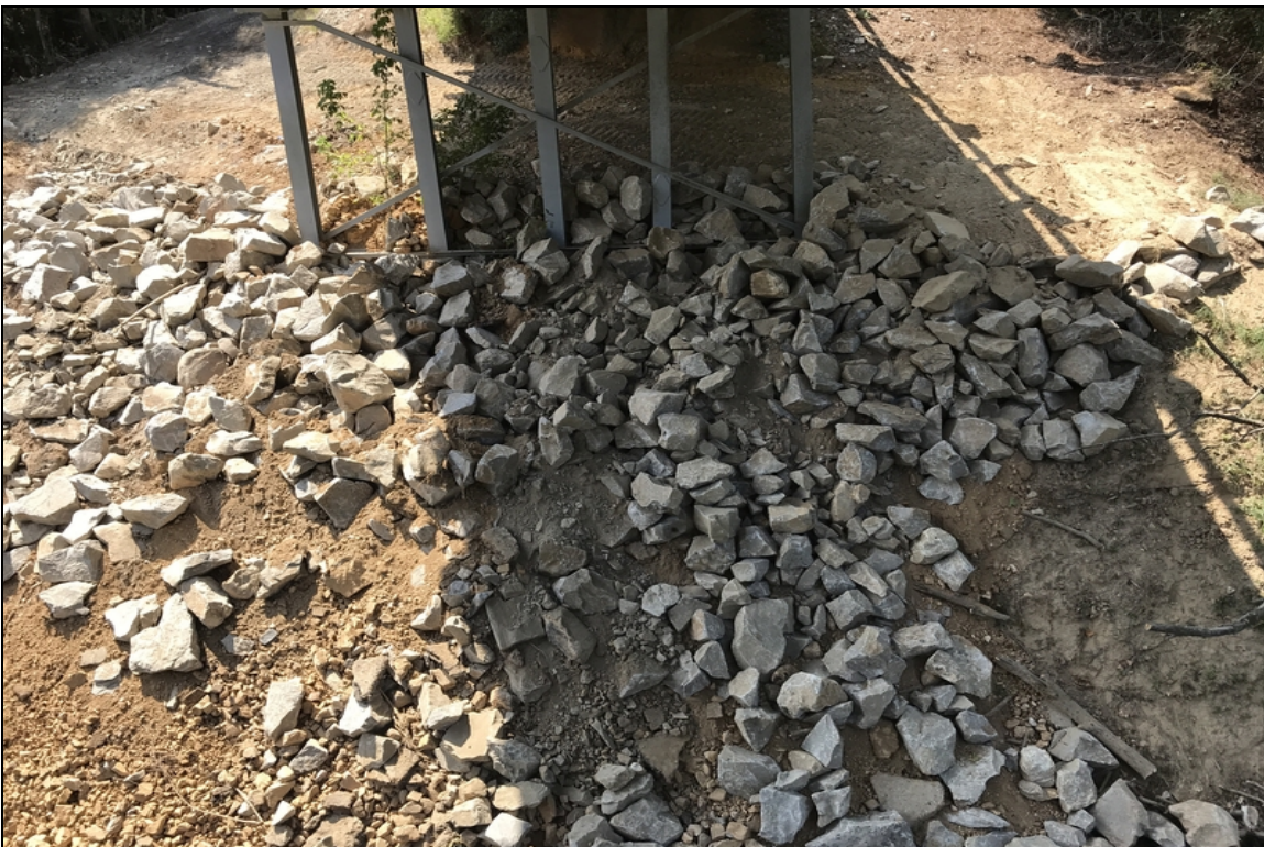
Bent 2 repair