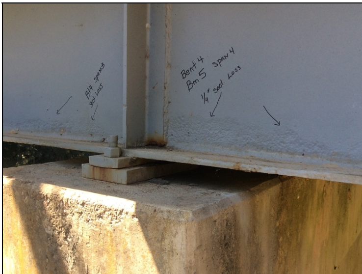
Section loss to beam 5 at bent 4

SPAN #2 BEAM #4 1/4 SECTION LOSS TO BOTTOM FLANGE BELOW PIN & HANGER AREA