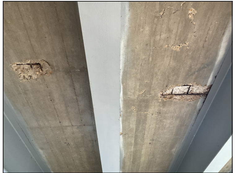
2021 Span 1 bay 2,3, large spall with rebar exposed bottom side of deck