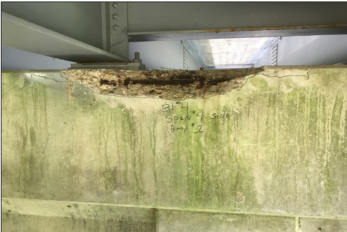
Spall with rebar exposed bent 4 bay 1 span 4 side