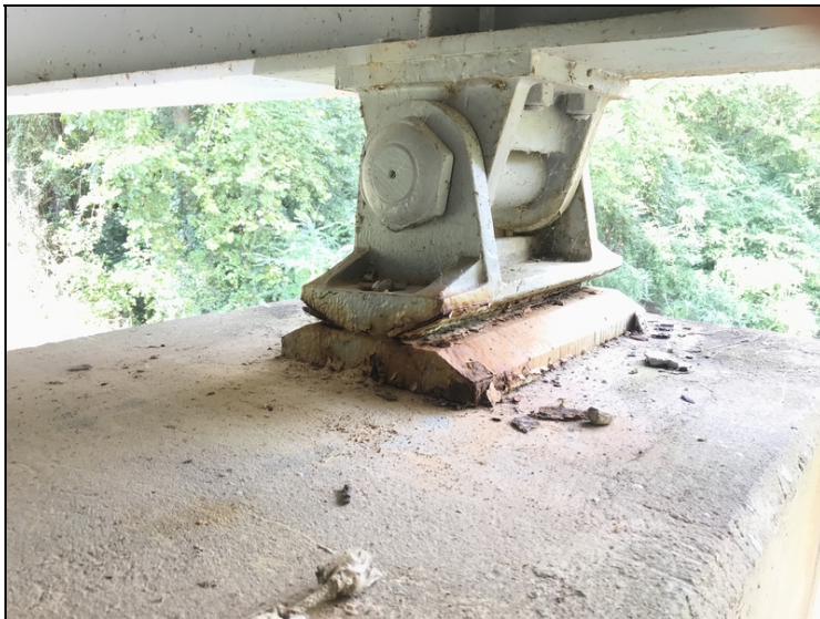
ANCHOR BOLTS ATE IN TWO BY SECTION LOSS

BEARING #3,#4& #5—HAS 1 BOLT ATE IN TWO BY SECTION LOSS