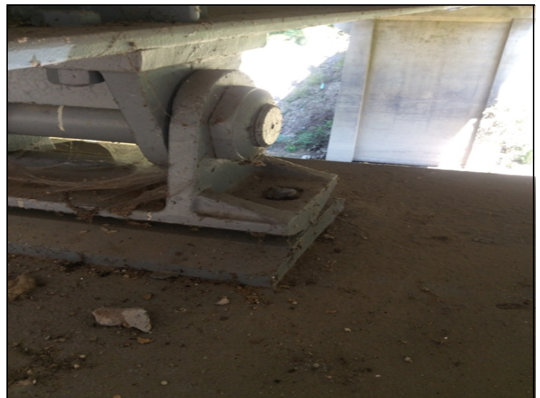
Missing anchor bolt top and nut