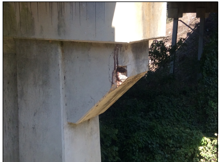
Cap haunch at bent 4 rt side