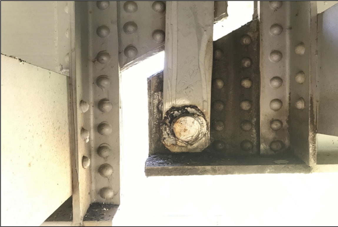
Beam 1 span 4 pin is offset