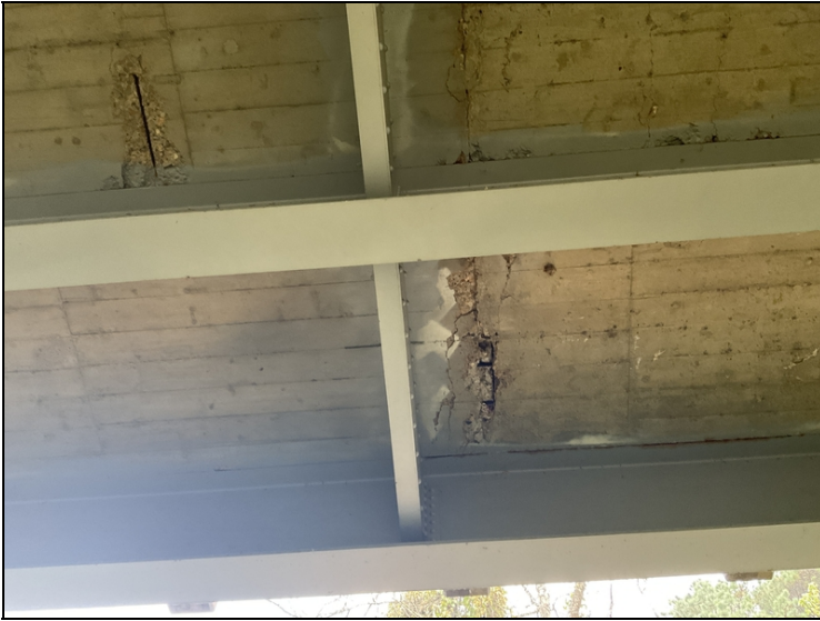
Span 4 bay 1 and 2 and 3 ,4 spalls with rebar exposed 2021