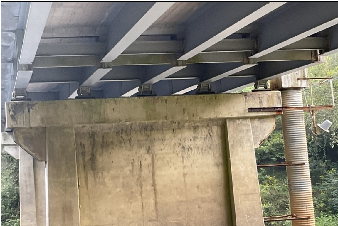
2021 Cracking at bent 3 bearing area right and left side of cap