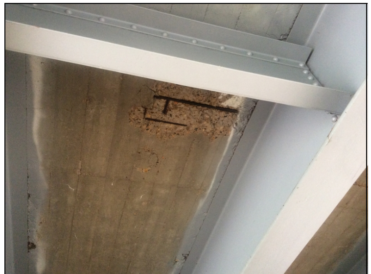
Spalls with rebar exposed all spans under deck