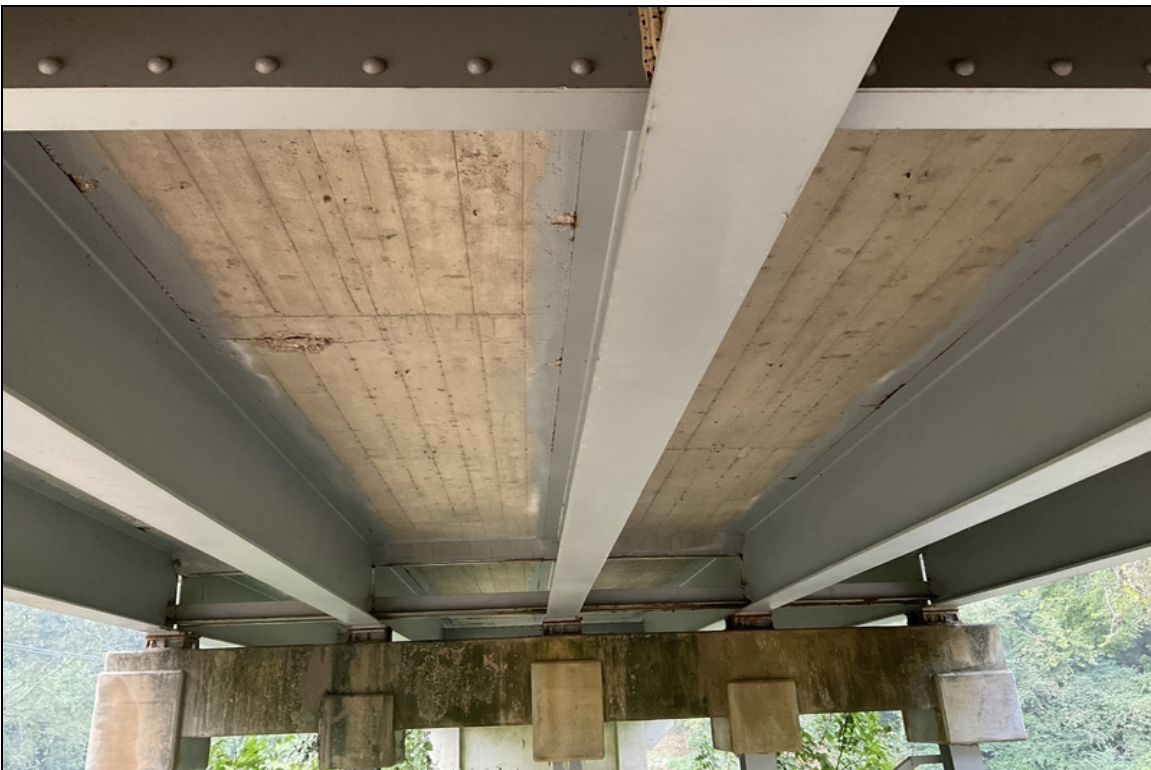
Bottom of deck