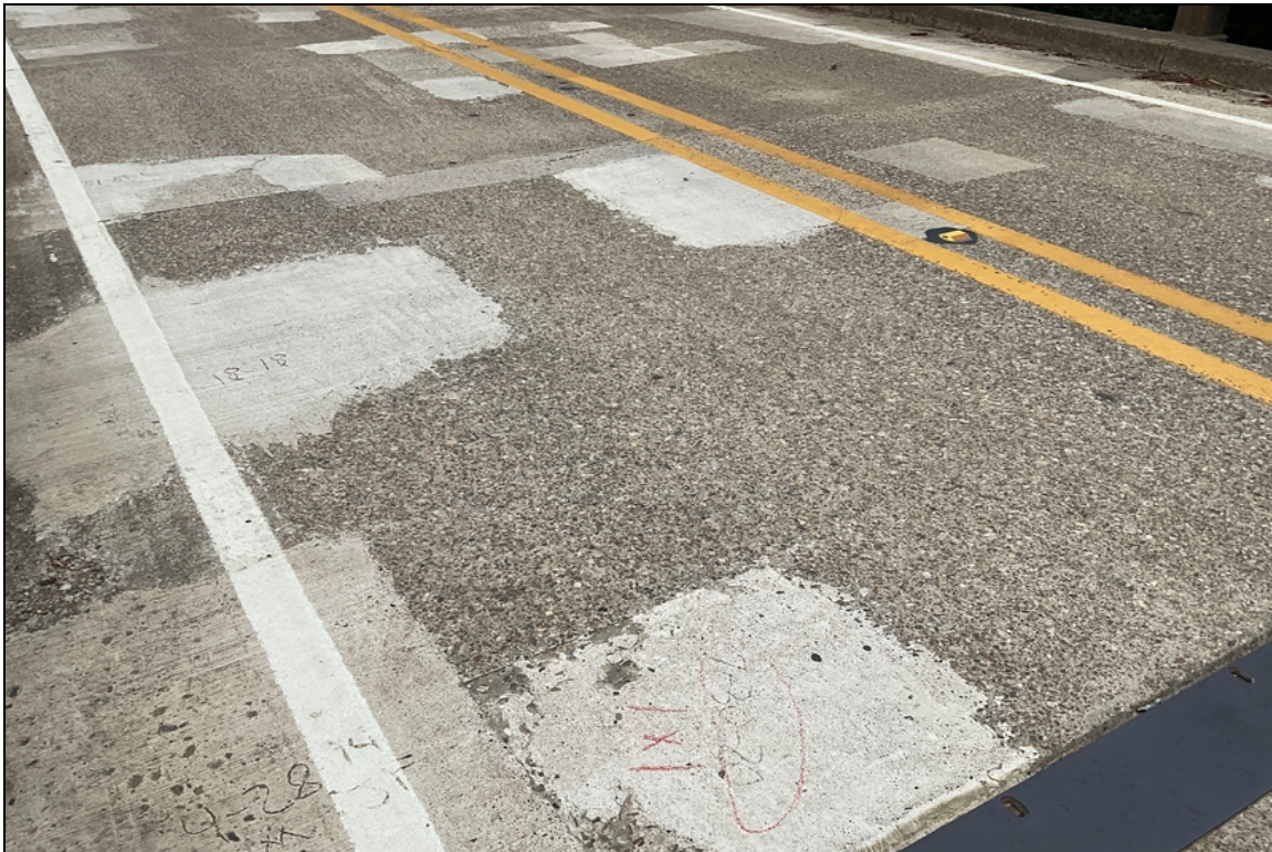
Deck patches 2020 and 2021