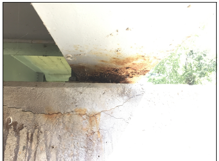
Rust and section loss at bent 4 beam 5