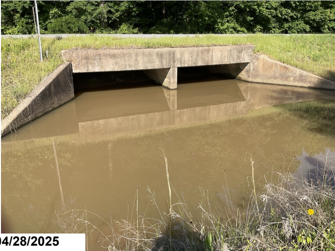
Elevation: Right side