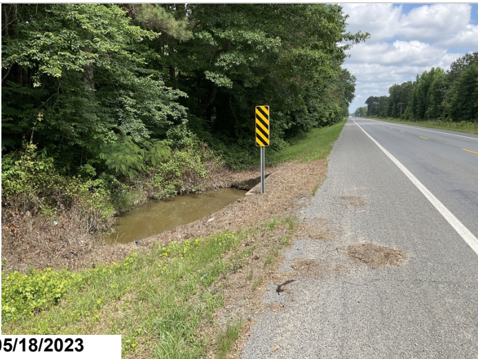
Sign - left side: No log mile sign