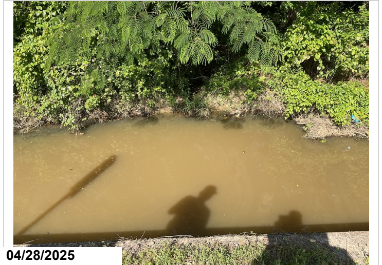
Channel: Left side ( No flow from R/W).