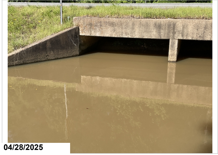
Culvert Right Side: Abrasion to lower 1/3 of walls.