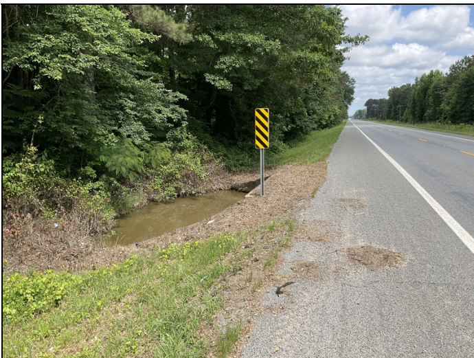
Sign - left side: No log mile sign

Sign - left and right side: No log mile sign - object marker and post in place.