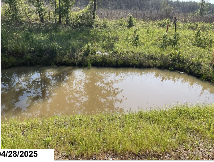
Channel: Right side