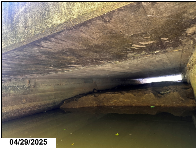
Barrel 1: Filled with debris.