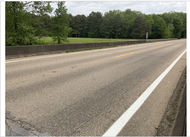
Deck over view.