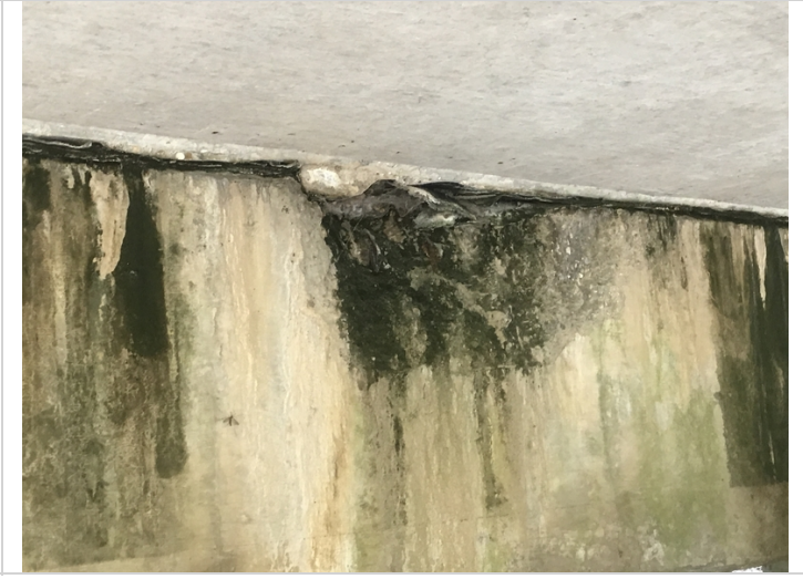
Bent 3 back face has spall with exposed rebar in left key way.