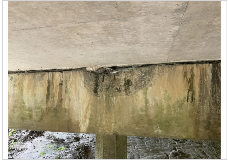
Bent 3 cap back left at key way has spall with exposed rebar.