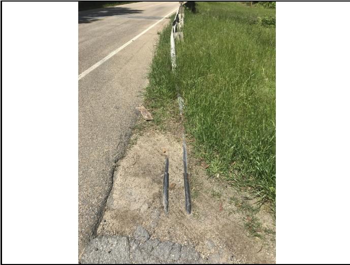
Approach railing - Bent 1 right : Damage

Approach railing - Bent 1 right: Some impact damage to approximately 35' of railing and posts.