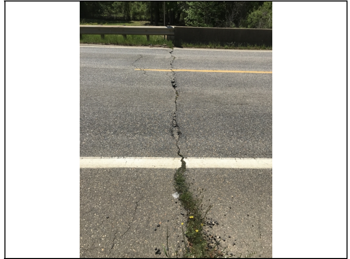
Approach roadway - Bent 1 : Pot holes