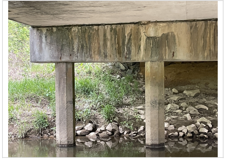
Bent 3 cap back has delams at keyways.