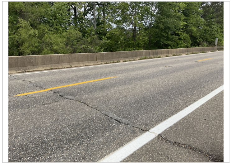
Deck over view