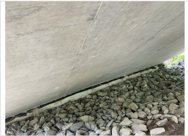
Under view of deck.