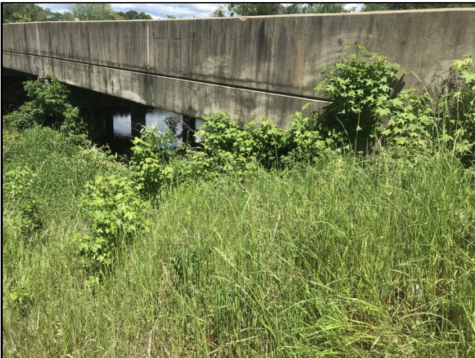
End-slope - Bent 1 left : Vegetation

Channel/end-slope - Span 1: Several small trees, bushes, or other vegetation growing under bridge.