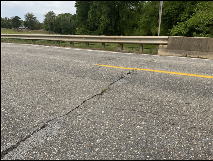
Approach roadway has settlement and rutting.

Approach roadway - Bents 1 & 4: Deterioration/cracks in wearing surface - becoming small pot-holes.