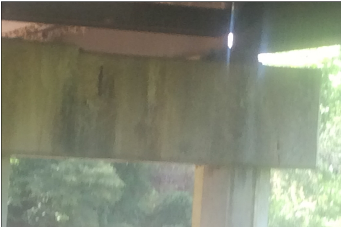
Bent 2 back has small spall with exposed rebar. Common at bent 5 back.