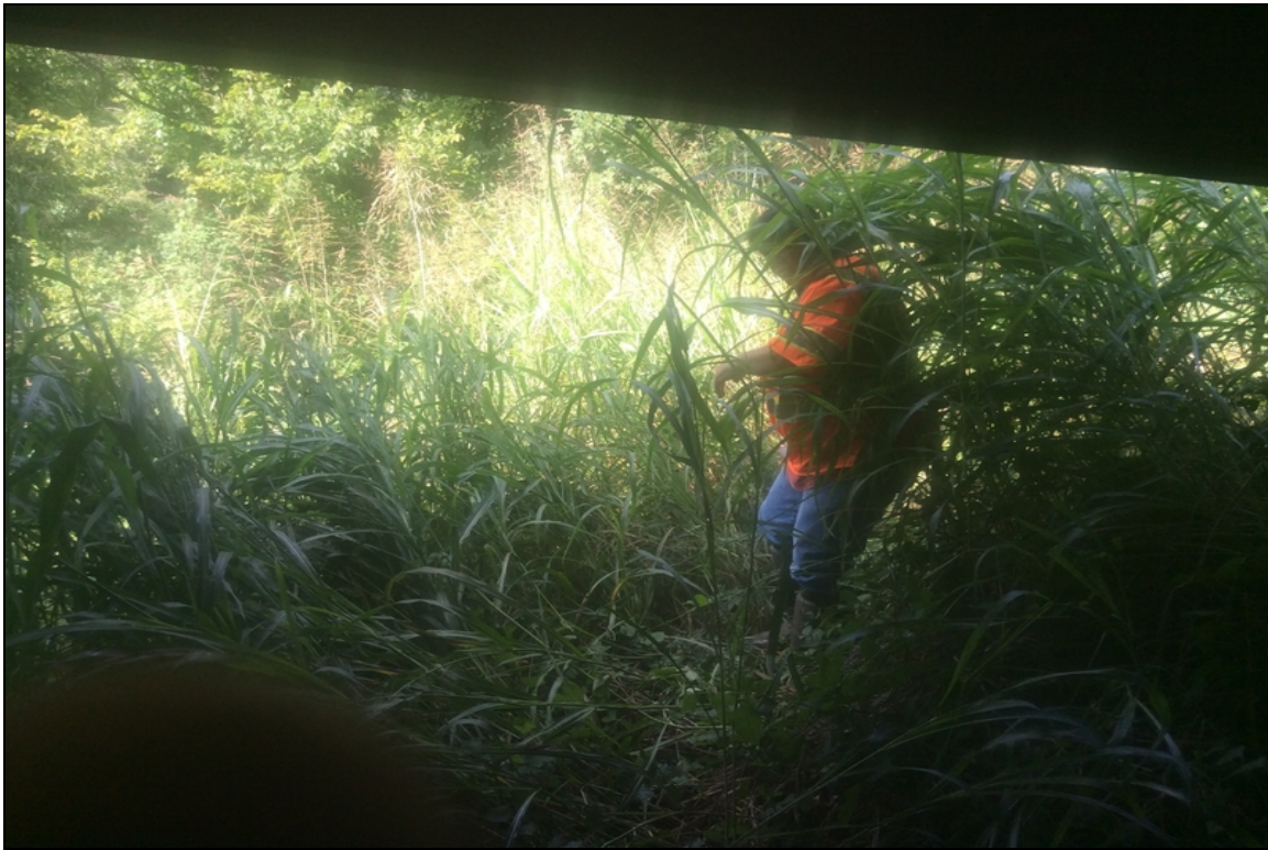
Span 1 end slope has vines and vegetation growing under bridge.