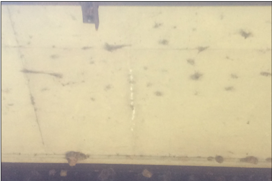
Span 5 between girders 1 & 2 soffit has transverse crack with efflorescence.