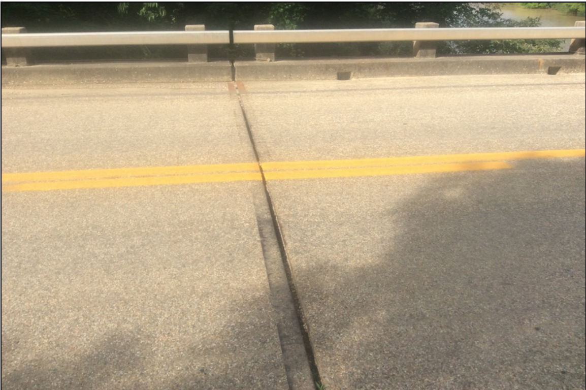
Bent 5 joint seal torn and missing.