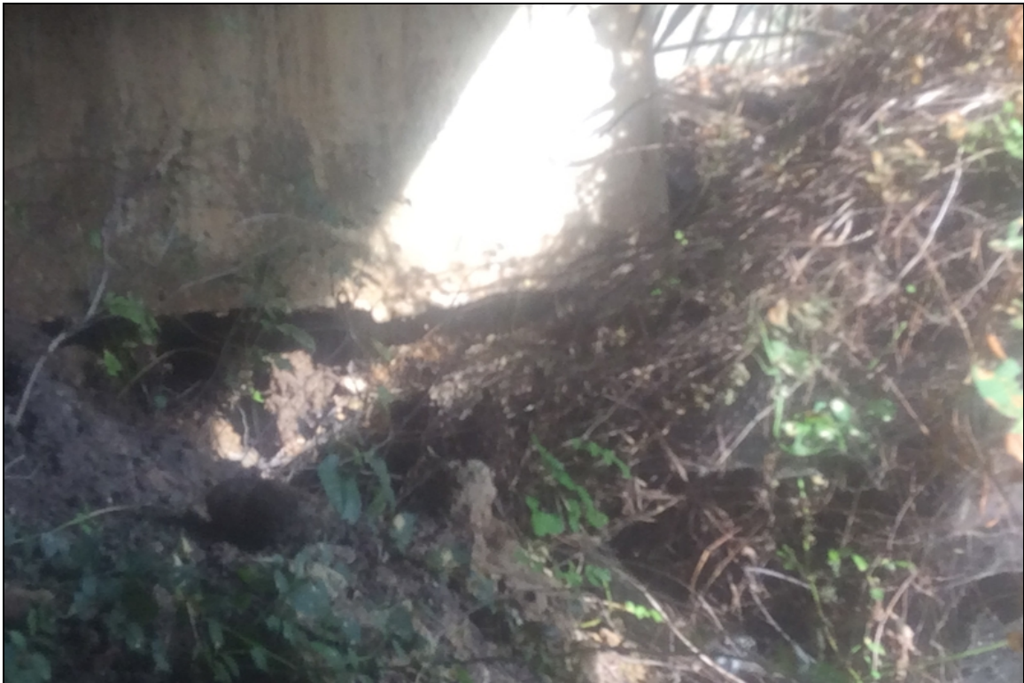
Span 1 left side has small area of erosion to end slope near pile 1.