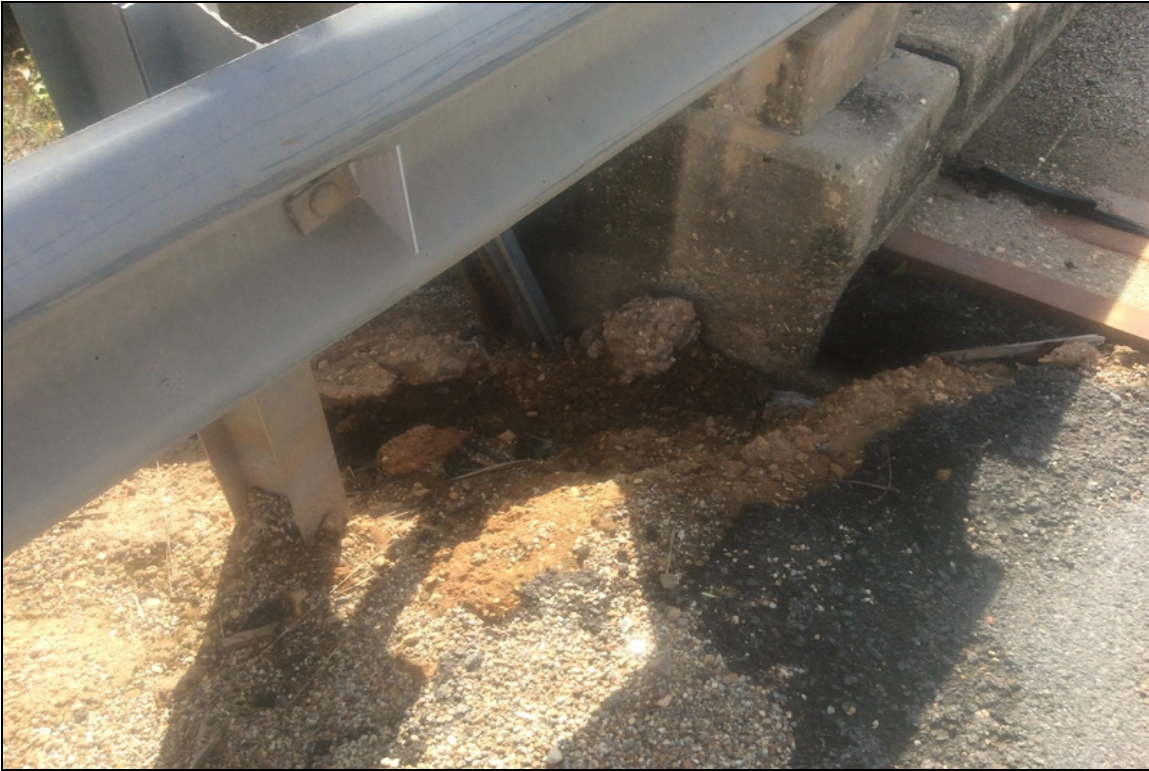
Northwest approach roadway has some erosion encroaching into shoulder area. Common southwest approach roadway.