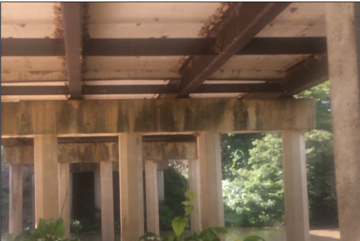
Overview of soffit and girders.