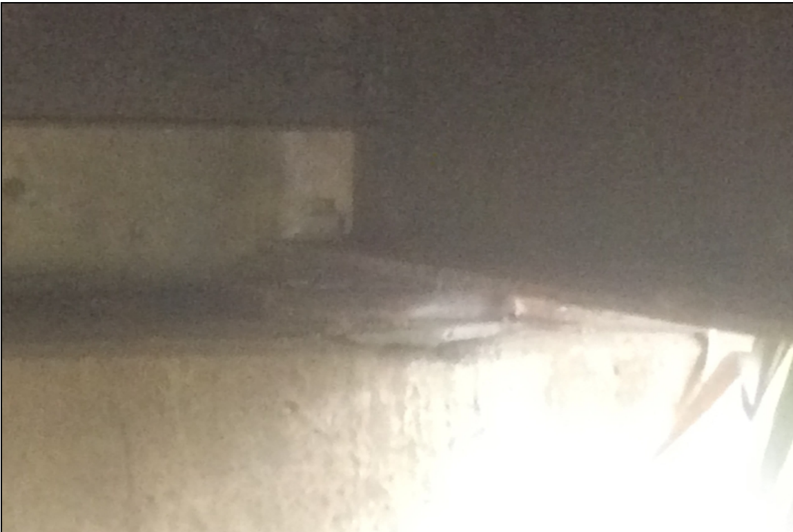
Bent 1 bearing 1 has some rust forming due to leaking joint seals.