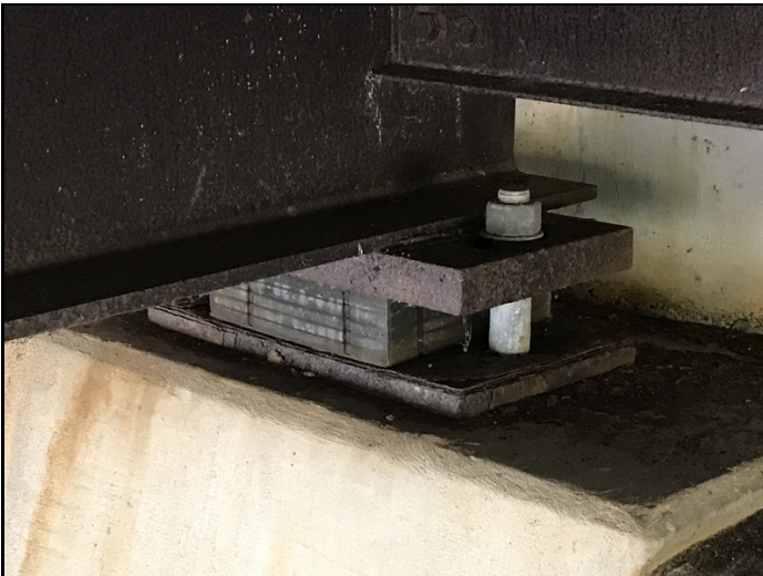
Typical corrosion with laminations on abutment #1 bearings

Abutment #2 girders #2,3,4,5 have corrosion on sole plates and masonry plates with laminations.