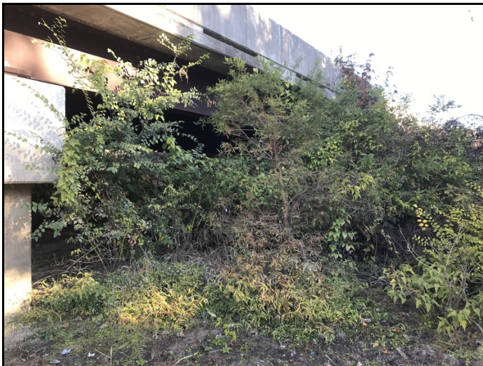
Vegetation growing beside and under bridge

Vegetation is growing under and beside bridge.