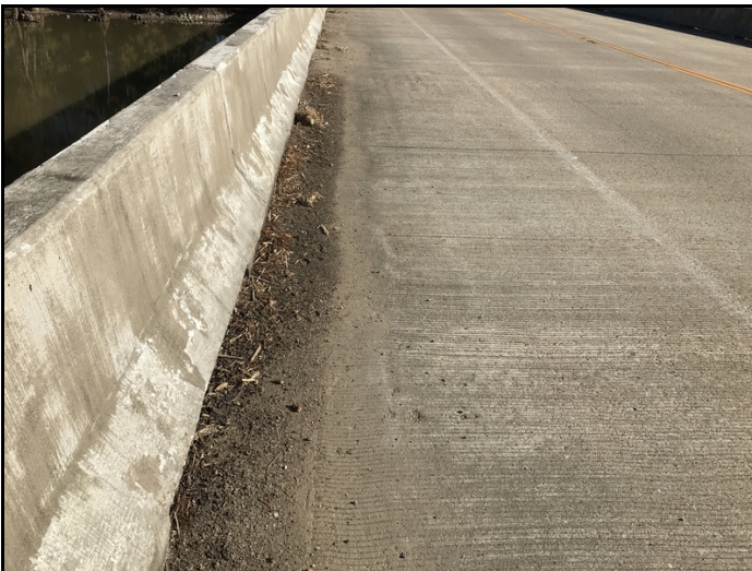
Dirt and debris in gutters