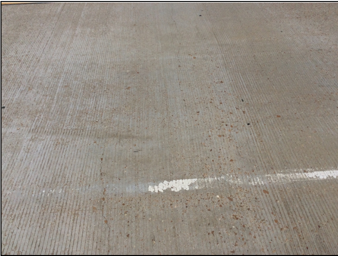
Typical deck cracks.