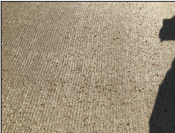
Typical deck crack.

Deck has open transverse and longitudinal cracks spaced three to four feet apart.