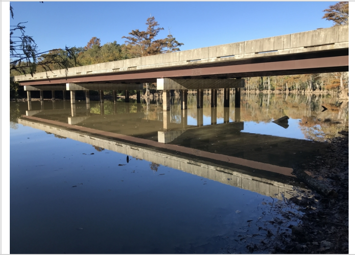
Side view / elevation