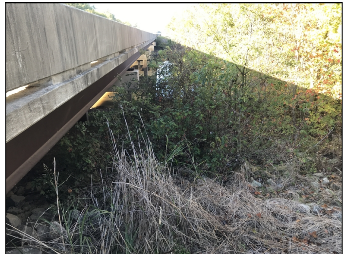
Trees and vegetation growing beside and under bridge