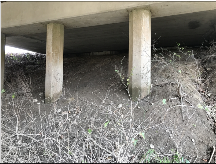
Abutment #2 slope erosion

Abutment #2 slope is eroded between pile #2,3 and pile #5,6 with depths up to two feet extending down slope.