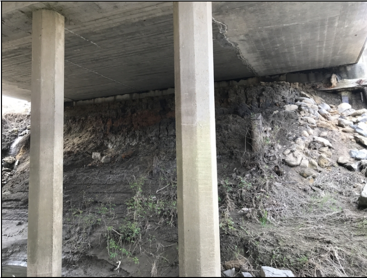
Abutment #1 slope