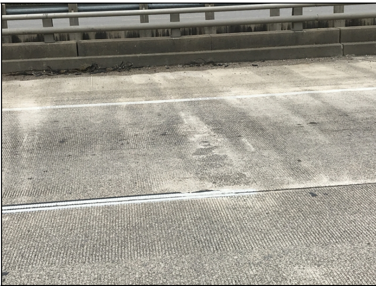
Typical debris in gutter.