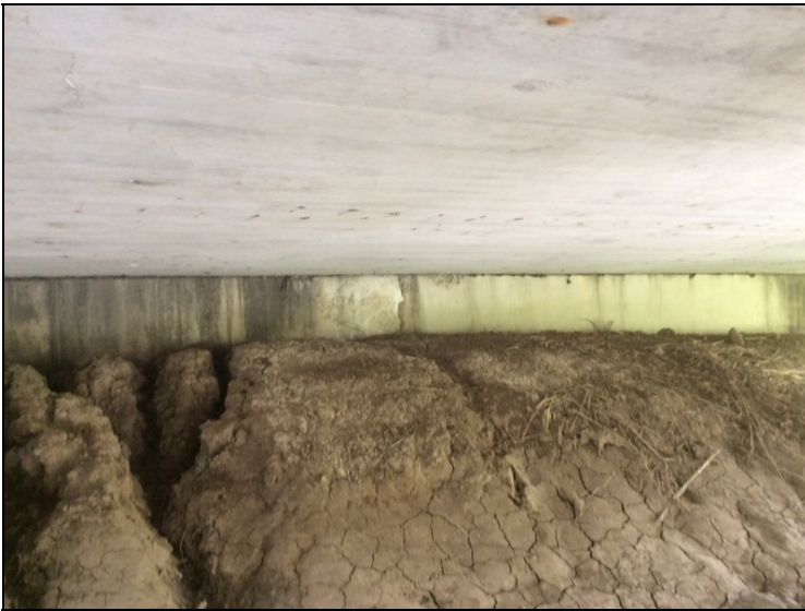
Abutment 2 cap