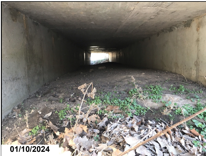
Sediment build up in barrel 1