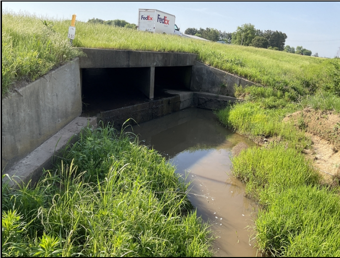
Outlet end scour

Channel is scoured 2' below flow line at outlet end. Scour is beginning to undermine toe wall.