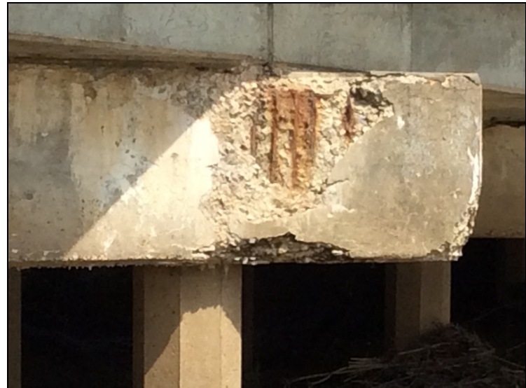
Bent 5 Rt