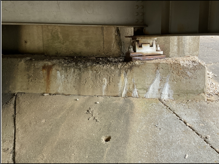
Bent 4 right