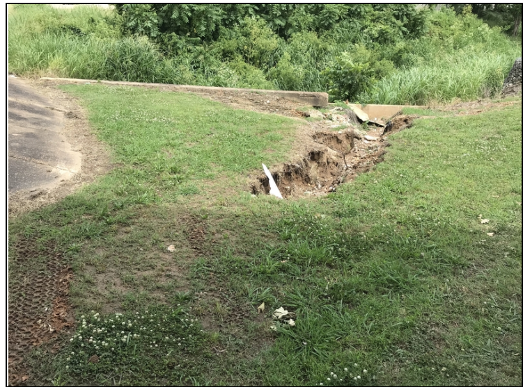
Barrel 2 Lt