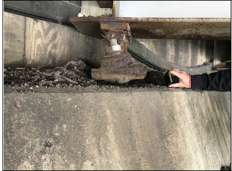
Span 1 bent 1 bearing 8 - 2" gap on front side