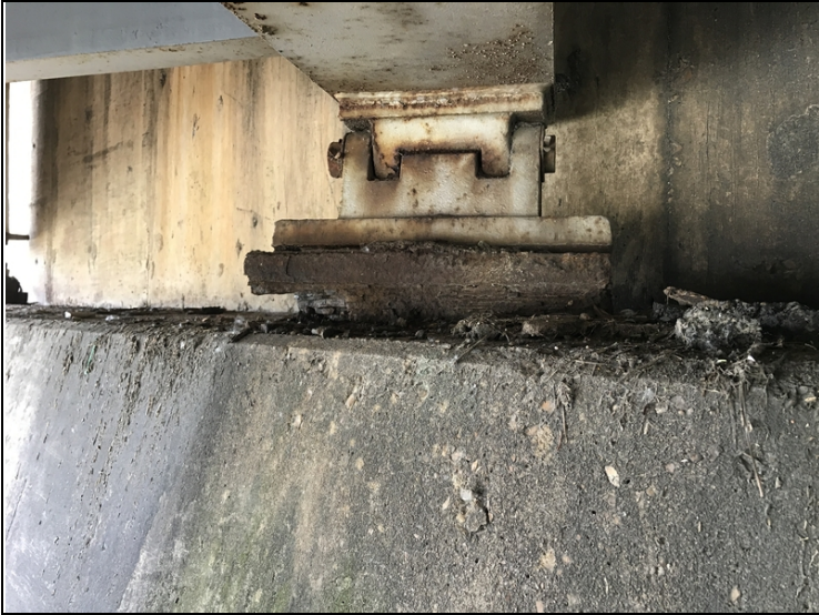
Span 1 bent 1 bearing 9