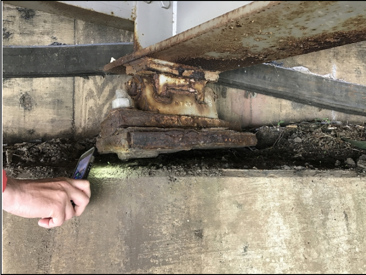
Span 1 bent 1 bearing 8