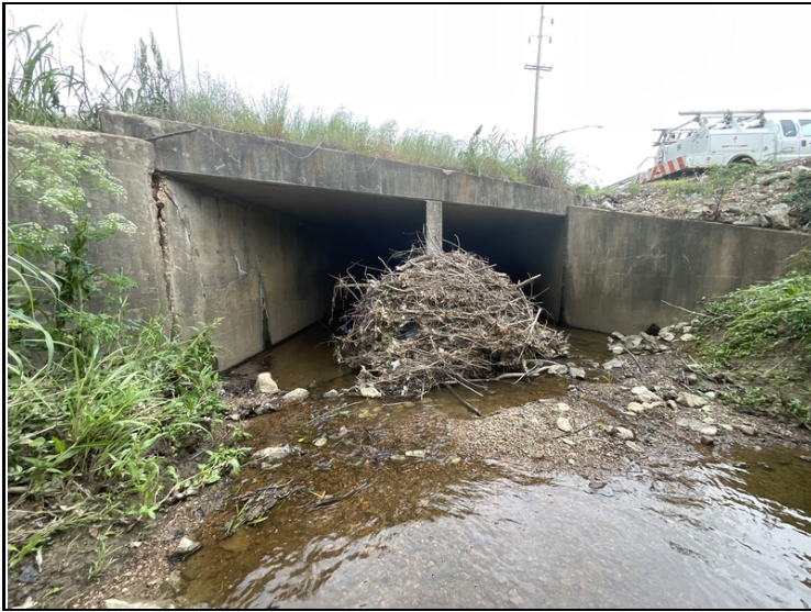
Right end inlet