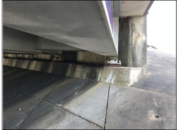
Bent 4 Rt