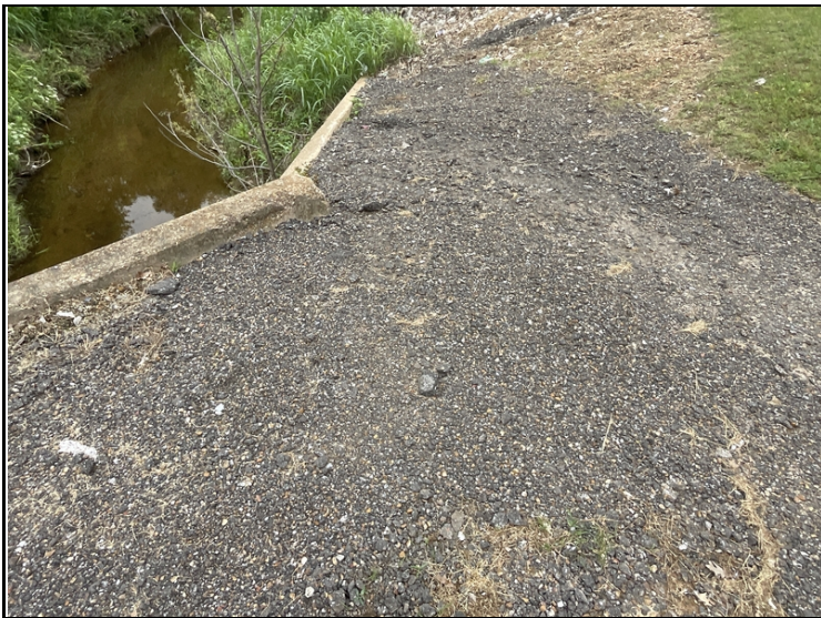
Erosion repaired barrel 2