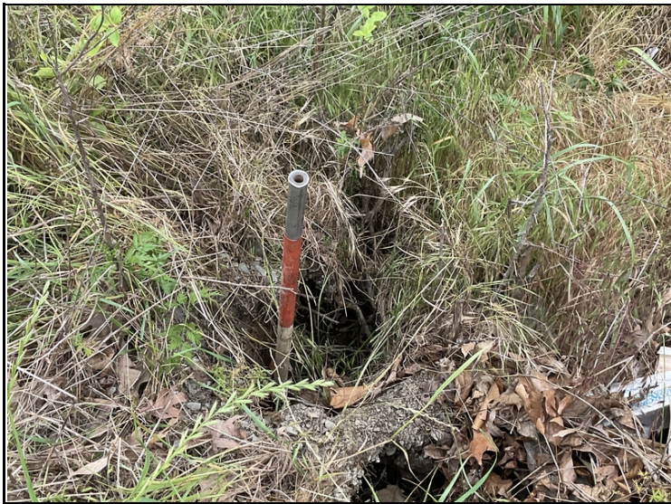
Inlet behind wing erosion

Double 9' x 8' x 246" RC box culvert runs under slope paving under span 1. Culvert wings have some separation from barrels. Culvert has a few spalls with rebar exposed at wing connections.