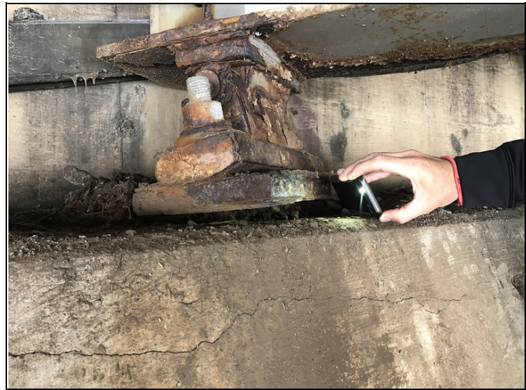
Span 1 bent 1 bearing 7