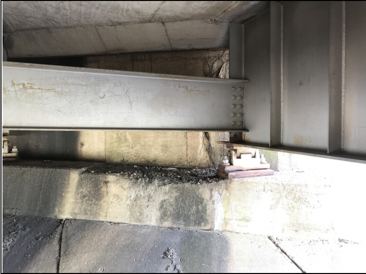
Bent 4 Rt