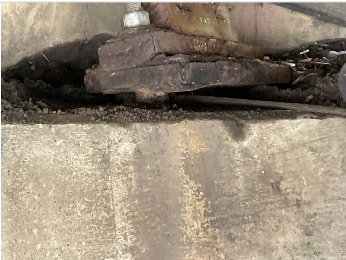
Span 1 bent 1 bearing 8