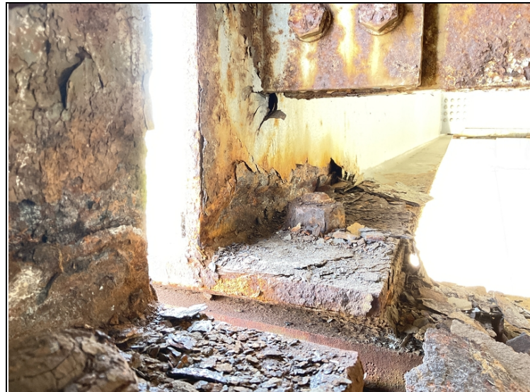
Span 1 bent 2 girder 11 - 1/8" section loss