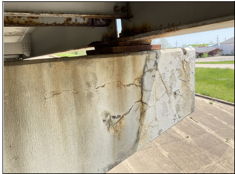
Bent 6 Rt