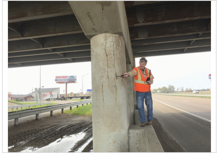
Bent 5 column 2