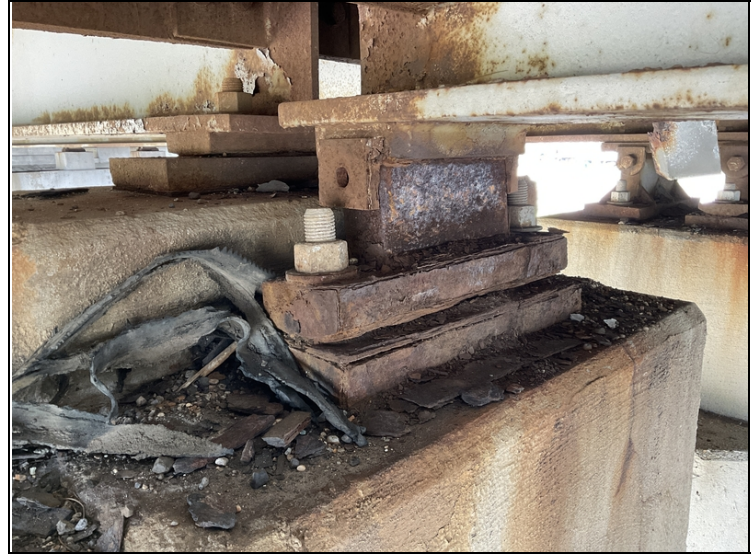
Span 3 bent 3 bearing 9 rocker is loose