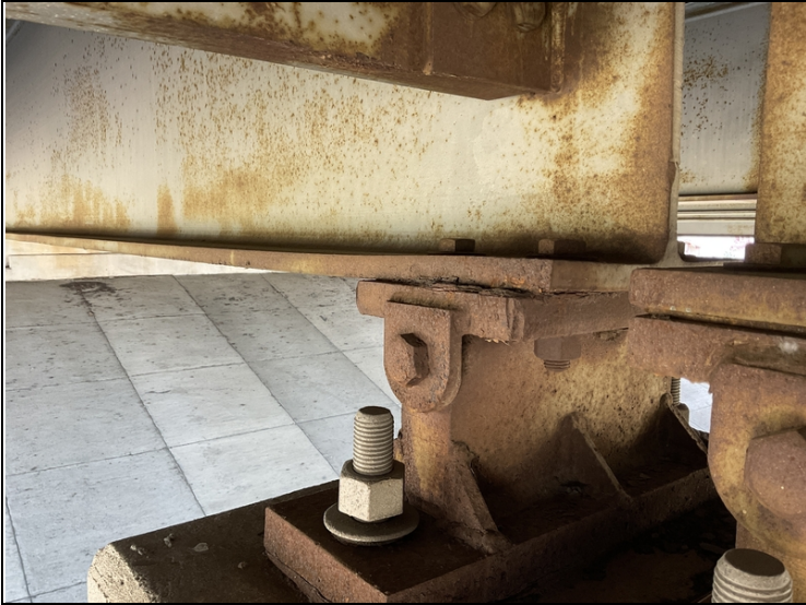
Span 6 bent 6 girder 4 bow