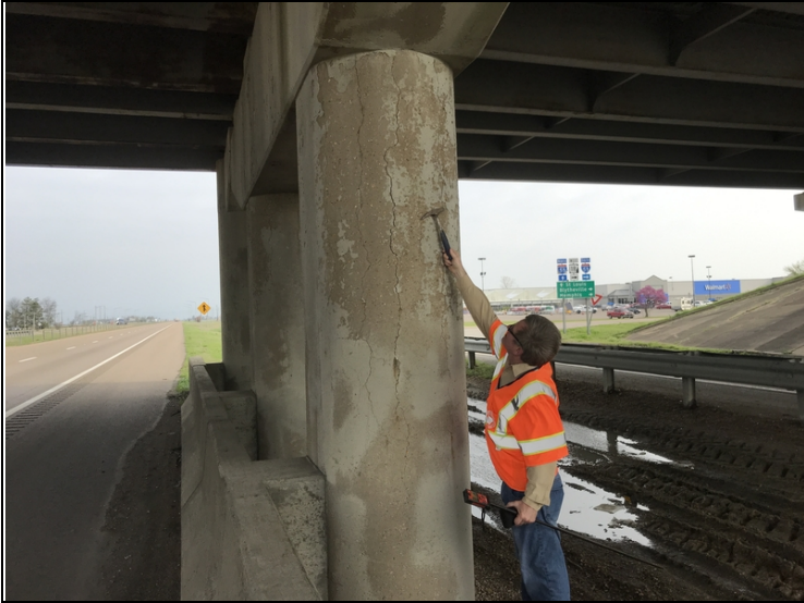
Bent 5 column 3 right