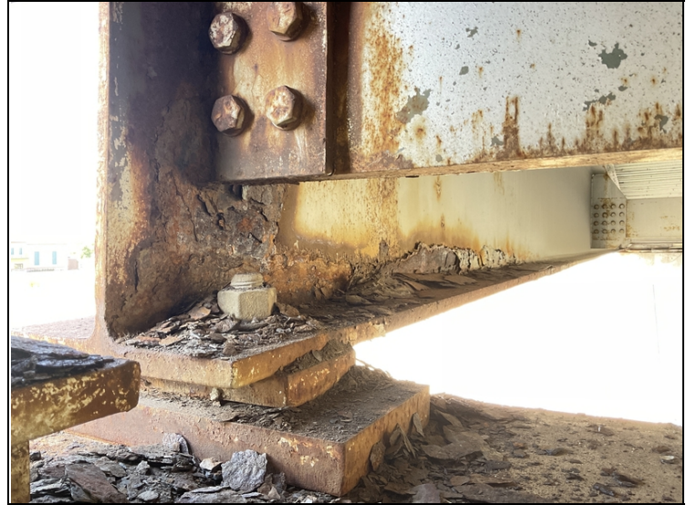
Span 2 bent 3 girder 11