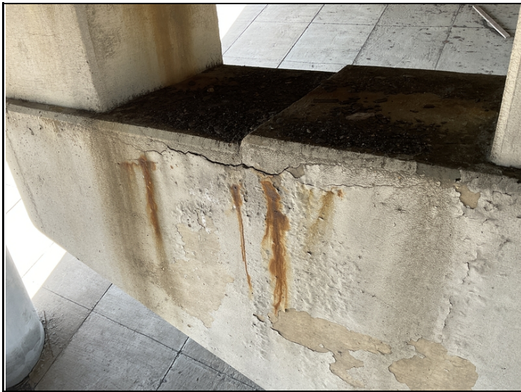
Bent 2 ahead

Bent 2 original cap on ahead side has a 3' crack/delaminated area with rust stains. Bent 6 cap has map cracks with efflorescence under girder 11.