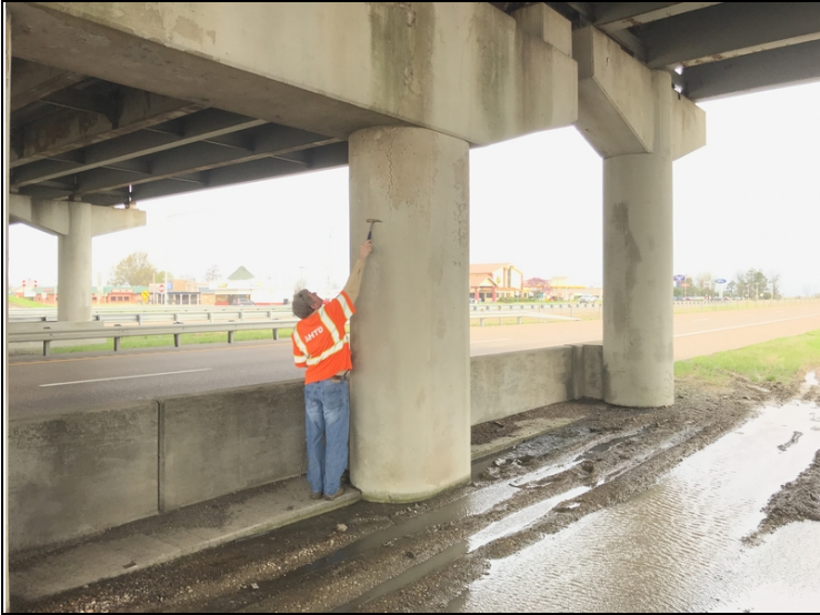
Bent 5 column 2 right