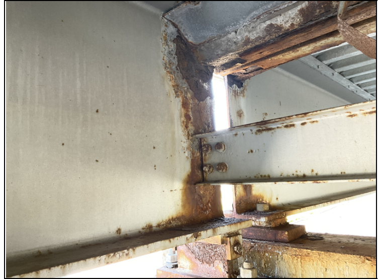
Span 4 bent 5 girder 1