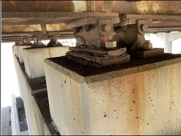
Span 3 bent 3 bearing 4