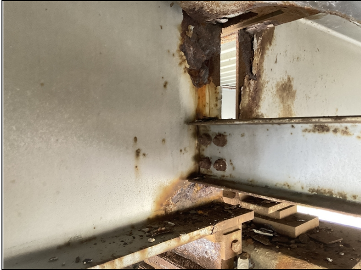
Span 3 bent 3 girder 9