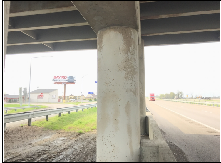
Bent 5 column 3 left