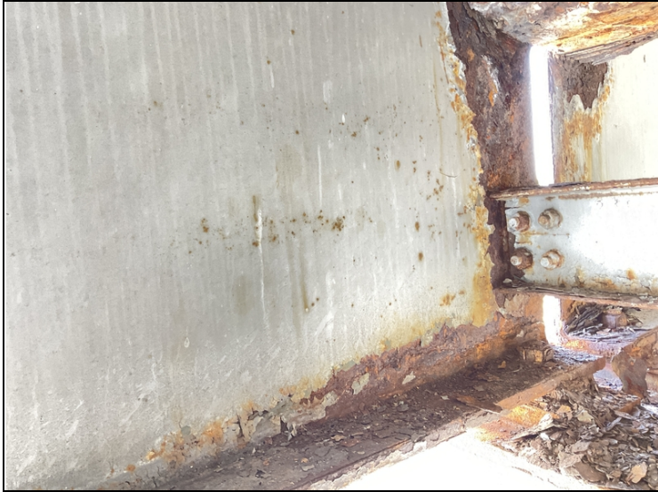
Span 2 bent 2 girder 11