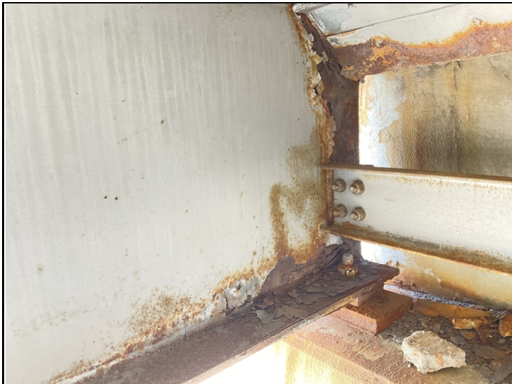
Span 1 bent 1 girder 11