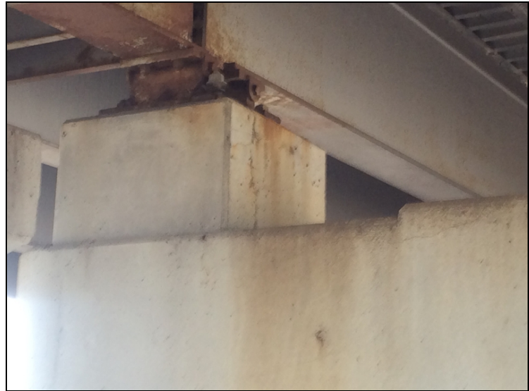
Bent 2 cap