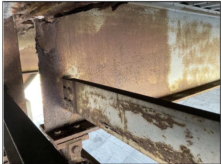
Bent 2 girder 4