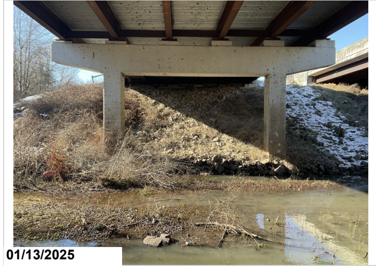
Bent 2, ahead