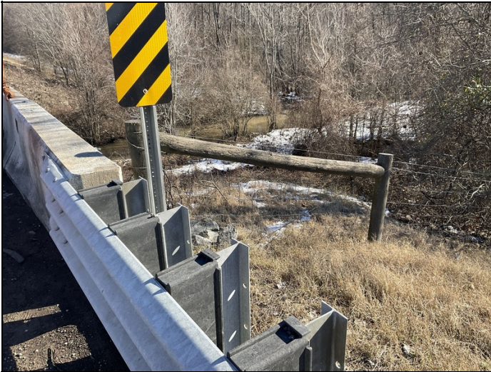
No log mile sign in place

A-64 - Vegetation Removal Requested (Yes)