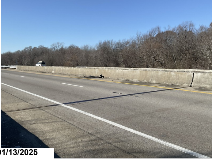
Bridge rail, left side