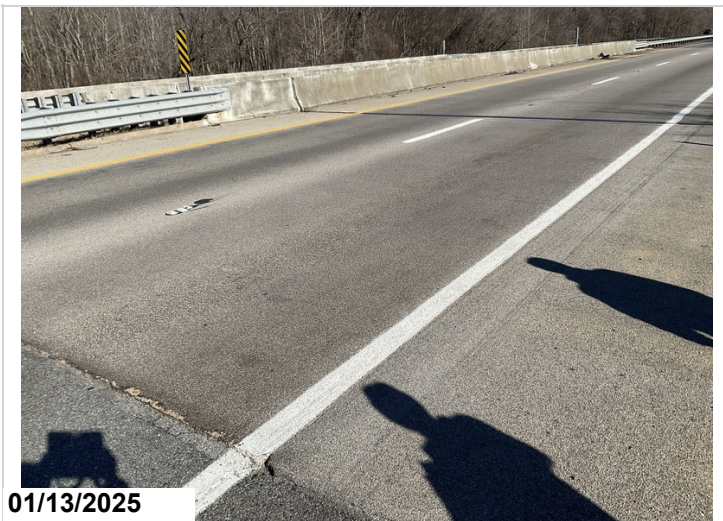
Abutment 1, approach slab