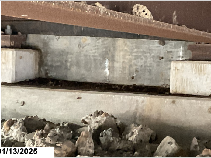
Typical vertical hairline crack in abutment back wall with light efflorescence