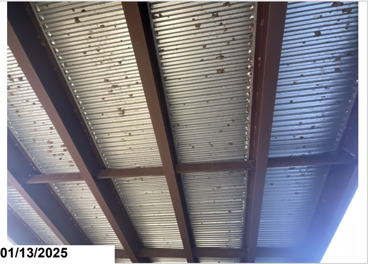
Span 1, underside of deck, typical of other spans.