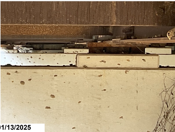
Bent 3, girder 5, right anchor bolt: nut backed off.