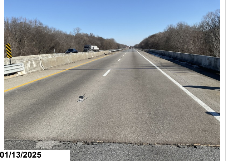
Top view / inventory