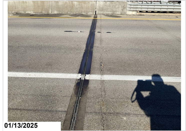
Abutment 2, joint