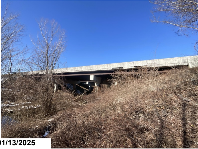
Side view / elevation