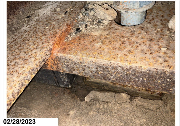
Bent 1 bearing 2, crack in weld to bottom flange.