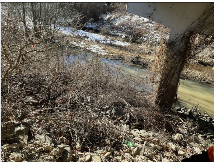
Trees and vegetation growing beside and onto bridge.