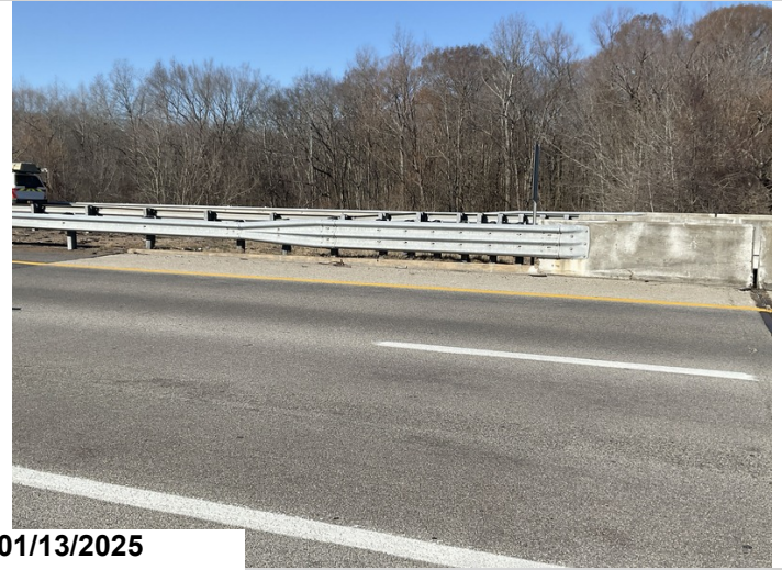
Abutment 1, transition, left side