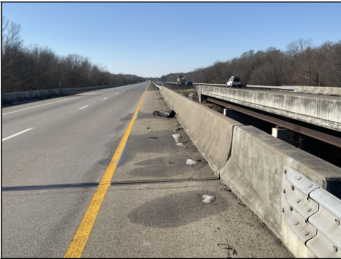
Dirt and debris in gutters