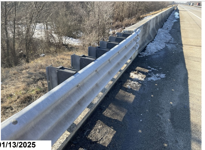
Abutment 2, transition, right side