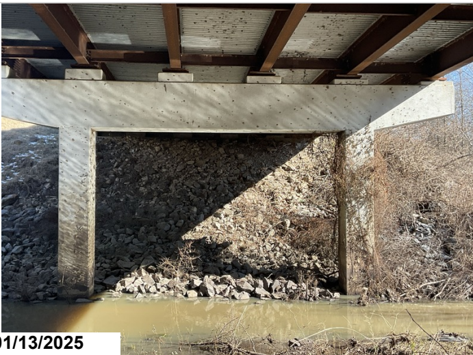
Bent 3, back