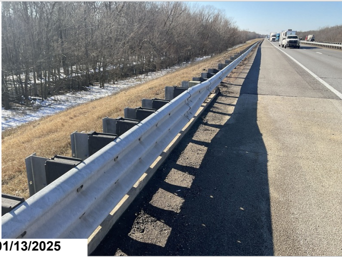
Abutment 1, approach rail, right side