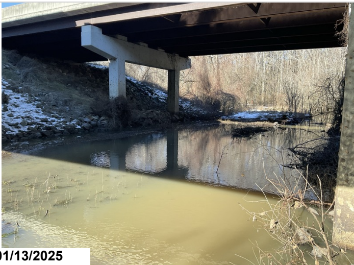
Channel, left side