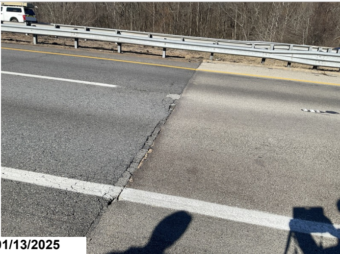
Abutment 1, approach roadway