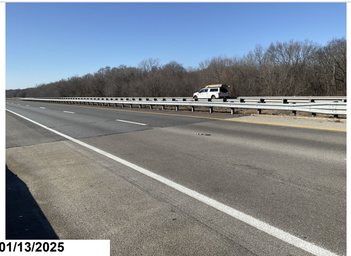
Abutment 1, approach rail, left side