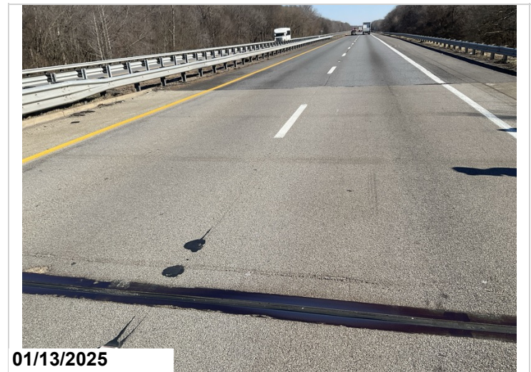
Abutment 2, approach slab