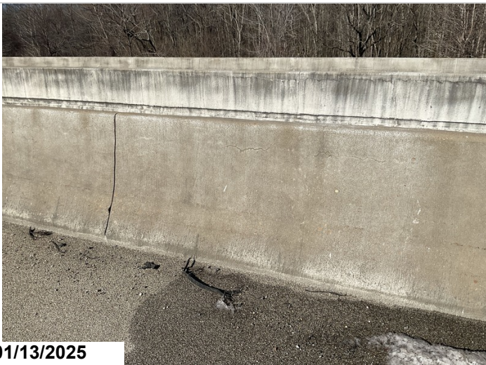
Reinforced concrete bridge rail: typical longitudinal cracking with light efflorescence.