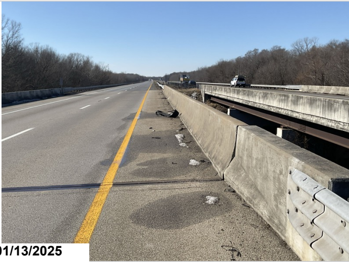
Dirt and debris in gutters