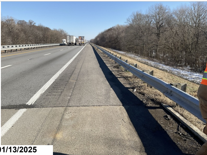
Abutment 2, approach rail, right side.