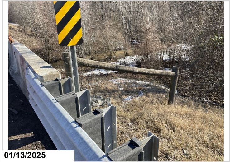
No log mile sign in place