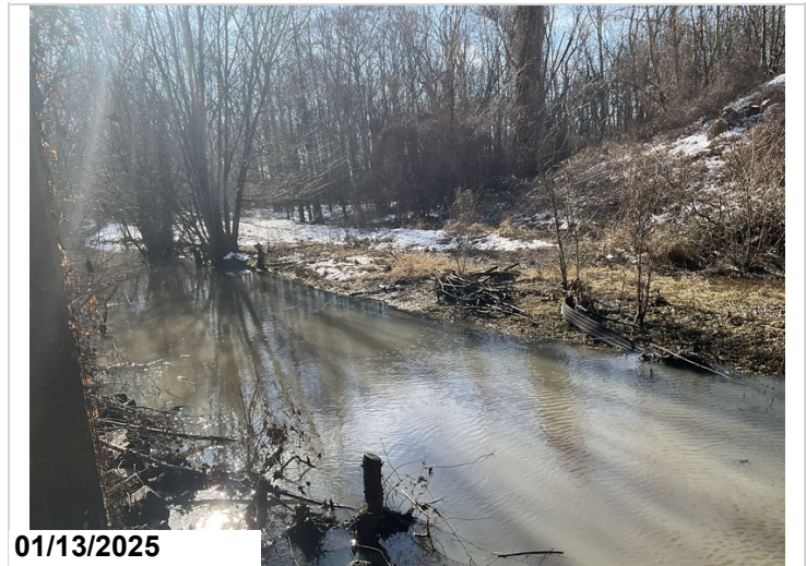
Channel, right side