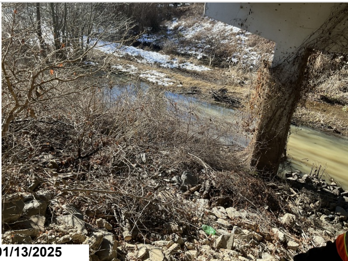
Trees and vegetation growing beside and onto bridge.