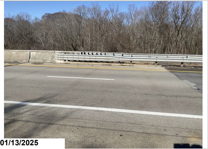
Abutment 2, transition, left side