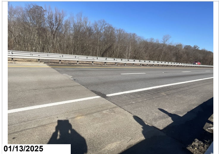
Abutment 2, approach rail, left side