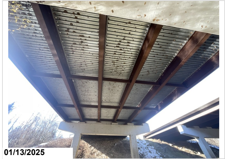
Span 2, undersurface of deck