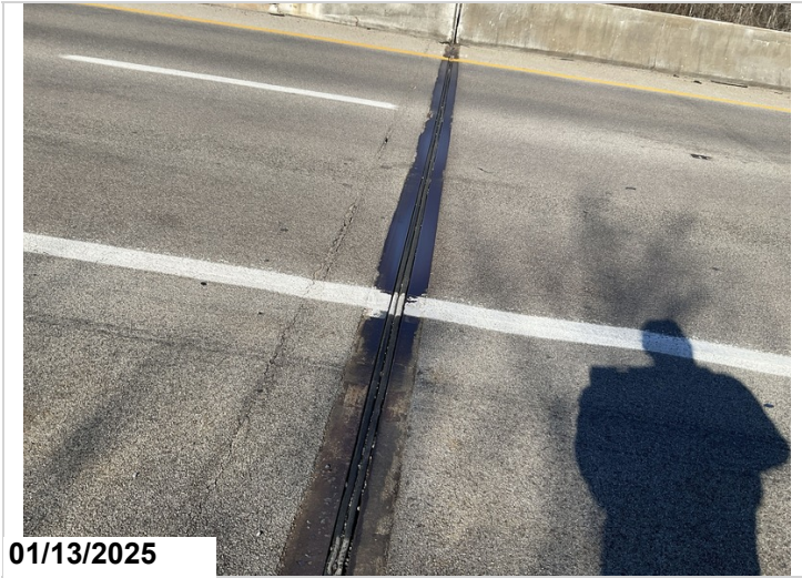
Abutment 1, joint