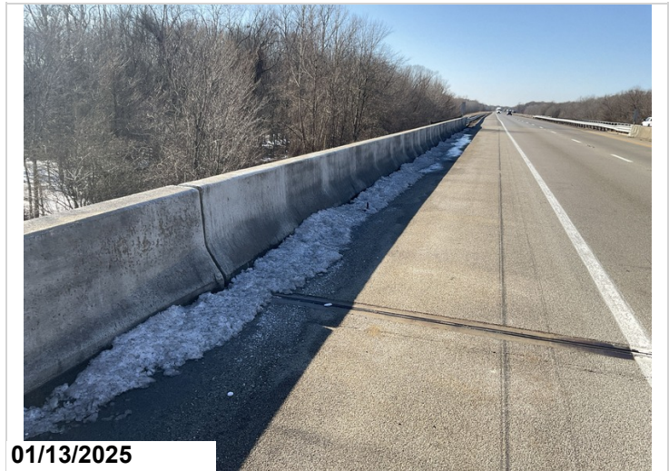
Bridge rail, right side