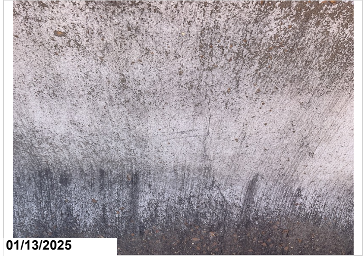
Typical vertical cracking in bridge rail