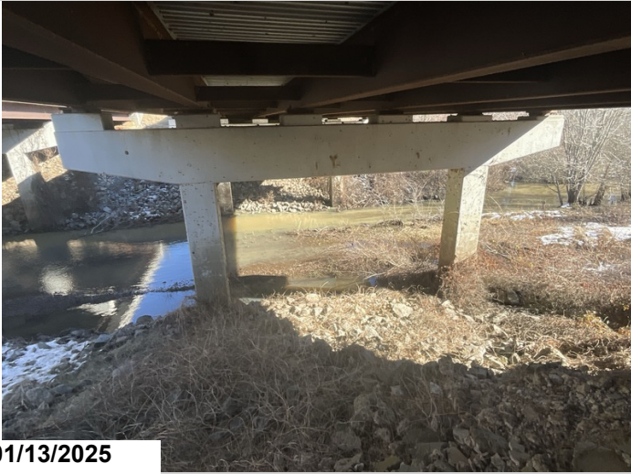
Bent 2, back