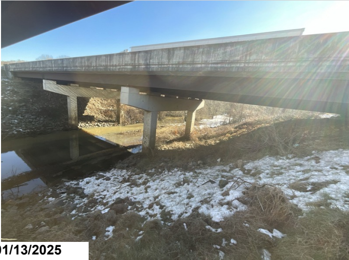
Side view / elevation