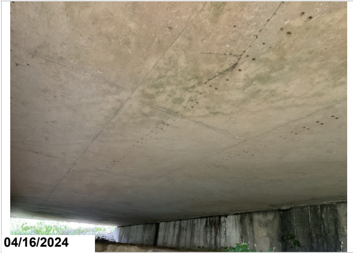
Span 1, soffit / undersurface of deck