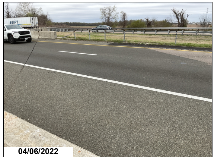
Abutment #2 approach slab