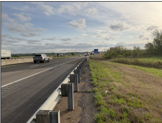
No log mile sign