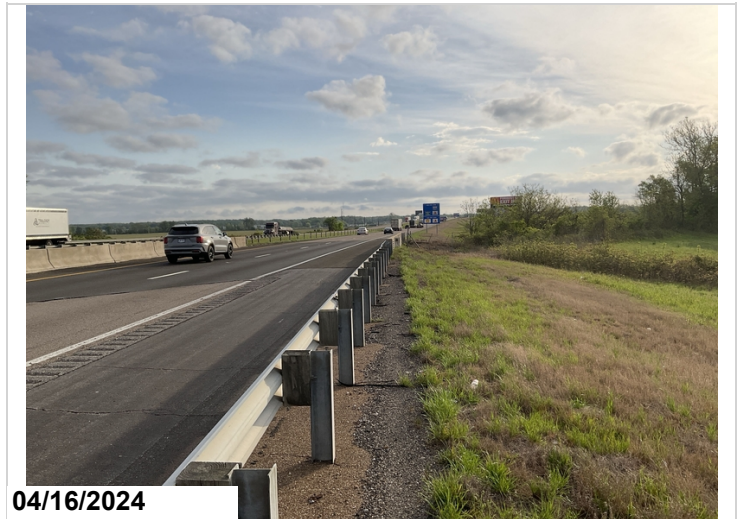
No log mile sign