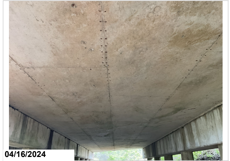
Span 2 soffit / undersurface of deck