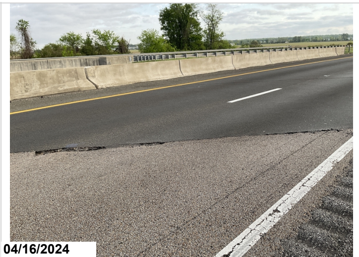
Abutment 1, approach slab