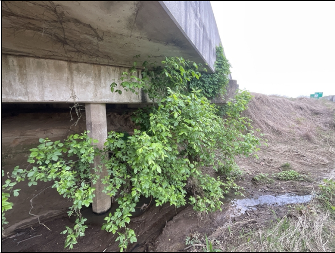
Vegetation growing beside, under and onto bridge

Small trees and vegetation growing beside and under bridge.