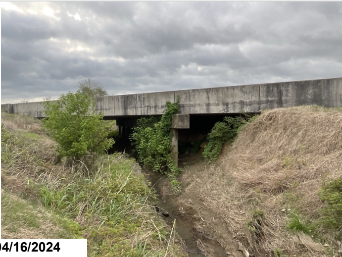
Side view / elevation