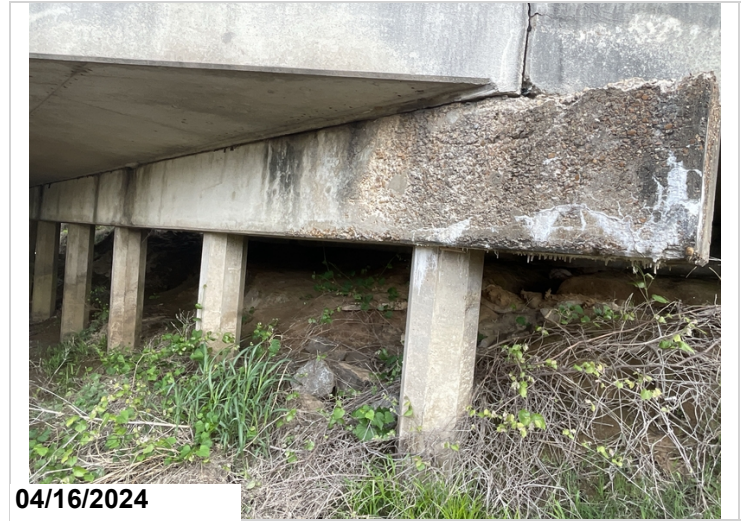
Bent 3, back face