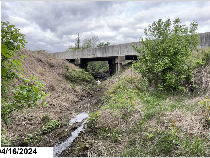
Channel, left side