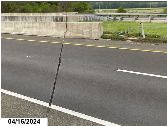
Abutment 2, approach slab: small spall has been repaired.

Approach slabs have had an epoxy overlay since last inspection. 4/16/2024-Spall has been repaired at time of inspection.