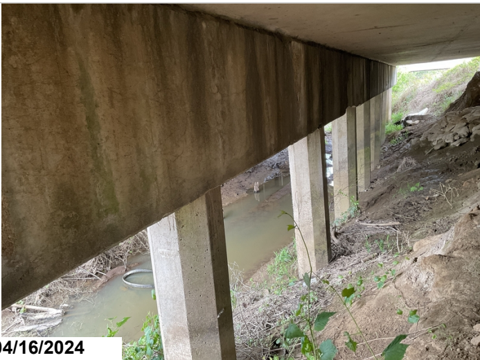
Bent 3, ahead face.