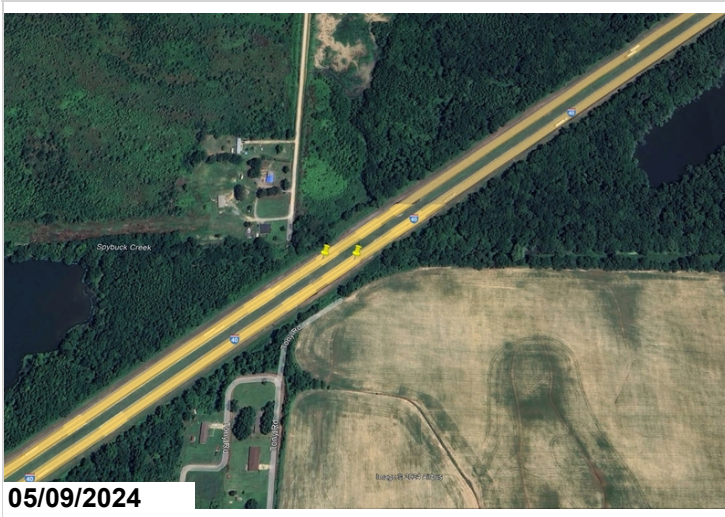
Google Earth Aerial View