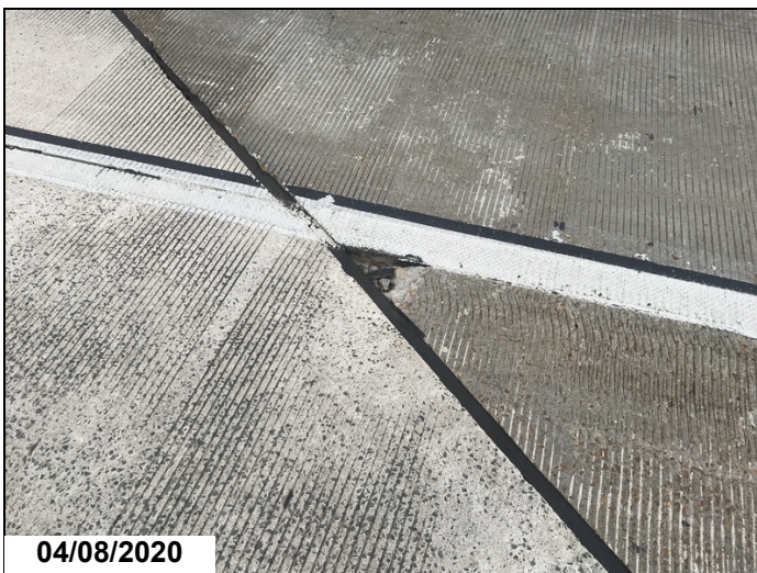
Small spall in abutment 2 approach slab at center line at bridge end.