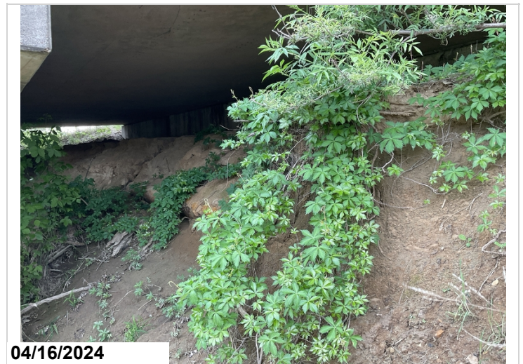
Abutment 1, slope