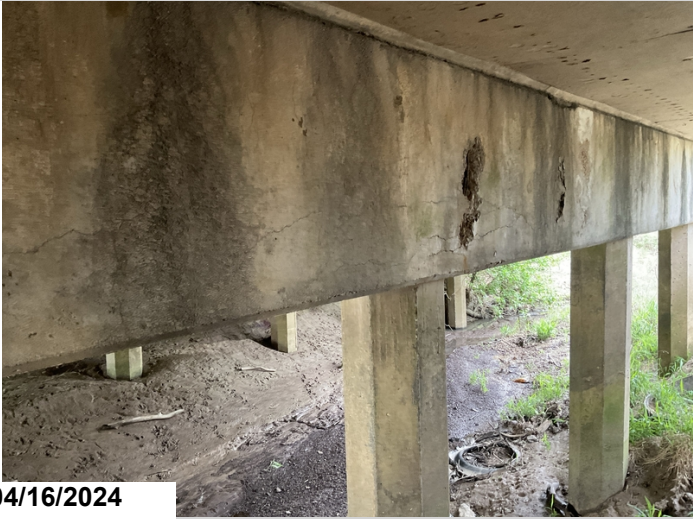
Bent 3, pile cap, ahead face, between piles 2 and 3: two 1' spalls with exposed reinforcing steel with moderate section loss and 6' of cracking.