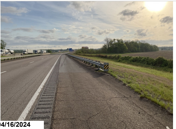
Abutment 1, approach rail, right side