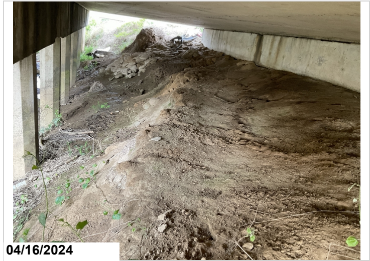
Abutment 2, slope: erosion.