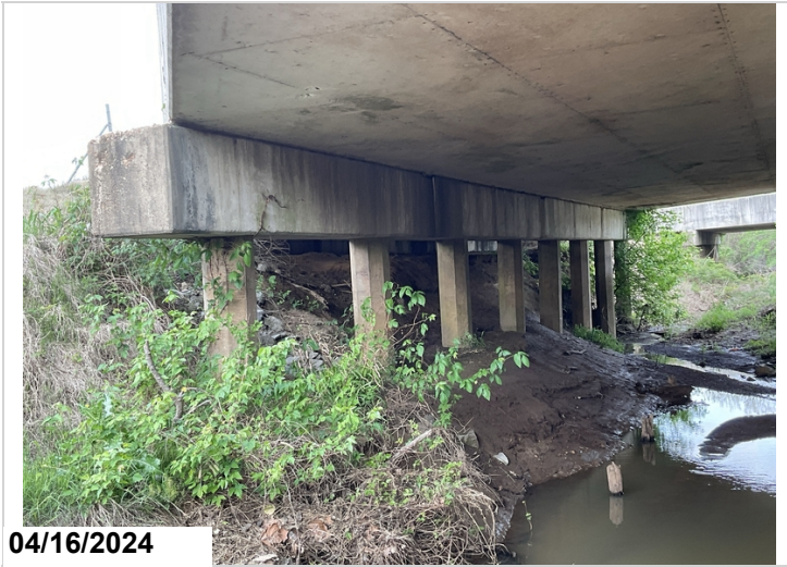
Bent 2, ahead face