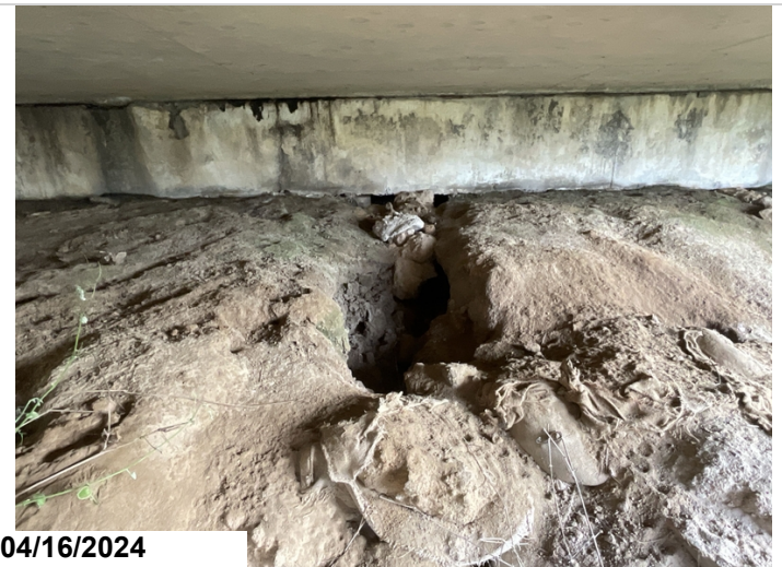
Abutment 2: erosion exposing 1 pile