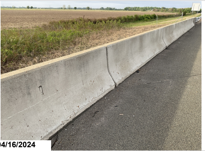
Bridge rail, right side