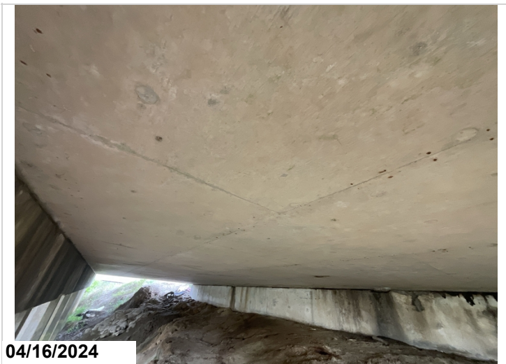
Span 3, soffit / undersurface of deck