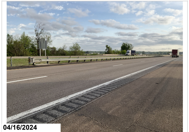
Abutment 1, approach rail, left side, mid span: approximately 20' minor collision damage.