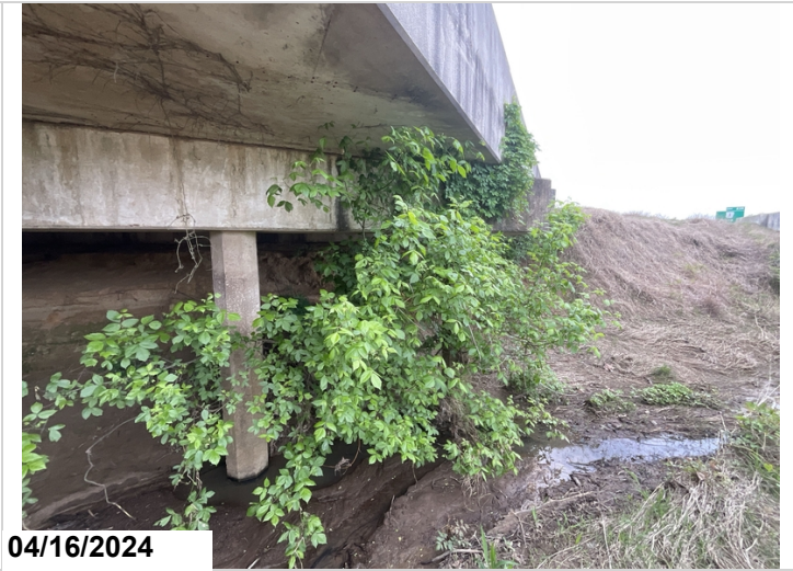
Vegetation growing beside, under and onto bridge