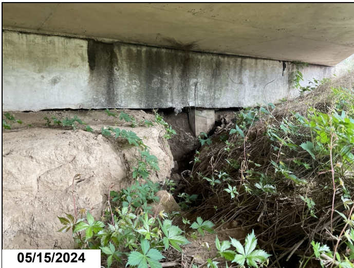
Abutment 1, cap: slope eroded at pile 2 for 4' up to 2' deep, exposing pile 2.