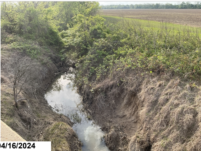
Channel right side