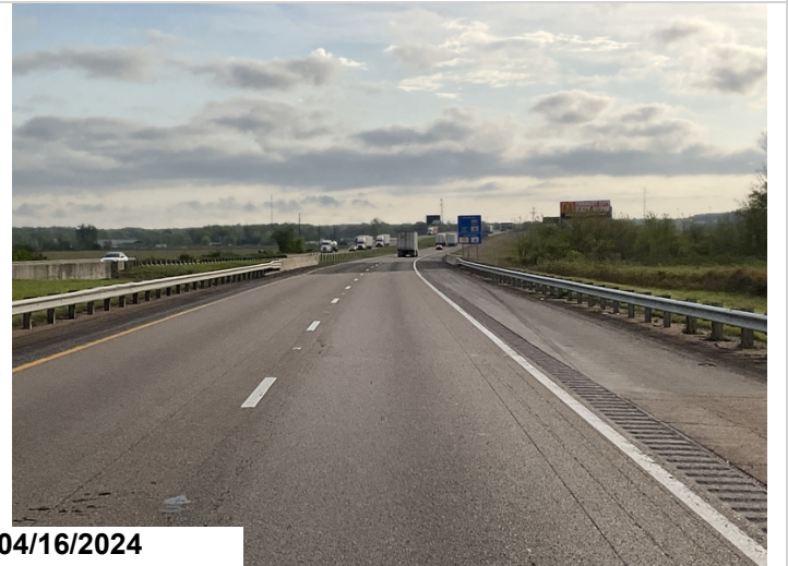
Top view / inventory