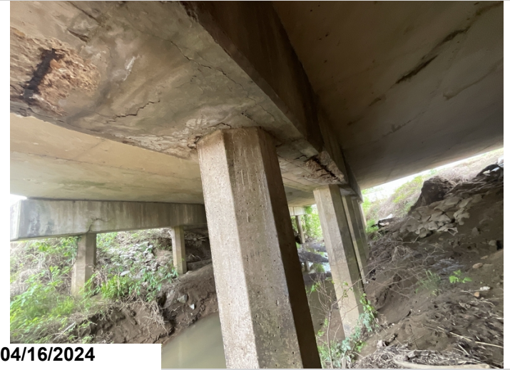
Bent 3, pile cap, bottom face, between piles 5 and 6: spalled with exposed reinforcing steel with moderate section loss. 6LF CS3