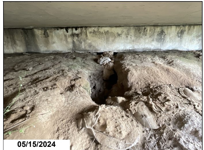
Abutment 2: erosion exposing 1 pile