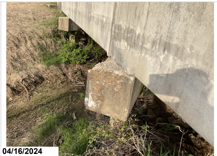
Bent 3, pile cap, right end heavily scaled with loose aggregate