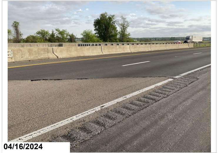
Bridge rail, left side