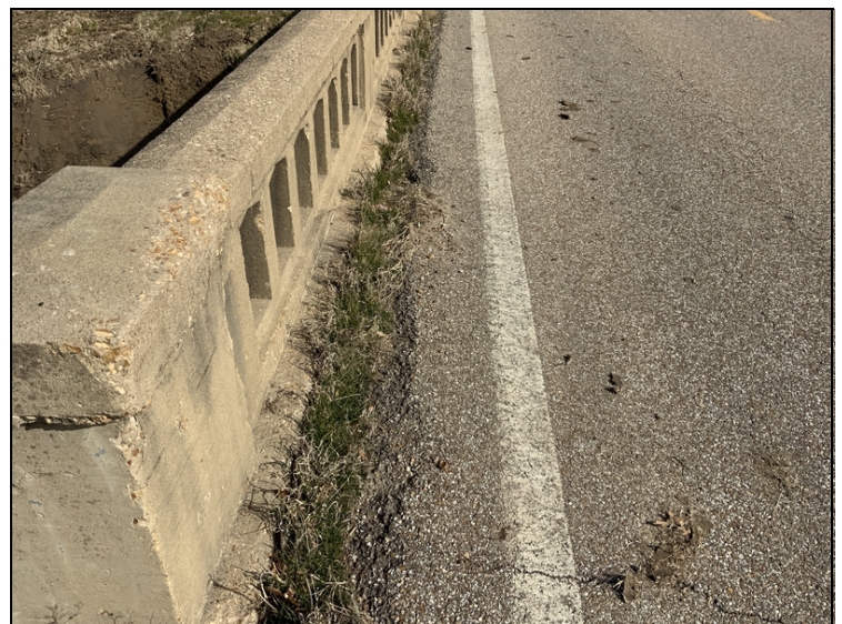
Dirt, debris and vegetation growing in gutters.