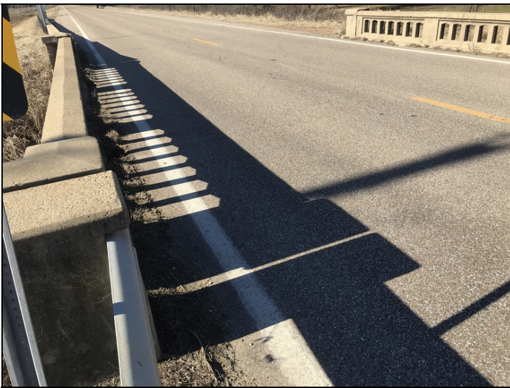
Gutters are full of dirt and debris.