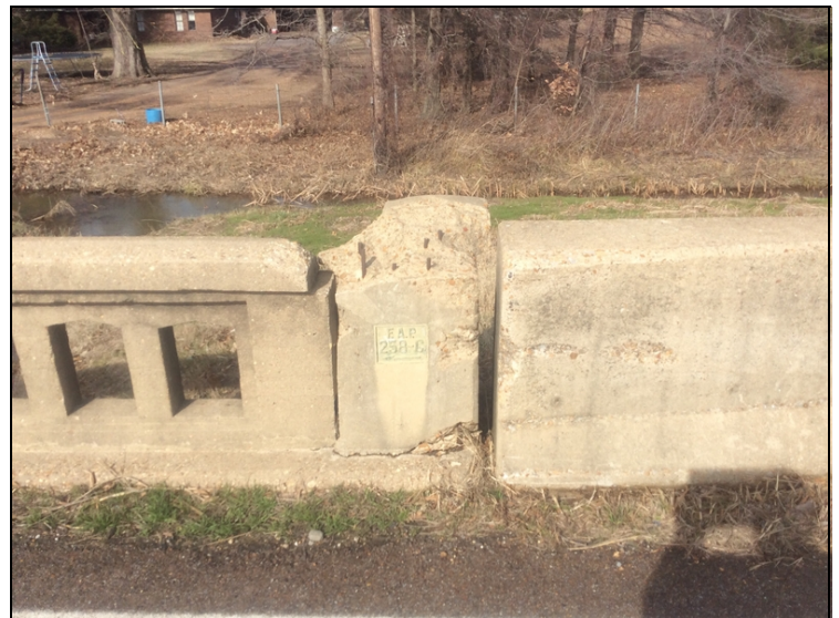
Abutment #2 left monument post