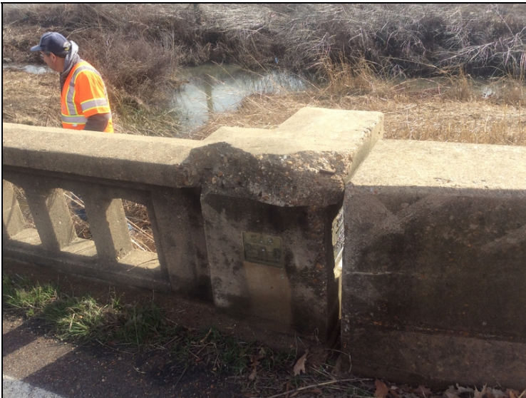
Abutment #1 right monument post