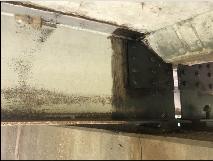
S4 b4 g3