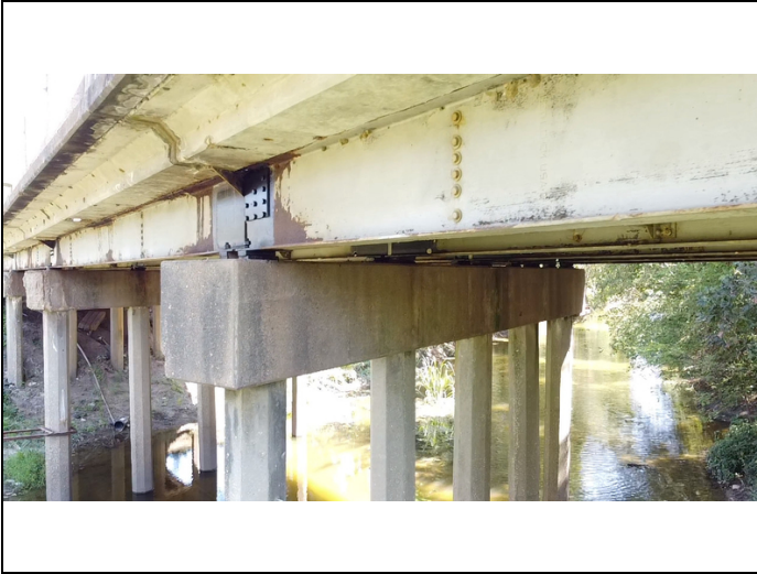
S2 B3 G1 bolted haunch