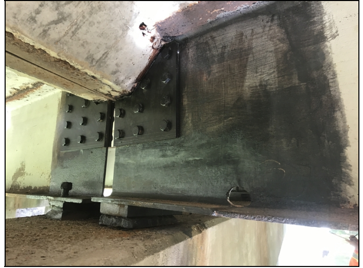
S3 b4 g2