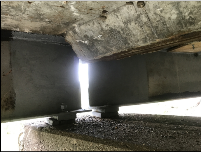
S4 b5 g1 & s5 b5 g1