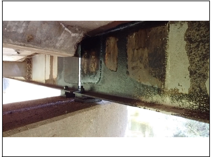
s2 b3 g5