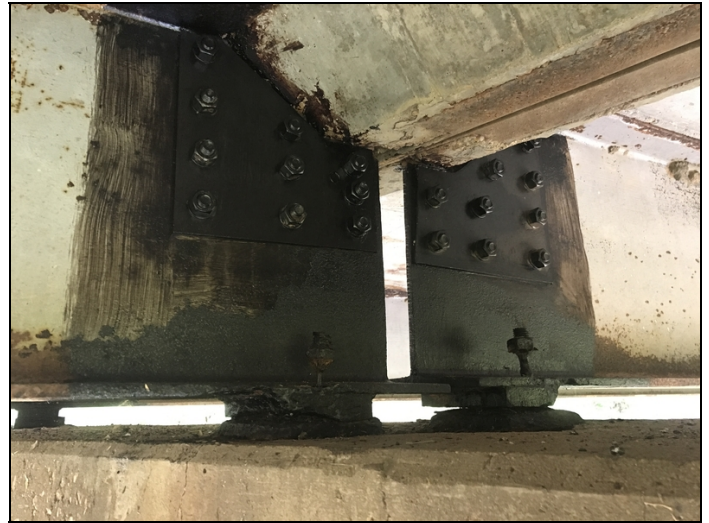
S4 b4 g4