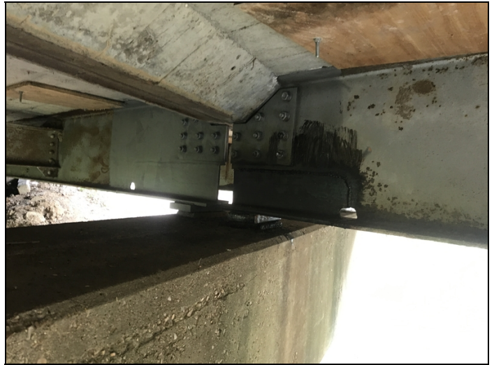
S4 b5 g4 & s5 b5 g4