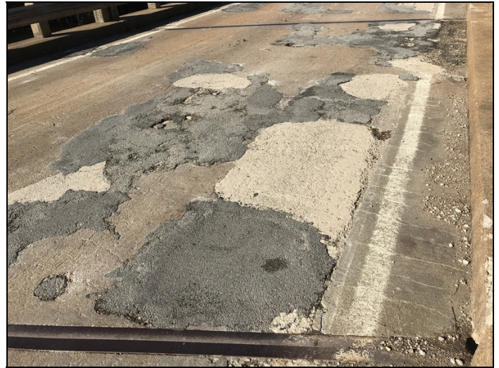
Span 2 Deck