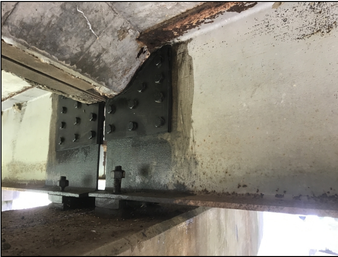
S3 b4 g3