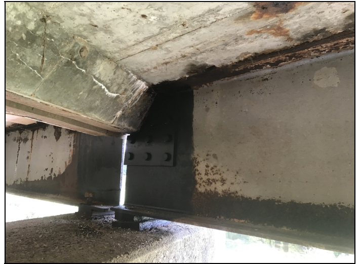
S4 b4 g1