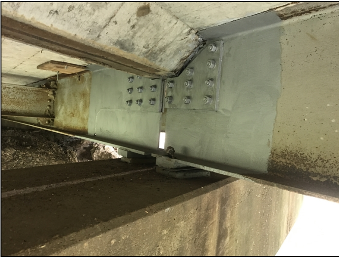
S4 b5 g3 & s5 b5g3