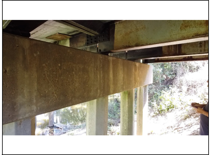
S1 B2 G3 bolted haunch plate S2 B2 G3 bolted haunch & T-splice