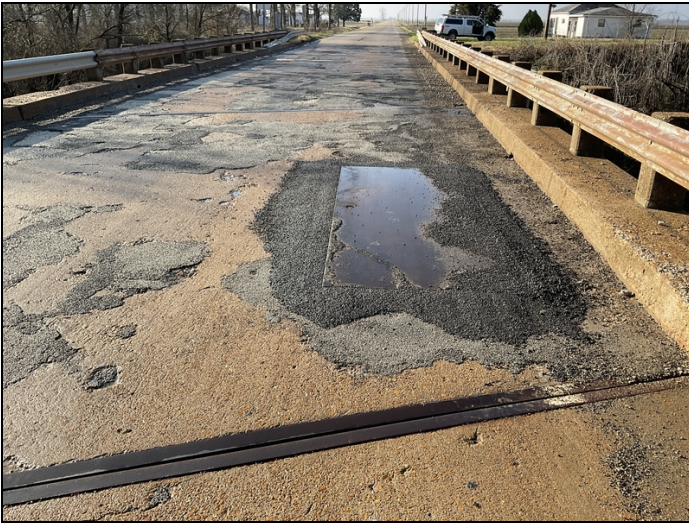
S4 plate over deck failure