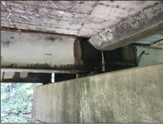
S3 b3 g4