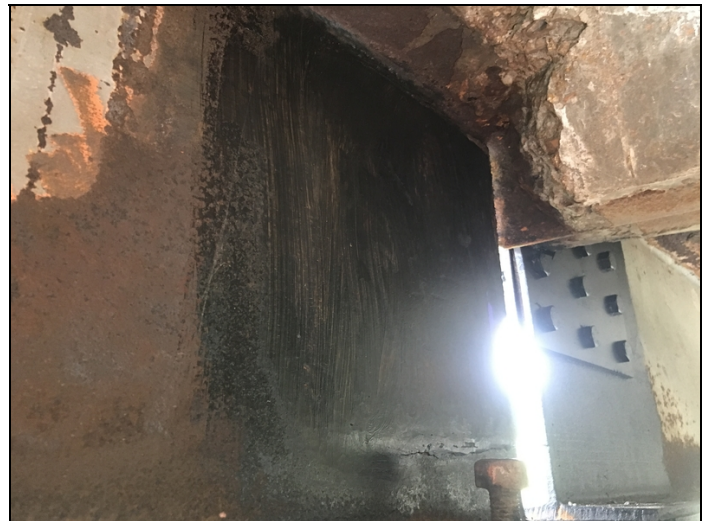
S3 b4 g1