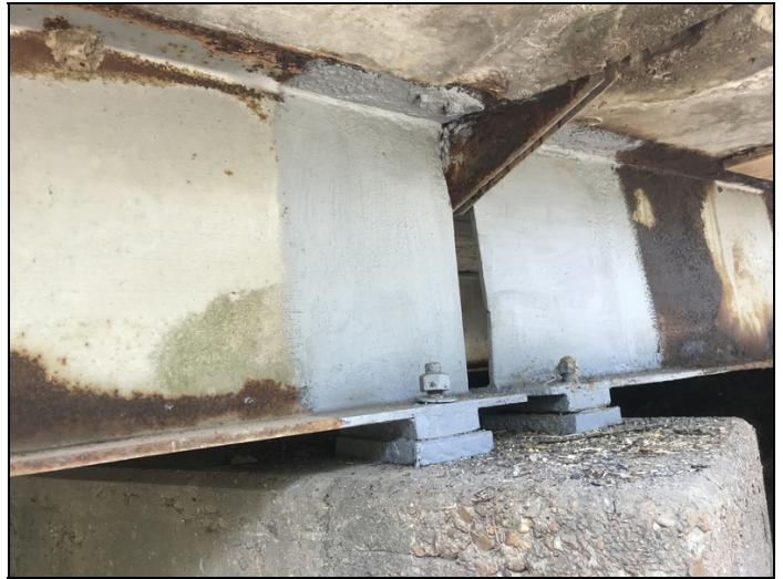
S4&5 b5 g5