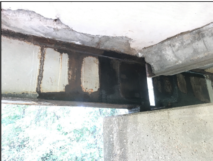
S3 b3 g5