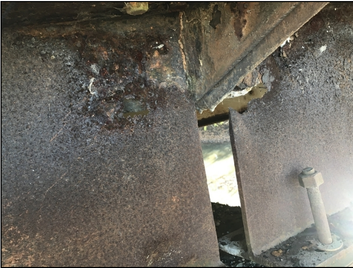
Span 4&5 bent 5 girders 1