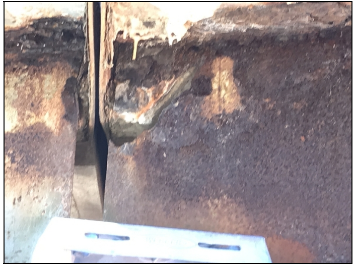
Span 5 bent 5 girder 5