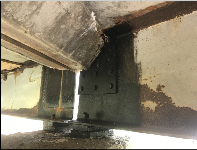
S3 b4 g5