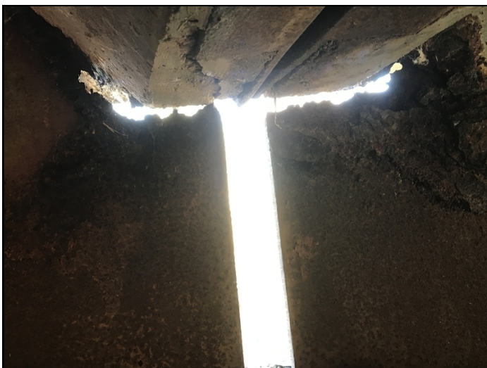
Span 1&2 bent 2 girders 1