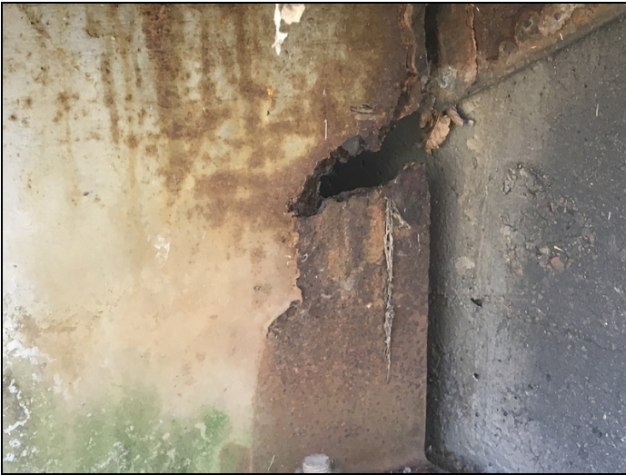
Span 5 bent 6 girder 5