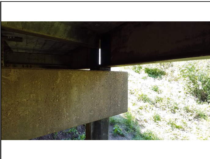
s2 b2 g1