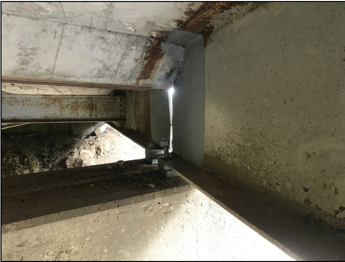
S4&5 b5 g5