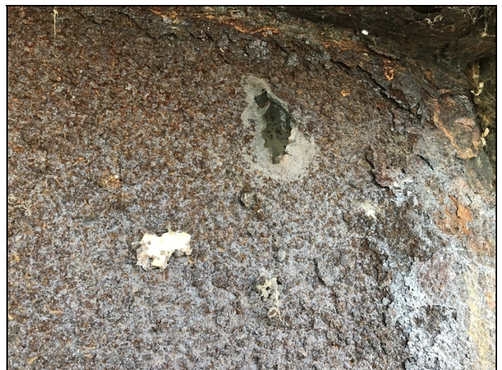
Span 2 girder 5 bent 3