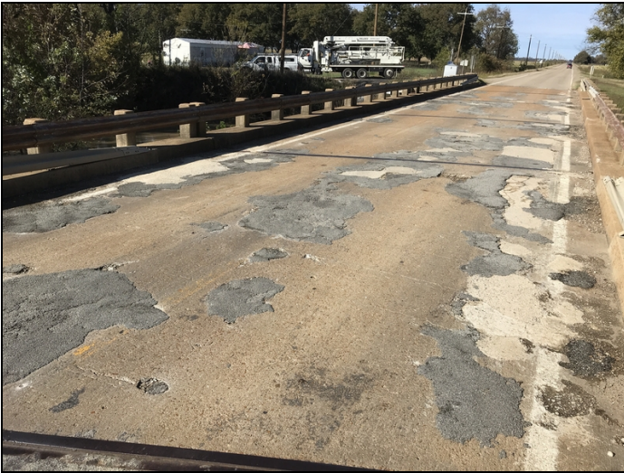
Overall View of Deck