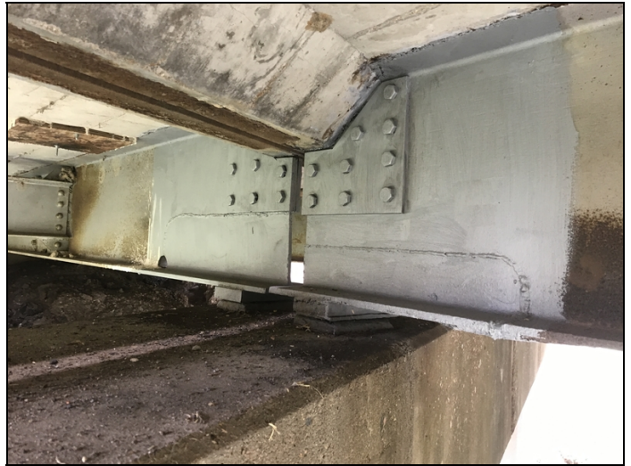
S4 b5 g2 & s5 b5 g2