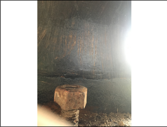
S3 b4 g1