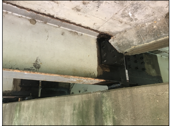
S3 b3 g3