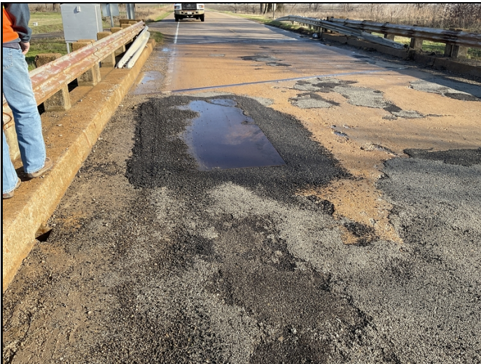
S4 steel plate

Hole in deck has been chip out and repaired with concrete by District bridge crew. 9/27/2022 CCP