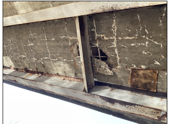
Bay 1 span 4 bottom of deck