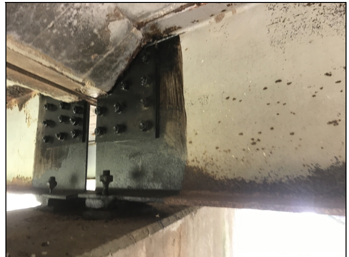
S3 b4 g4