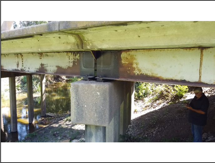
S1 & 2 B2 G1 welded