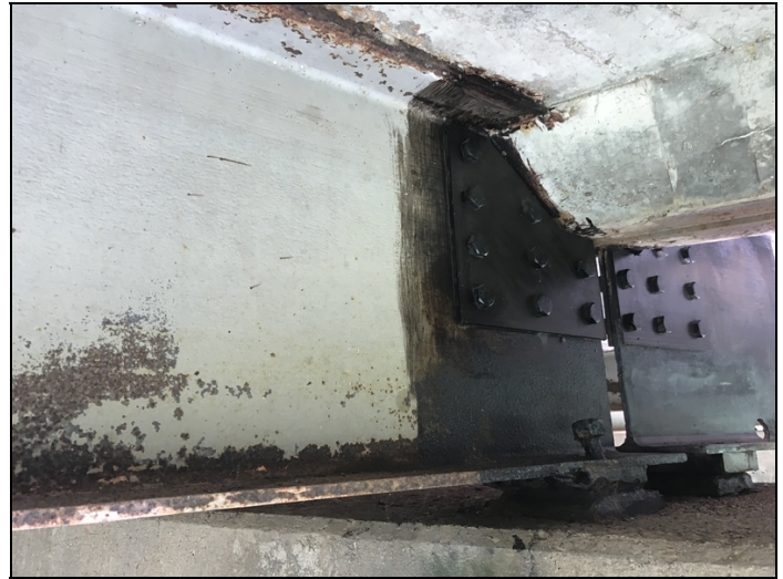
S4 b4 g2